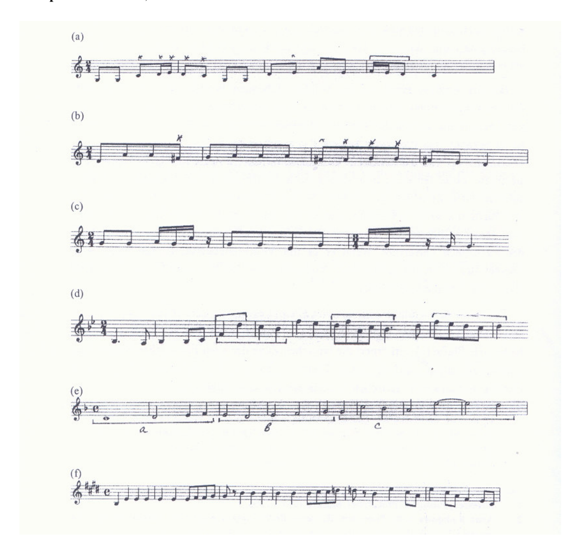
Example 1 Prokofiev, "Russian Overture"

Despite the contrast, all the themes are derived from the same essential idea. Therefore, it is easy to combine them. For example, theme "e" sounds together with "f" (Fig. 35) 43 and theme "a" appears with "e" (Fig. 54). The dance-like themes are usually symmetrical (2+2) in 2/4. They are also characterized by syncopated rhythm and by the play of weak and strong beats. It may be suggested that the first theme ("a") is derived from the Russian folk song U menia vo sadochke (although Prokofiev didn't mention it).