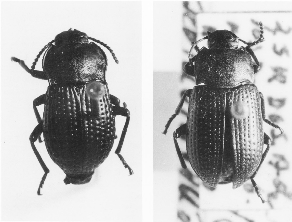
Figure 1. A) Opatrinus armasi n. sp. Paratype, female OHG - 1185, collected 2.5 km from San Antonio de los Baños, La Habana. B) Opatrinus pullus Sahlberg, female OHG - 1195, collected 2.5 km from San Antonio de los Baños, La Habana.

Antenna with hairs in each segment, gradually enlarged toward the terminal segment which is the widest; the second segment largest, the third segment a bit smaller, but longer than the rest.