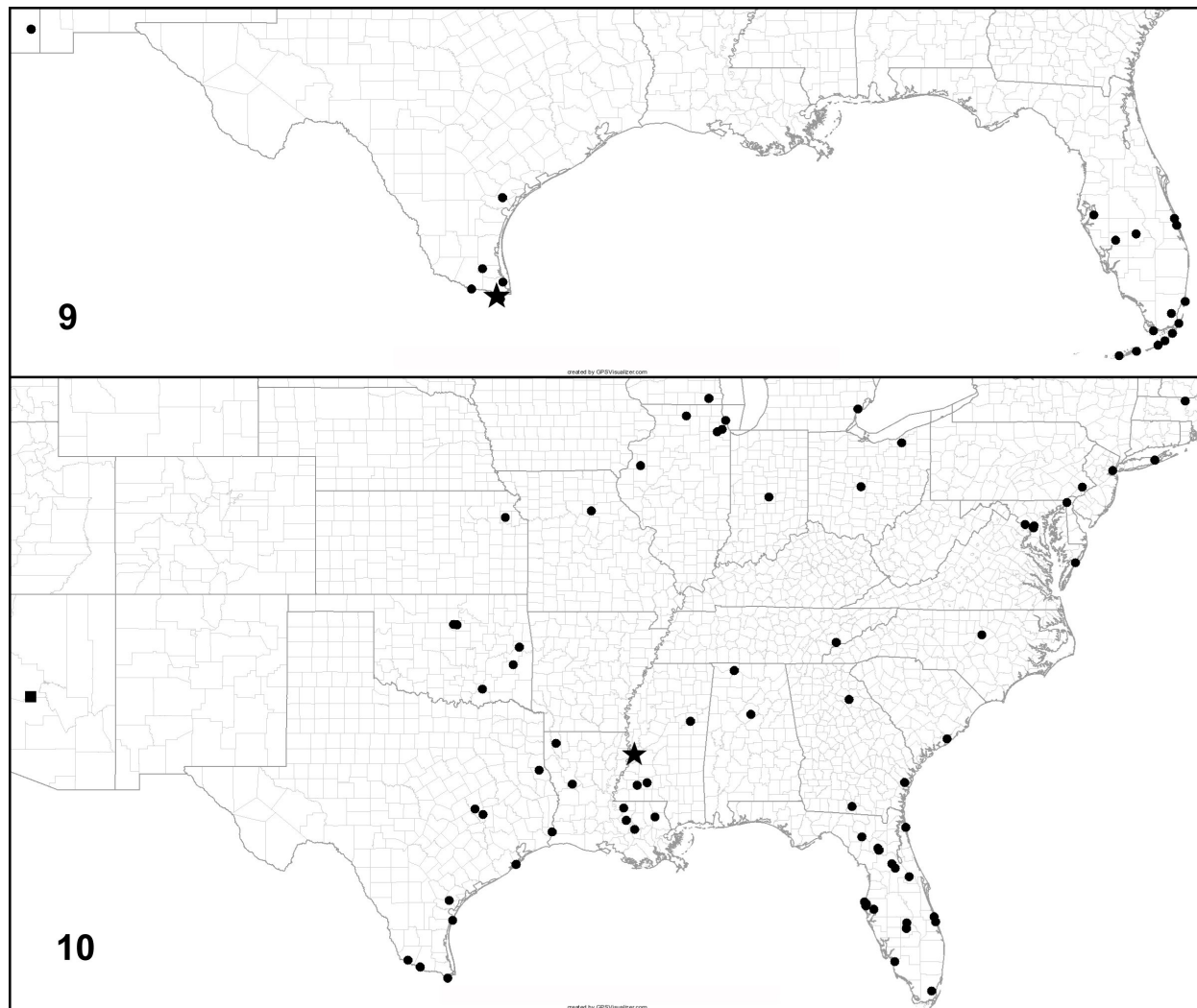
Figures 9-10. Distribution of Xanthocomus spp. in North America (star = type locality; square = state record only). 9) X. rutilans . 10) X. concinnus .

2009, UV light, palm forest, E.G. Riley-1037 (1, TAMU); Laguna Atascosa NWR (site 1), 26.22375°N, 97.35454°W, 25 Mar 2009, dense coastal brush, beating, J. King & E. Riley-594 (1, TAMU); vicinity Southmost School, 01 May 1979, C.L. Smith (1, UGCA); Brownsville, 01 Jun 1904, H. Barber (1, USNM); same but 08 Jun 1934, J.N. Knull (1, OSUC); same but 08 May 1935 (1, OSUC); same but 07 Apr 1950, D.J. & J.N. Knull (1, OSUC); same but 04 Jul 1939, J. Russel (1, SEMC); same but 04 Mar 1936, on cotton roots in soil, P.A. Glick (1, TAMU); same but 06 March 1936 (1, TAMU); Hidalgo Co.: Santa Ana National Wildlife Refuge, Willow Lake, 13 m, 26°04[.]832'N, 98°08[.]458'W, 07 Feb 2005, C.L. & S.L. Staines (1, USNM); same except Jaguarundi Trail, 23 m, 26°03[.]727'N, 98°08[.]458'W, 09 Feb 2005, C.L. & S.L. Staines (6, USNM); Santa Ana National Wildlife Refuge, 25 m, 26°05[.]041'N, 98°08[.]194'W, 22 Jan 2005, blacklight, C.L. & S.L. Staines (1, USNM); Lower Rio Grande Valley NWR, La Coma (site 2), 26.05611°N, 98.03635°W, 09 Apr 2009, re-vegetated site, beating, J. King & E. Riley-697 (1, TAMU); same except 23 Apr 2009 and J. King & E. Riley-806 (2, TAMU); San Patricio Co.: Welder Wildlife Refuge, 27 Sep 1976, blacklight trap, R. Turnbow (1, FSCA); Willacy Co.: Lower Rio Grande National Wildlife Refuge, East Lake Tract, 22 m, 2[6]°31[.]462'N, 97°52[.]291'W, 25 Jan 2005, C.L. & S.L. Staines (2, USNM).