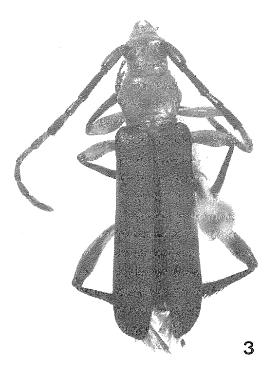
Figure 3. Ethemon brevicorne, new species, holotype female.