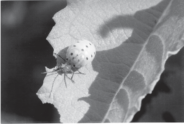
Figure 2. A gravid female of Metacycla insolita J. L. LeConte on its host.