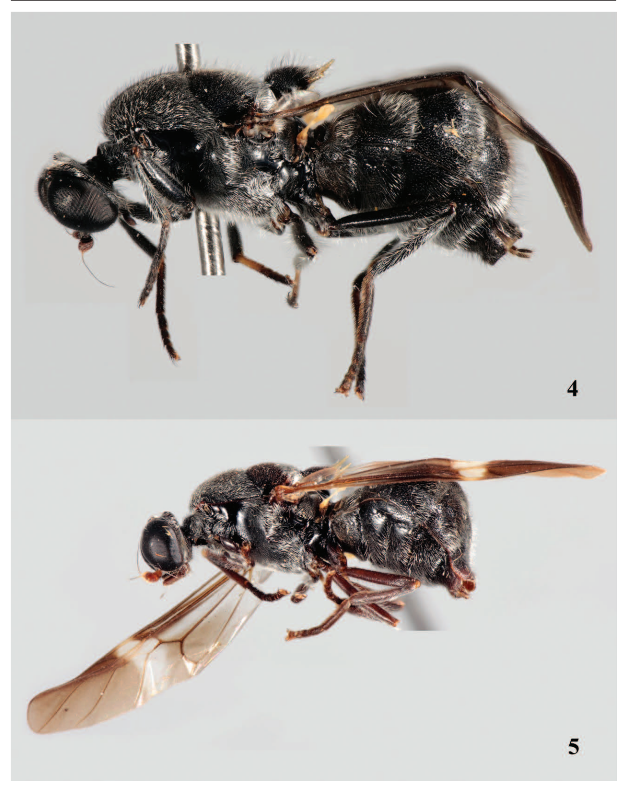
\textbf{Figures 4-5.} \ Lateral\ habitus\ view\ of\ \textit{Culcua}\ species.\ \textbf{4)}\ \textit{Culcua}\ lingafelteri, female\ holotype.\ \textbf{5)}\ \textit{Culcua}\ argentea, female\ paratype.