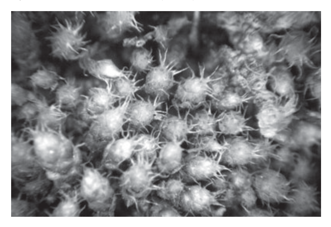
Fig. 2: Aspect of Bryum lanatum (Ivory Coast, Porembski 19, BONN)

were revised by him to B. argenteum or Brachymenium angolense . Nevertheless Ochi treated B. arachnoideum as a good species in his survey of the African Bryoideae (Ochi 1972), however, did not cite three of the five specimens, neither under Bryum arachnoideum , B. argenteum or Brachymenium angolense .