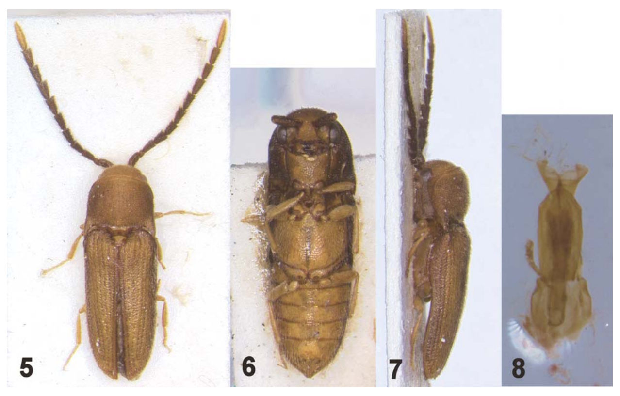
Figures 5-8. Adelorhagus lateralis Horn, syntype. 5-7) Dorsal, ventral and lateral. 8) Aedeagus, ventral view.

Aedeagus (Fig. 4): Basal piece elongate, caudally rounded; basally narrowed, apical two-thirds widened; lateral lobes elongate, simple, apically rounded, clusters of elongate setae present near apices; secondary lateral lobes short, hidden between lateral lobes; median lobe basally widened, elongate, apically bilobed, clusters of elongate setae present near apex.