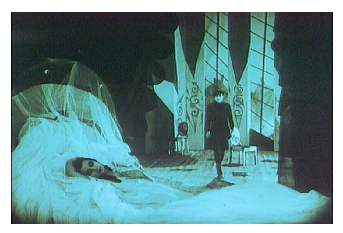
Fig. 8 – Jane's attack, The Cabinet of Dr. Caligari