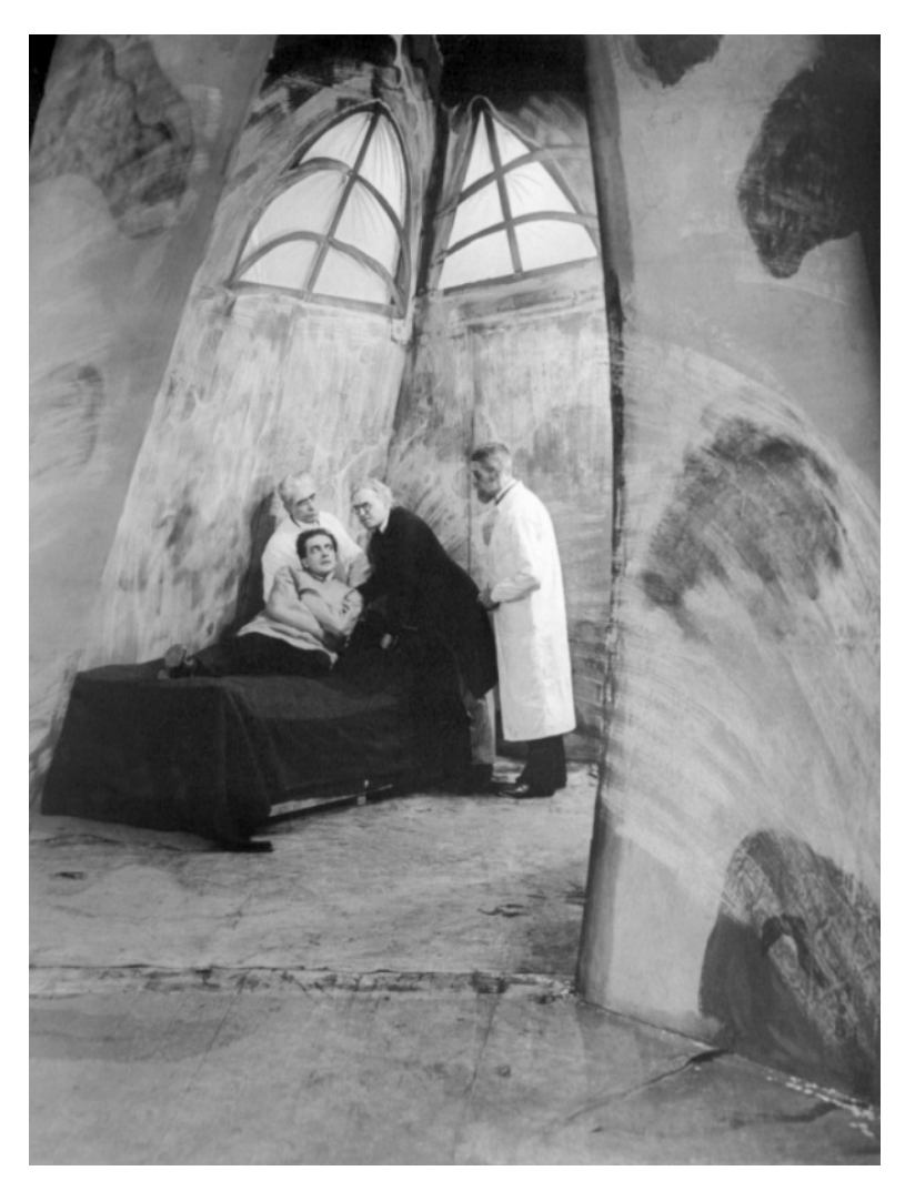
Fig. 7 – Asylum, The Cabinet of Dr. Caligari