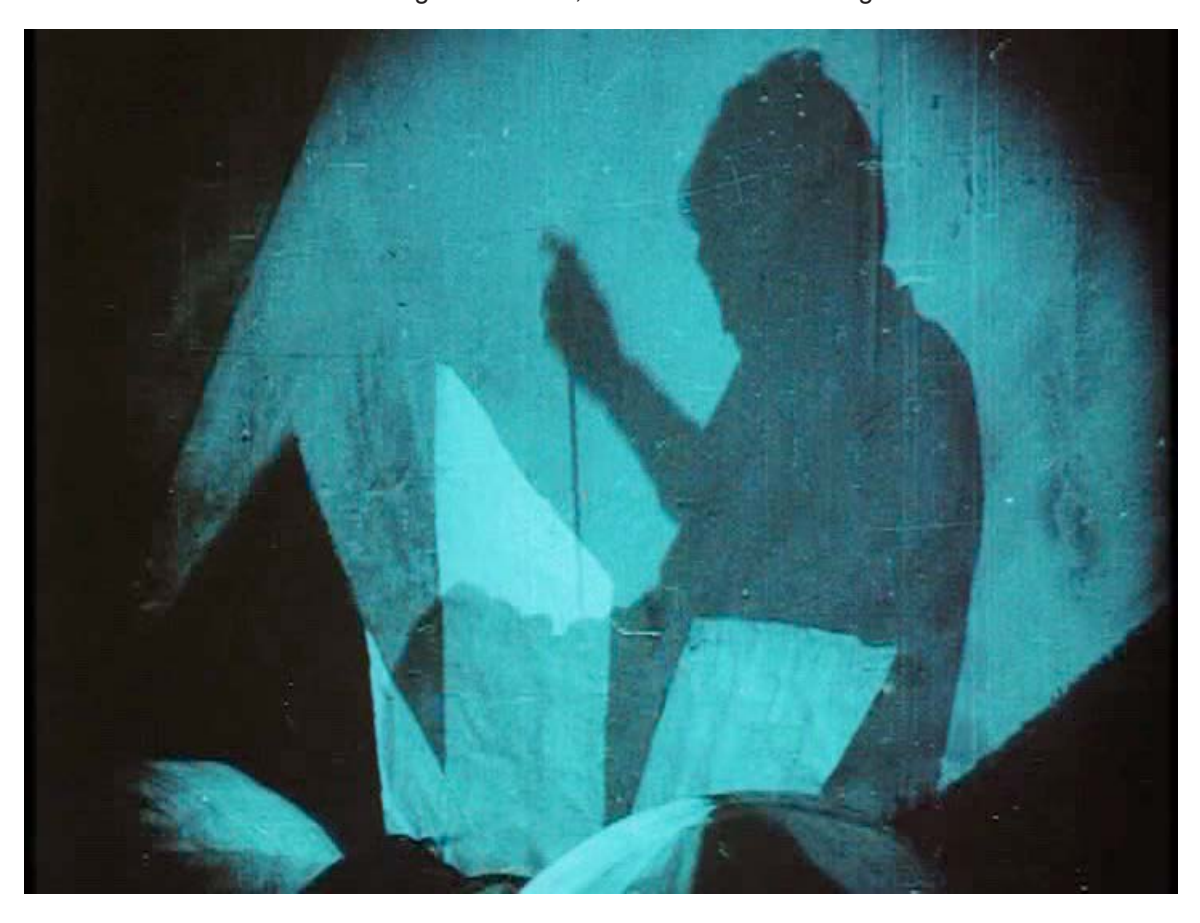
Fig. 6 – Alan's Attack, The Cabinet of Dr. Caligari