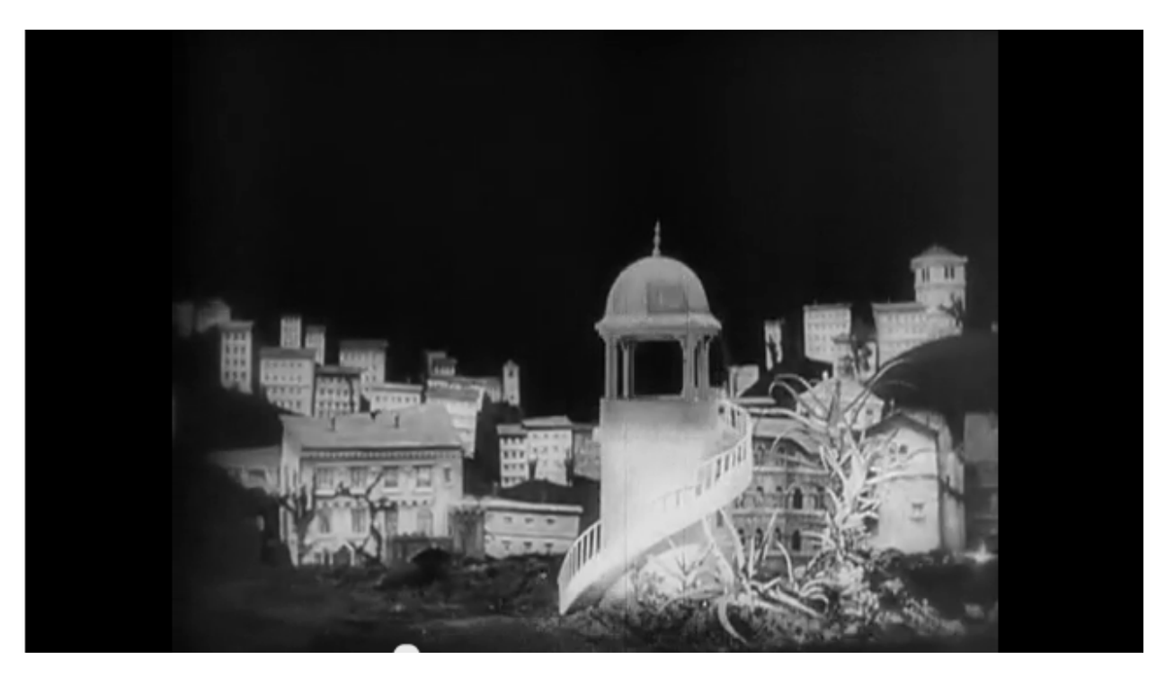
Fig. 2 – Tower in Secrets of a Soul