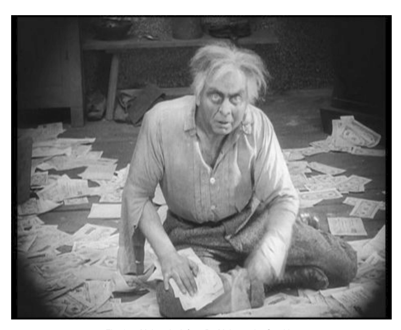
Fig. 14 – Mabuse's defeat, Dr. Mabuse, the Gambler