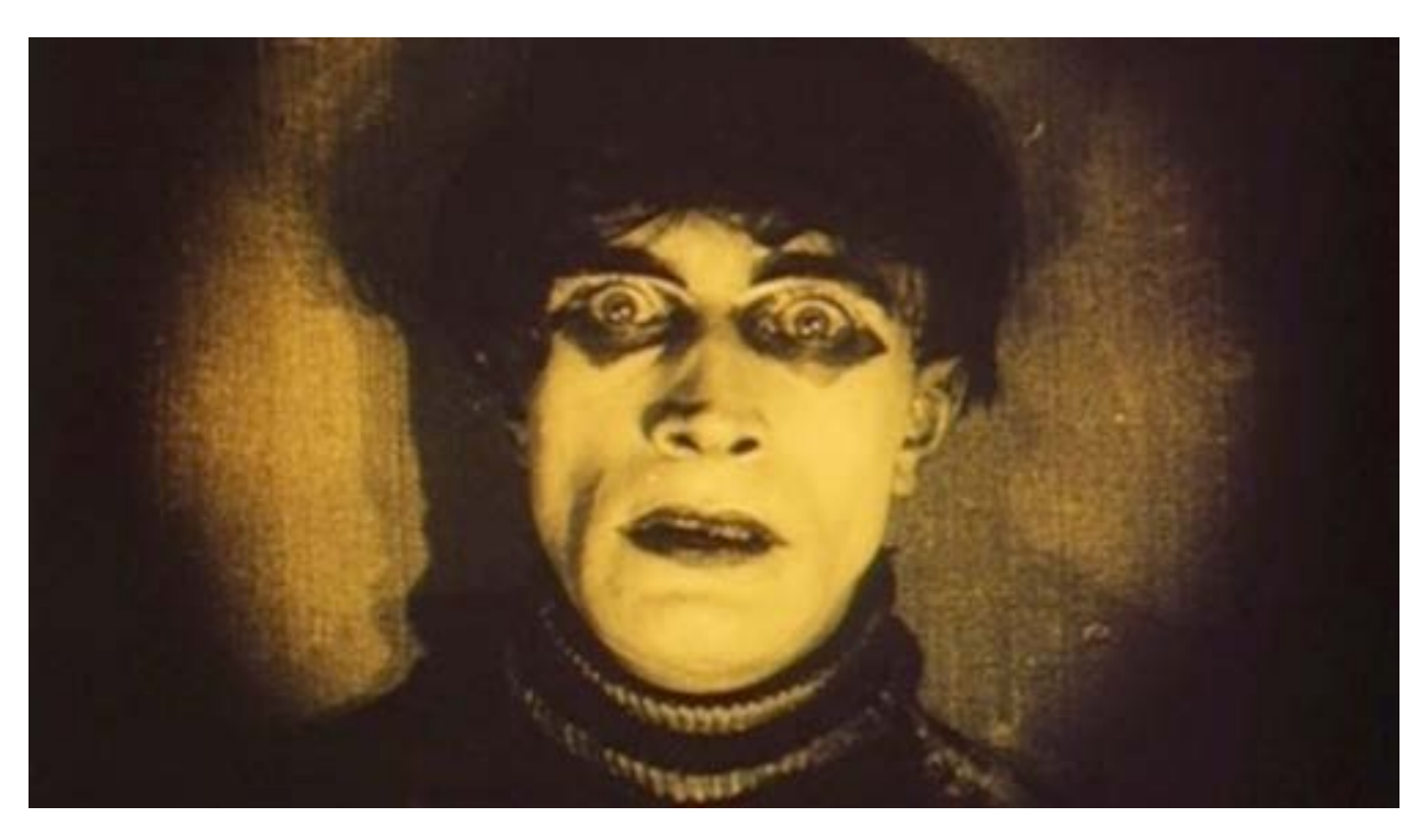
Fig. 5 – Cesare, The Cabinet of Dr. Caligari