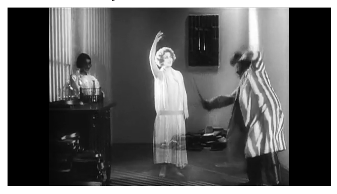
Fig. 4 – Martin stabs wife, Secrets of a Soul