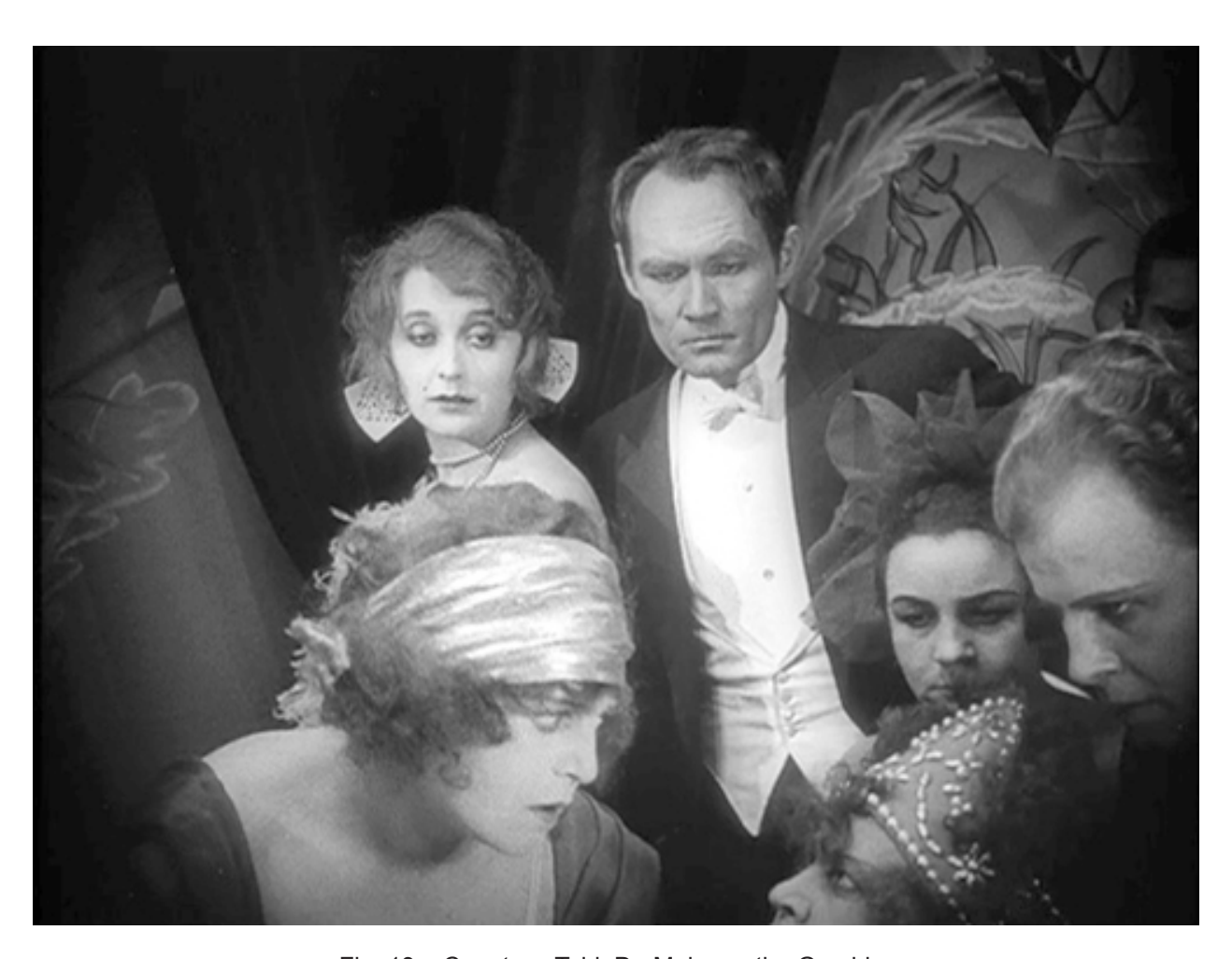
Fig. 13 – Countess Told, Dr. Mabuse, the Gambler