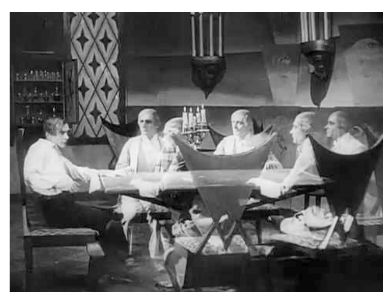
Fig. 11 – Fever Dream, Dr. Mabuse, the Gambler