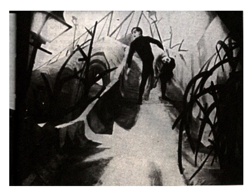
Fig. 1 – Expressionist mise-en-scene, from The Cabinet of Dr. Caligari