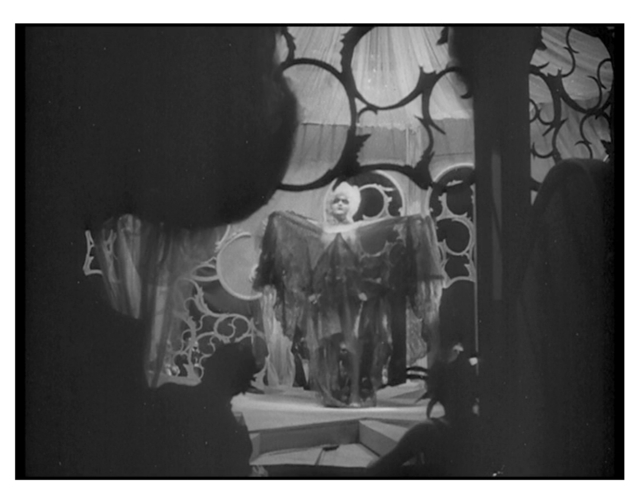
Fig. 10 – Petit Casino, Dr. Mabuse, the Gambler