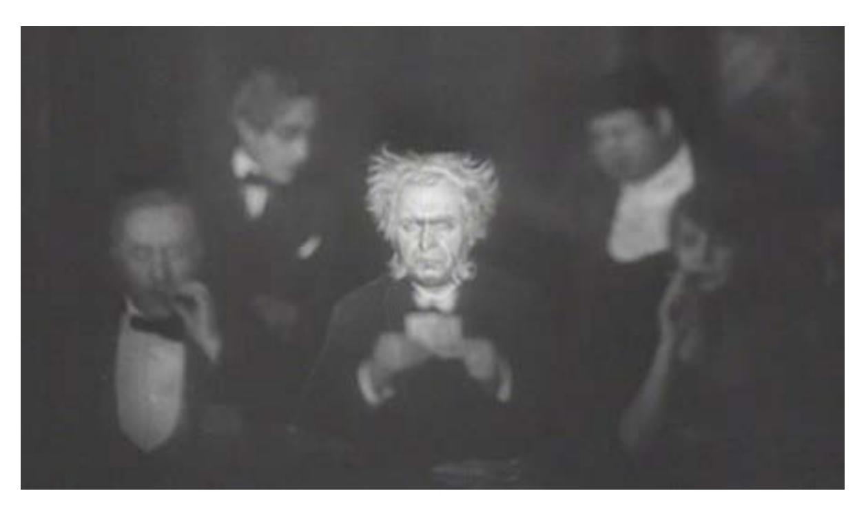
Fig. 12 – Displacement (staged screen right), Dr. Mabuse, the Gambler