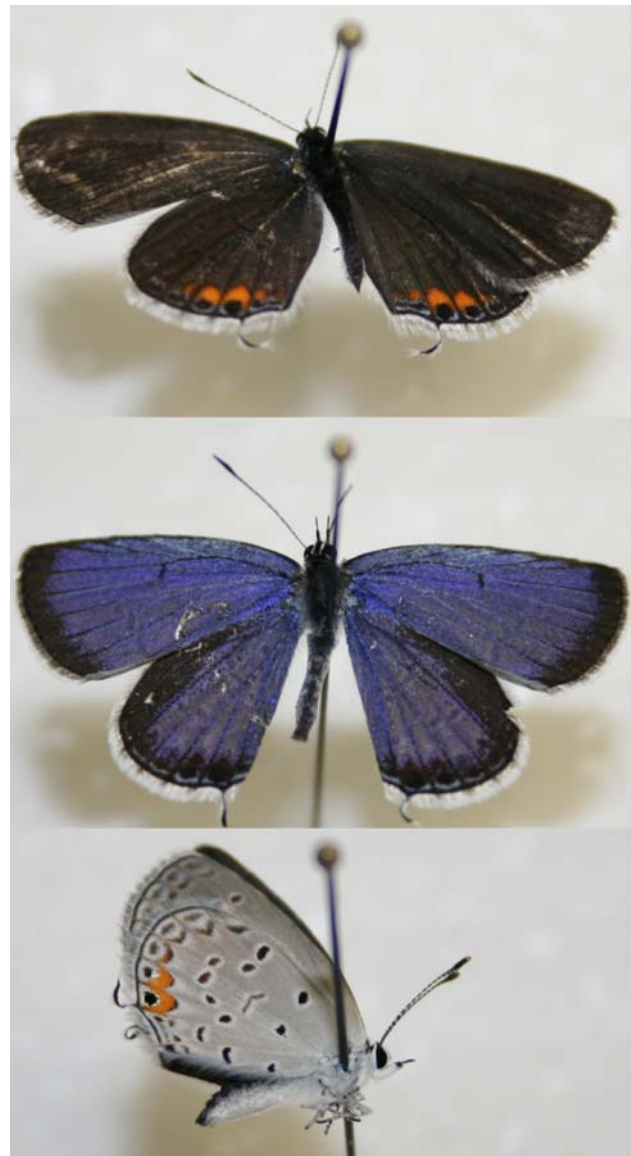
Figure 1. Butterfly morphs of Cupido comyntas comyntas . Male, top; female, middle; side view (female) with wings upright, bottom.

Incidence of defoliation on two soybean maturity groups. The incidence of herbivory by C. comyntas comyntas caterpillars was compared between two soybean lines of contrasting maturity groups (MG, Pedersen 2004) that had been planted on the same date (23 May) within one of the plots. The two lines were a relatively early MG 00.7 line (H007Y12) and a relatively late MG 1.9 line (H19Y11) (both lines Hefty Seed Company, Baltic, South Dakota). Nine sub-plots (8.2 x 200 m) of each line were planted alternately in 8-row strips. At the time of sampling (24 July), line H007Y12 was primarily in the beginning pod stage (R3) and line H19Y11 was primarily in the late vegetative stages (V5 and beyond). By this