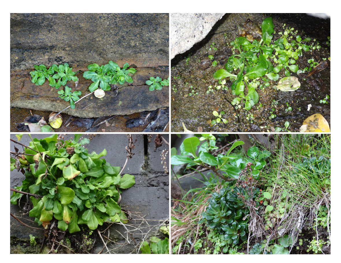
Fig 4. Plants at Lurline Bay, Coogee. Photos: P. Adam, August 2013.

Herb, biennial or short-lived perennial; stolons stout, short; stems solitary or tufted/many, ascending to erect, 10–40 (–50) cm high, stout, terete, slightly fleshy, simple or shortly branched above, glabrous, minutely black-dotted (i.e. with