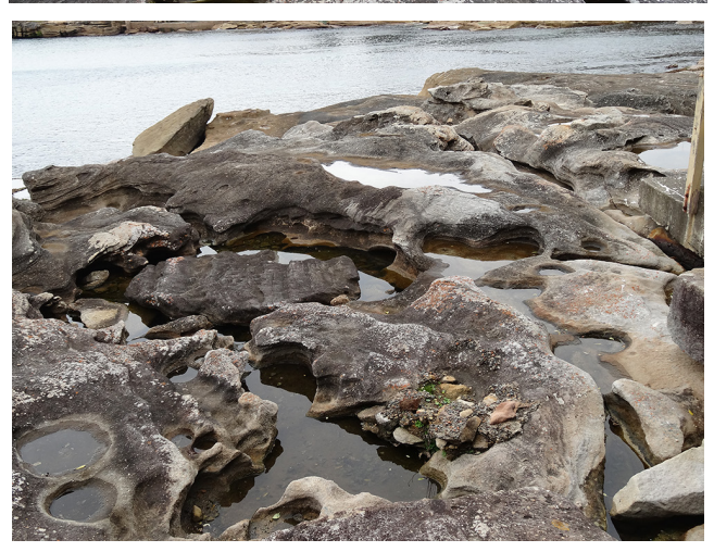
Fig. 5. Cliff seepage and rock platform habitats at Lurline Bay, Coogee. Photos: P. Adam, August 2013.

stems after shedding of leaves, outer rims of petioles carried on as decurrent narrow ridges down stems (at least in dried material). Racemes leafy, erect, terminal, often compoundpaniculate, initially coniform, gradually elongating, manyflowered, 3–15 cm long, lower bracts spathulate, identical to leaves except for shorter petiole, gradually reduced upward (corymbose at flowering/raceme-like in fruit); pedicels 5–15 (-25) mm long, about as long as or slightly shorter than the leaf-like bracts, glabrous. Flowers 5-merous; calyx 3.5-5 mm long, deeply divided, lobes broadly lanceolate to elliptic (or ±oblong), with midrib, black glandular-punctate, margin membranous whitish-hyaline, apex subacute to obtuse; corolla white to pinkish, tube 2–3.5 mm long, petals 5–6 mm long, the lobes narrowly obovate or ligulate-oblong, (with a few glandular dots at obtuse apex). Capsules globose-ovoid, yellow to reddish brown, 4-6 mm diam., lightly pitted, glabrous, stigma/style persistent, longitudinally dehiscing by valves, many-seeded. Figs 1, 2 & 4.