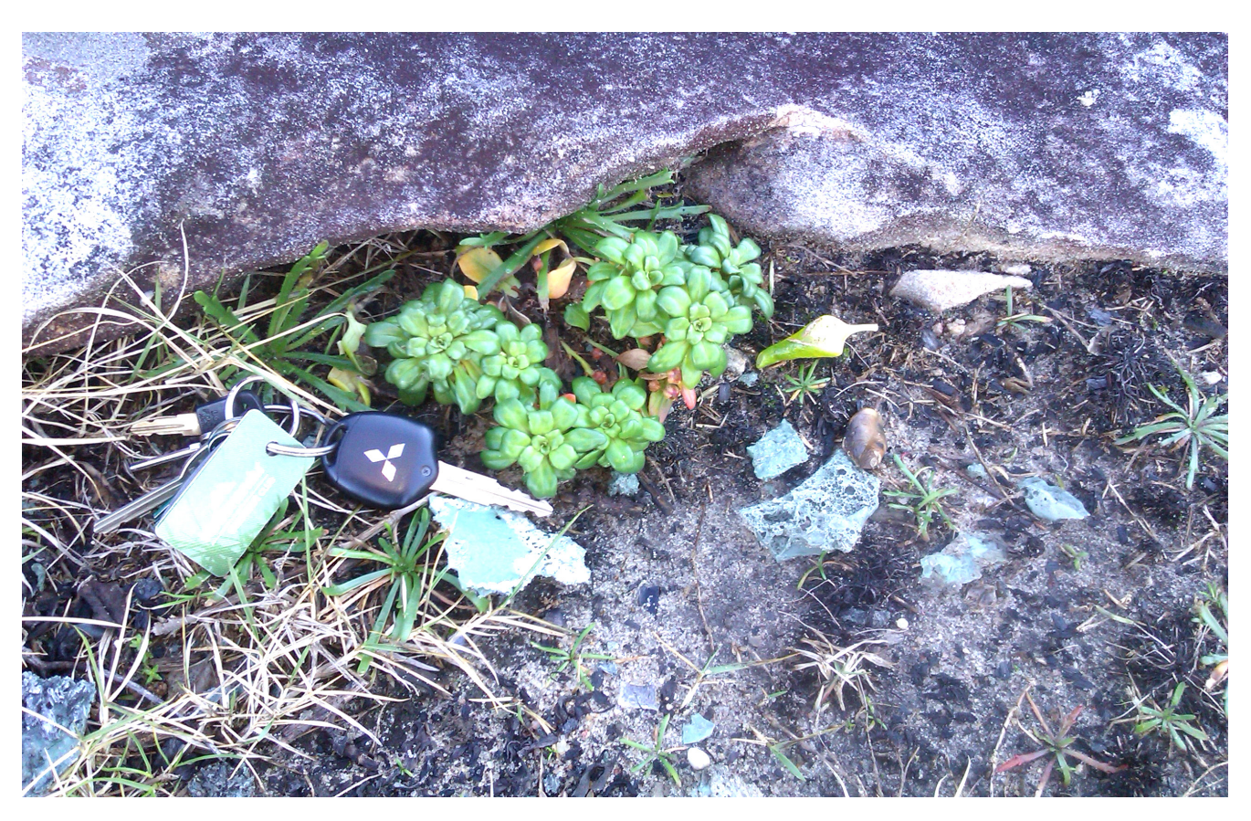
Fig. 2. Young plants growing on Clovelly headland, Burrows Park. Photo: M. Leary, July 2013.