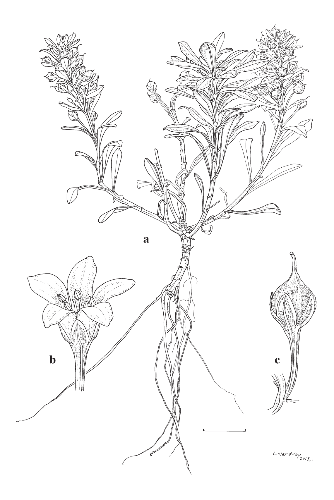
Fig. 1. Lysimachia mauritiana : a, habit; b, flower; c, fruit. Vouchers: a, c, Leary NSW976851 ; b, Leary NSW975610 . Scale bar: a = 2.5 cm; b, c = 0.5 cm.