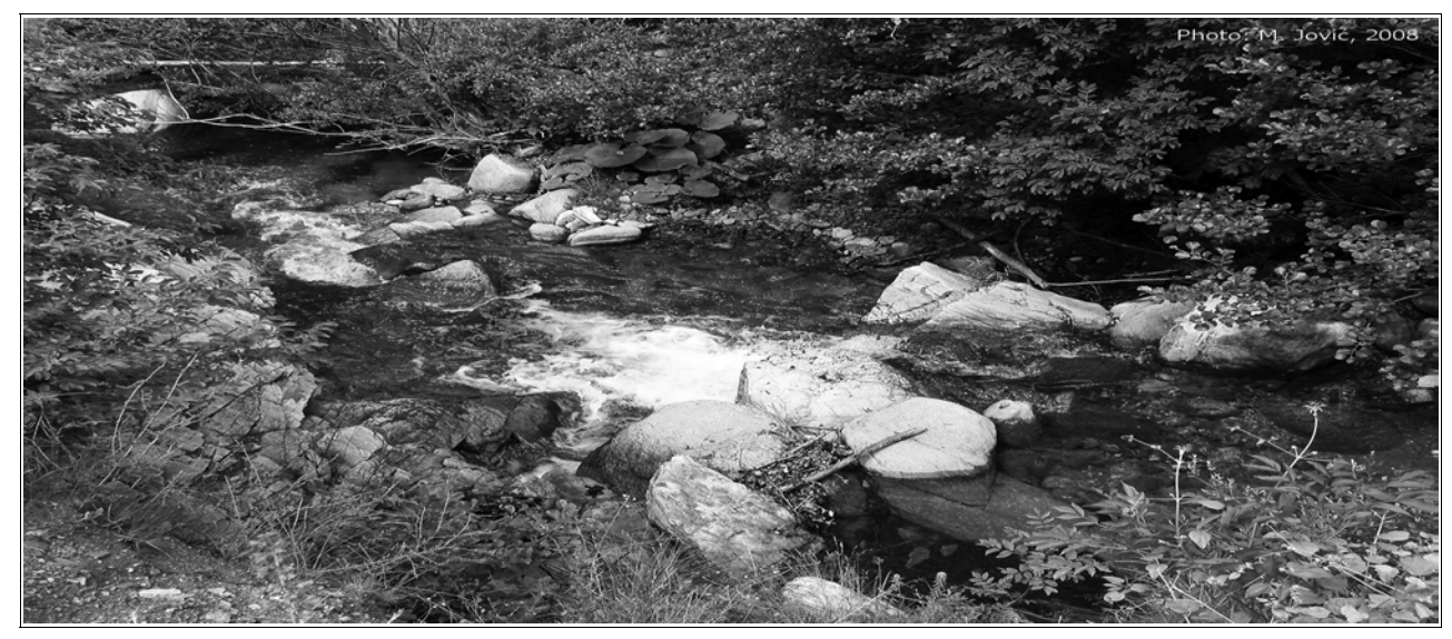
Fig. 5: Konjska Reka river, on Mt. Kožuf, near the village of Smrdliva Voda.