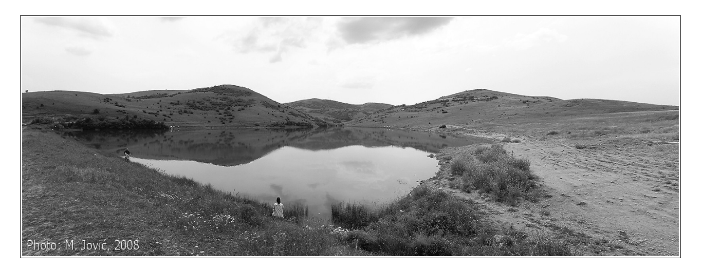
Fig. 8: Lake Pišica in E Macedonia, almost without any vegetation. In spite of that, a number of C. scitulum copulas were observed there.

plants form shore vegetation where numerous Zygoptera were found.