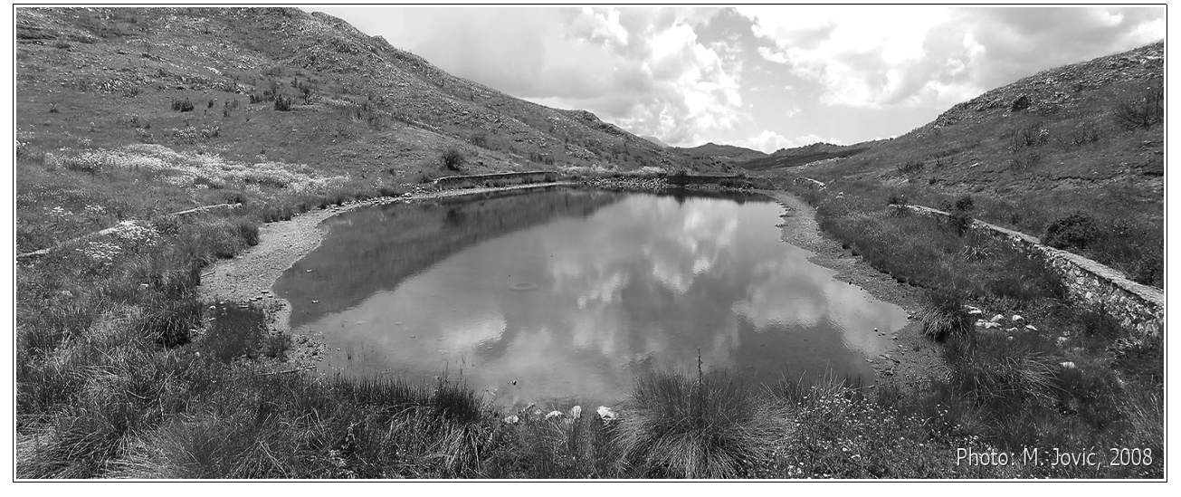
Fig. 6: The Džafa pond on Mt. Galičica, one of the places with the richest diversity of Odonata, probably thanks to its isolated position in a landscape with very few freshwater habitats.

Artificial pond (Fig. 6), 10 June 2008. The pond Džafa is man-made as a watering place for cattle. The pond's edges are fenced with rocks. The pond's dimensions are 50 x 30 m. The water is shallow and the bottom is gritty, in combination with the red soil. There is no vegetation in the water, while the surrounding