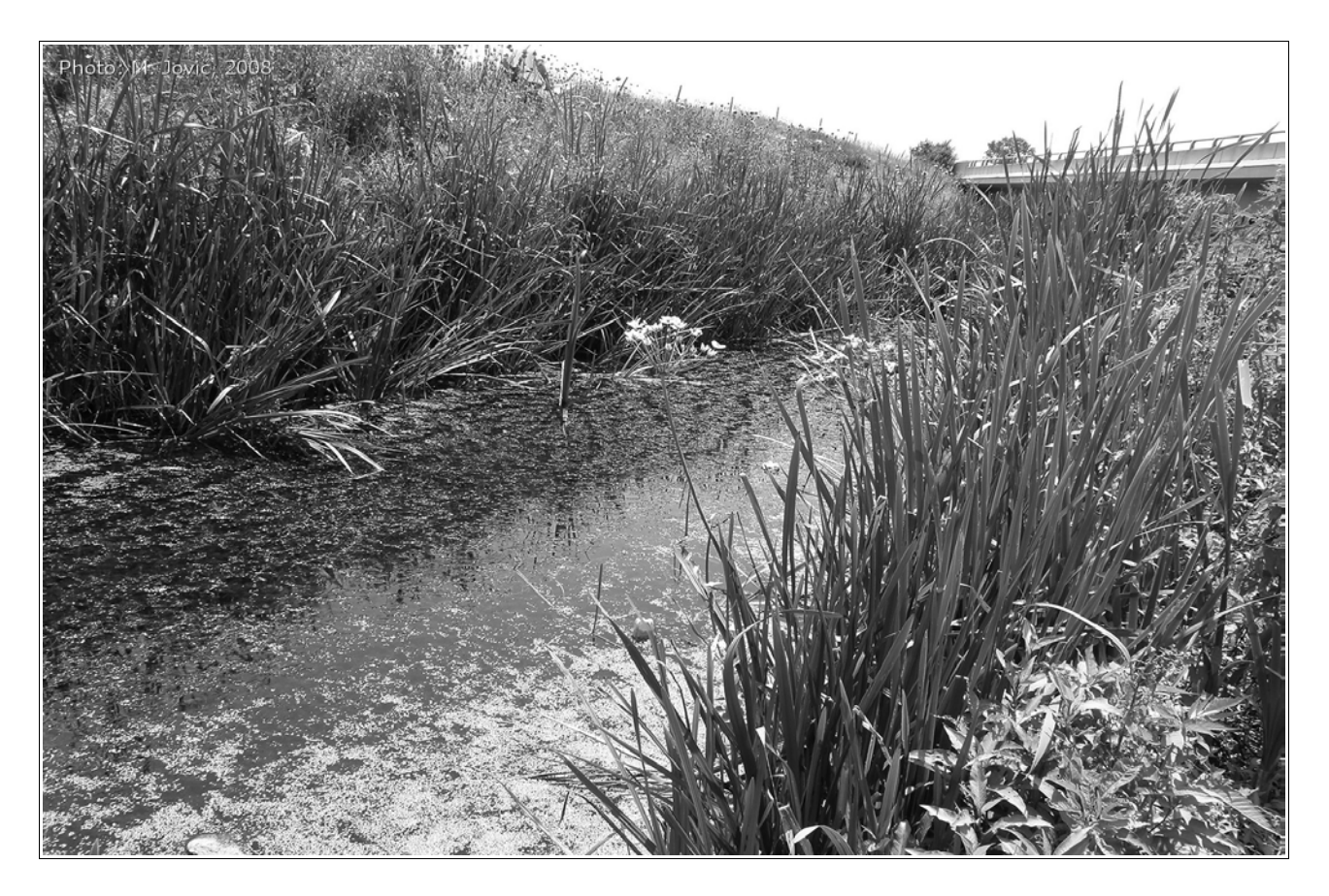
Fig. 3: Canal Petrovec, part of the canal with open water is situated some 50m from the narrow, overgrown part of the canal. Species that inhabit this place are rather clearly divided between the two 'types' of habitat.

Dense vegetation, overgrown canal, 2 June 2008 (Fig. 3). The Canal Petrovec is one of a few canals that flow through the plain which extends on the E and the SE of the capital of Macedonia, Skopje. The whole region represents a complex of fields with different crops. The east part of this plain used to be a wide swamp called Katlanovsko Blato. Today, there are only very small remnants of this swamp and those are canals and some wet areas overgrown with hydrophilous vegetation. Canal Petrovec is under significant anthropogenic influence. Where the canal widens, it is not entirely overgrown and there is some open water but with floating vegetation. The narrower part of the canal is completely overgrown. This is one of three locations where I have found Coenagrion orna tum and the location with the most diverse community of Odonata during my visit to Macedonia.