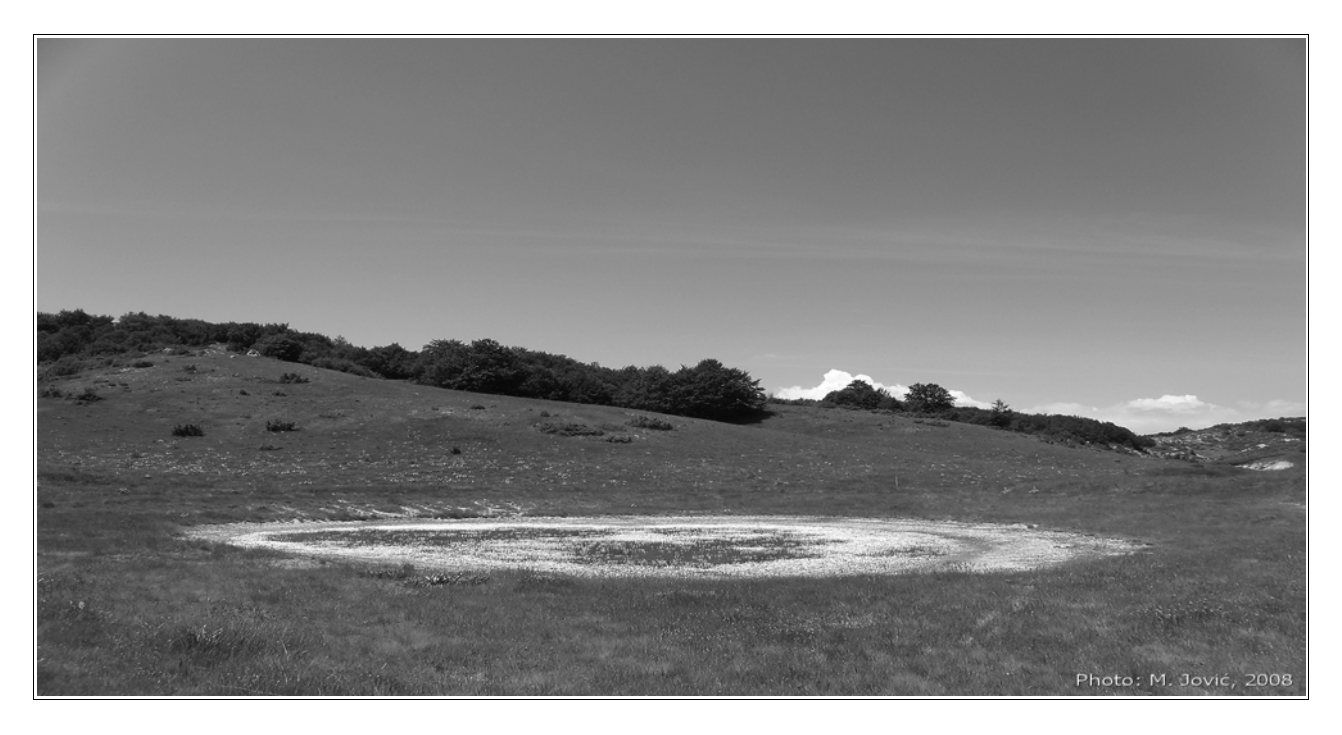
Fig. 7: The Asan Gjura pond on Mt. Galičica.