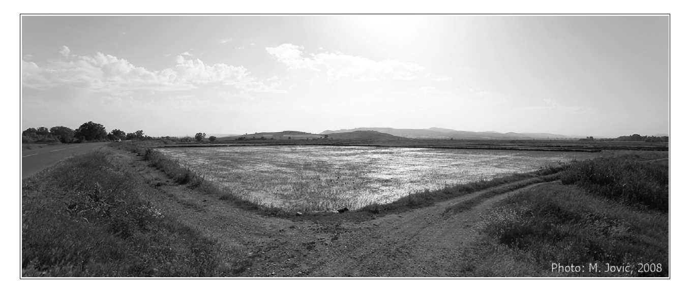
Fig. 2: Rice field in the vicinity of the town of Kočani in E Macedonia.

Rice field (Fig. 2), 30 & 31 May 2008. In the region of SE Europe, Macedonia is known for its rice production. Numerous rice fields go along the valley of the river Bregalnica and its confluents: the Kočanska and Orizarska rivers. During my visit to these localities, the fields were under water. The dominating species was Sympetrum fonscolombii .