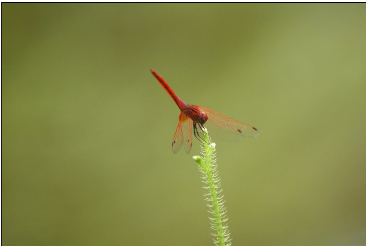
Figure 11: Trithemis a. aurora

Interestingly, this species was not seen in the 2009 survey while it was abundant during the present fieldwork.