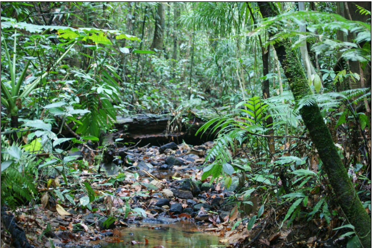
Figure 3: Forest stream