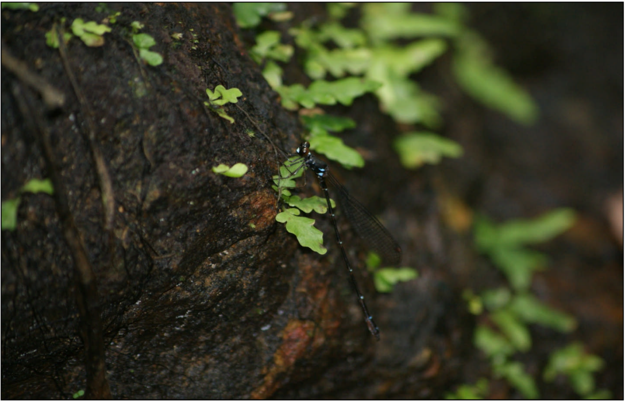
Figure 4: Drepanosticta philippa