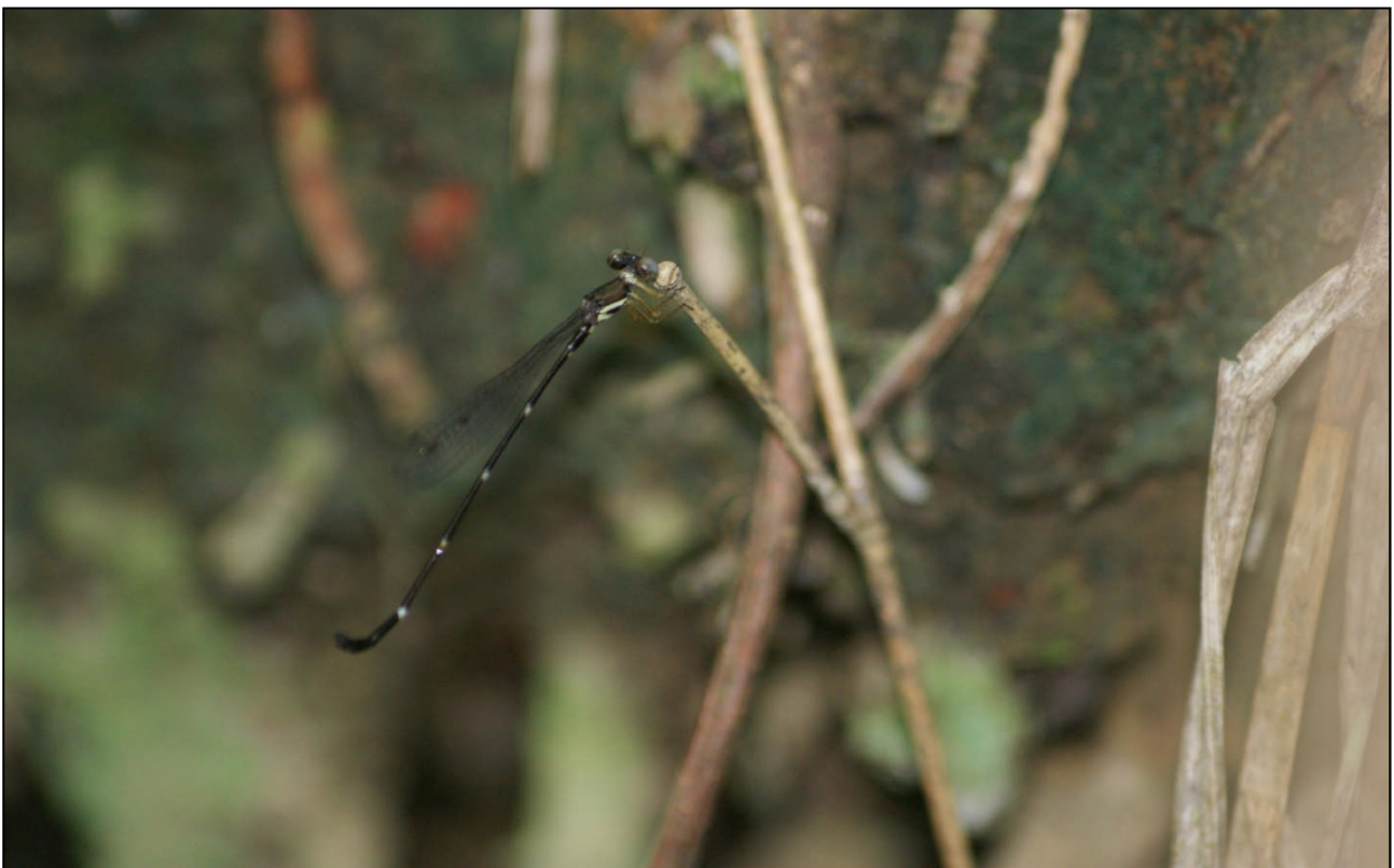
Figure 5: Drepanosticta sp.n.

This undescribed species is not common but another two young males were