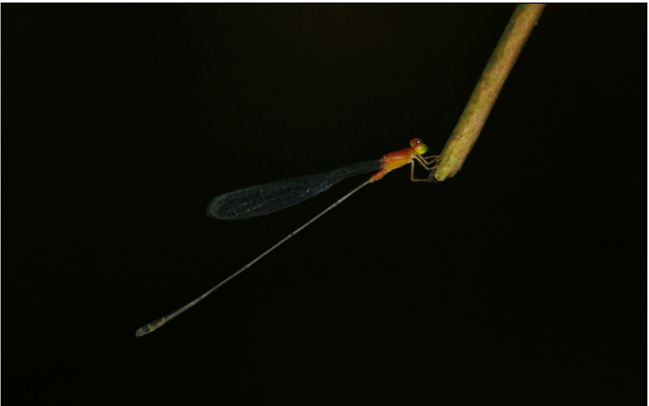
Figure 7: Teinobasis sp. cf. corolla

I tentatively placed some individuals to that species ( Teinobasis sp. cf. corolla : Villanueva, 2010) but a more comprehensive treatment of the genus of at least the Philippine species is needed.