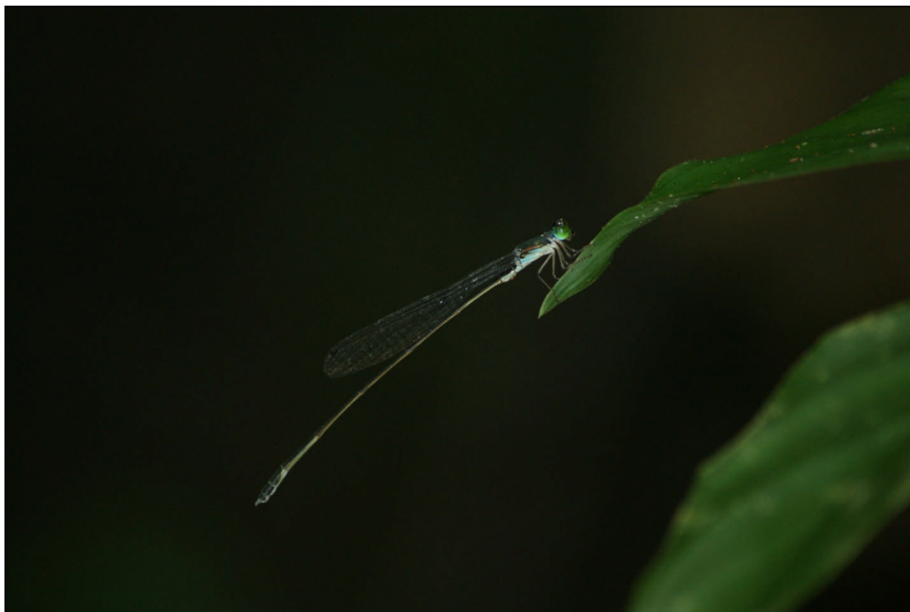
Figure 6: Amphicnemis sp.n.

A single female was found. The prothoracic structure suggests that it represent a distinct new species, and is closely allied to Amphicnemis incallida . However, the absence of male made me refrain from preparing a species description.