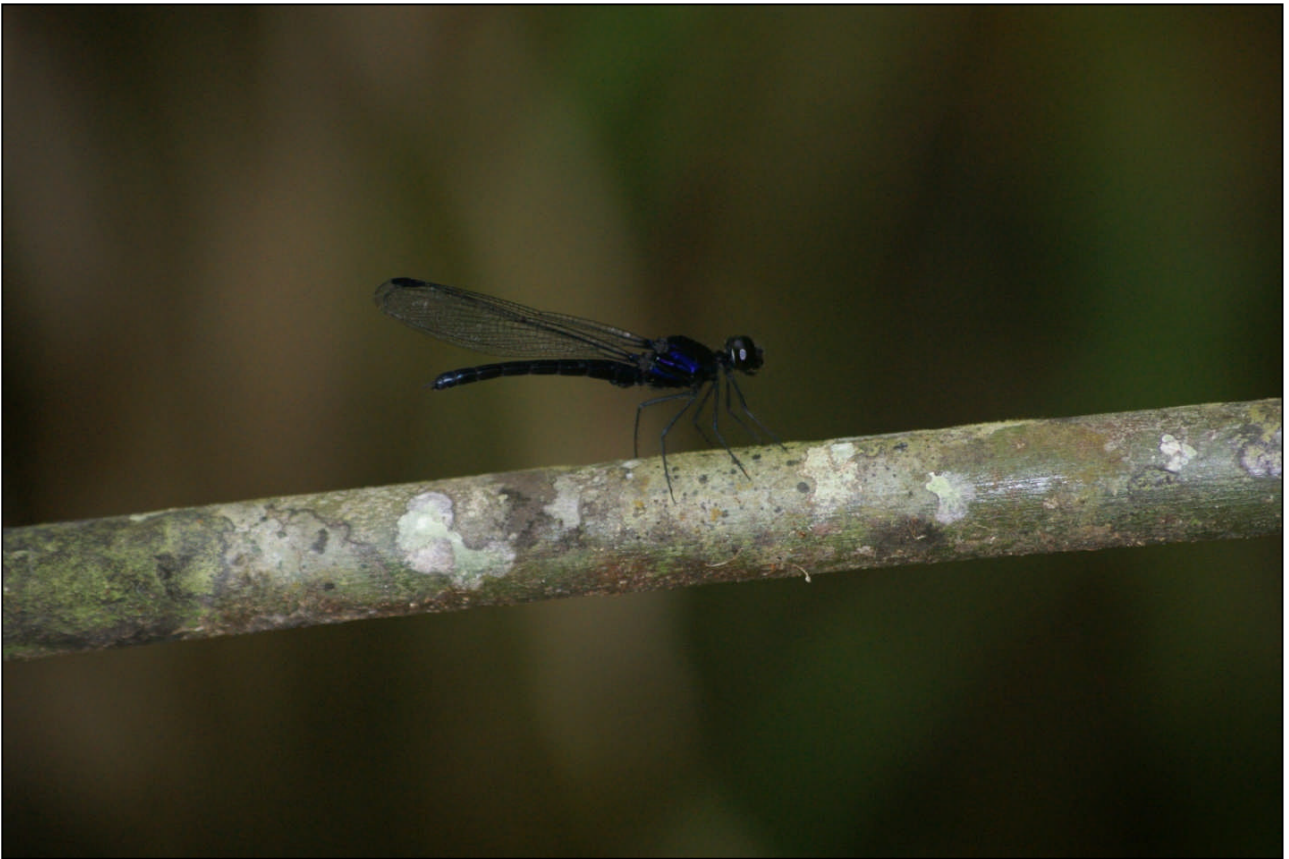
Figure 8: Cyrano unicolor