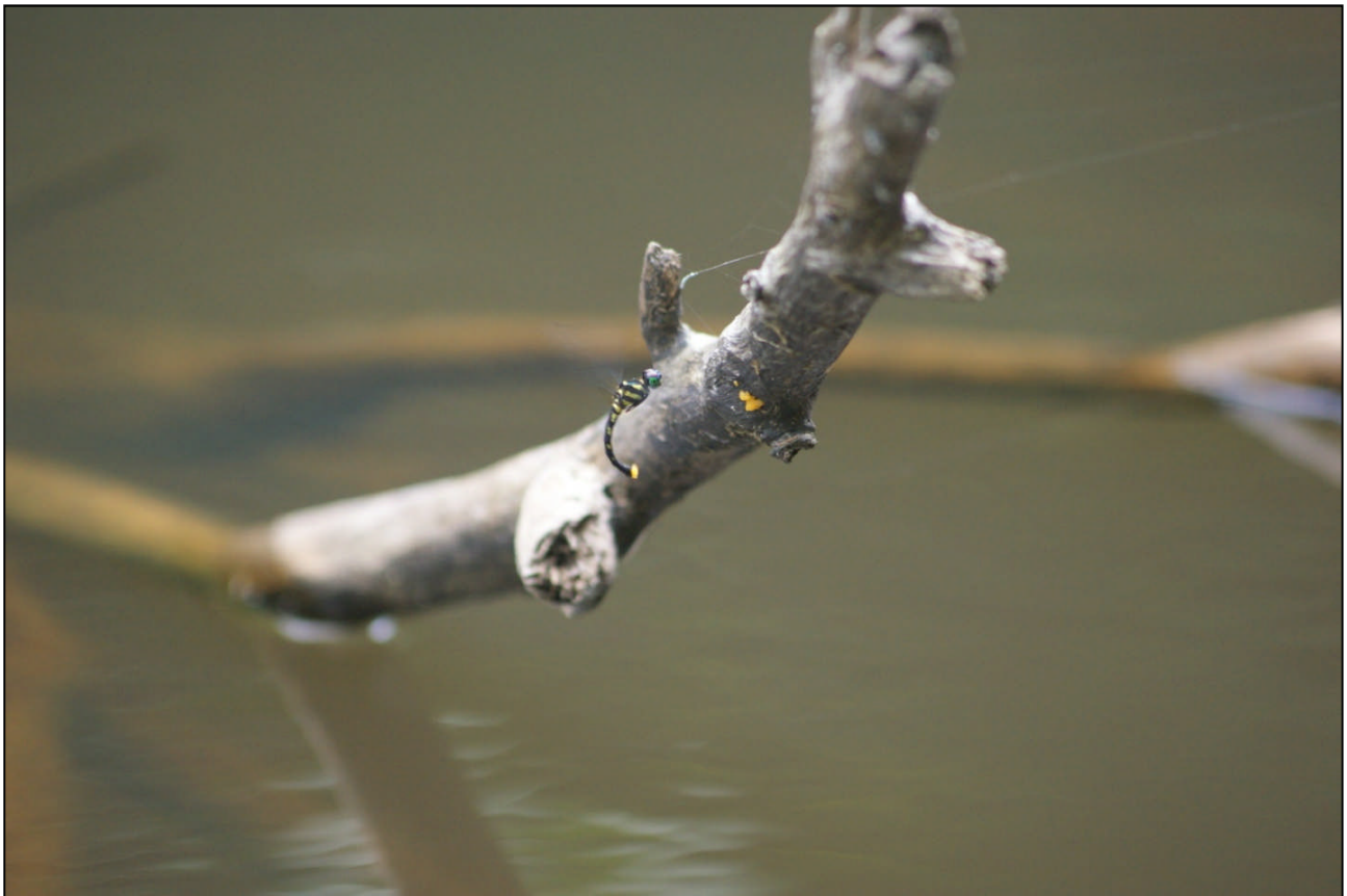
Figure 10: Tetrathemis i. irregularis