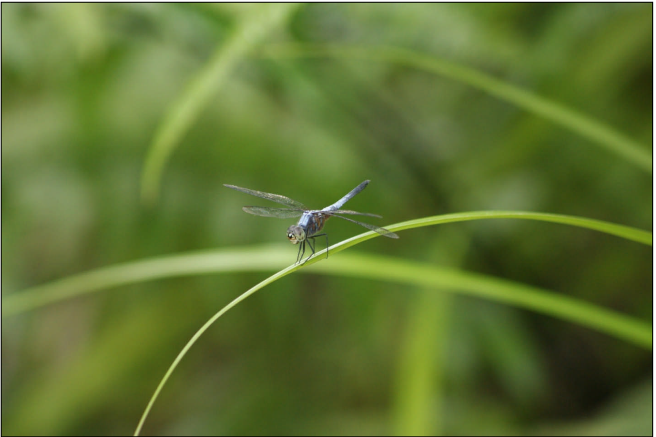
Figure 9: Brachydiplax c. chalybea