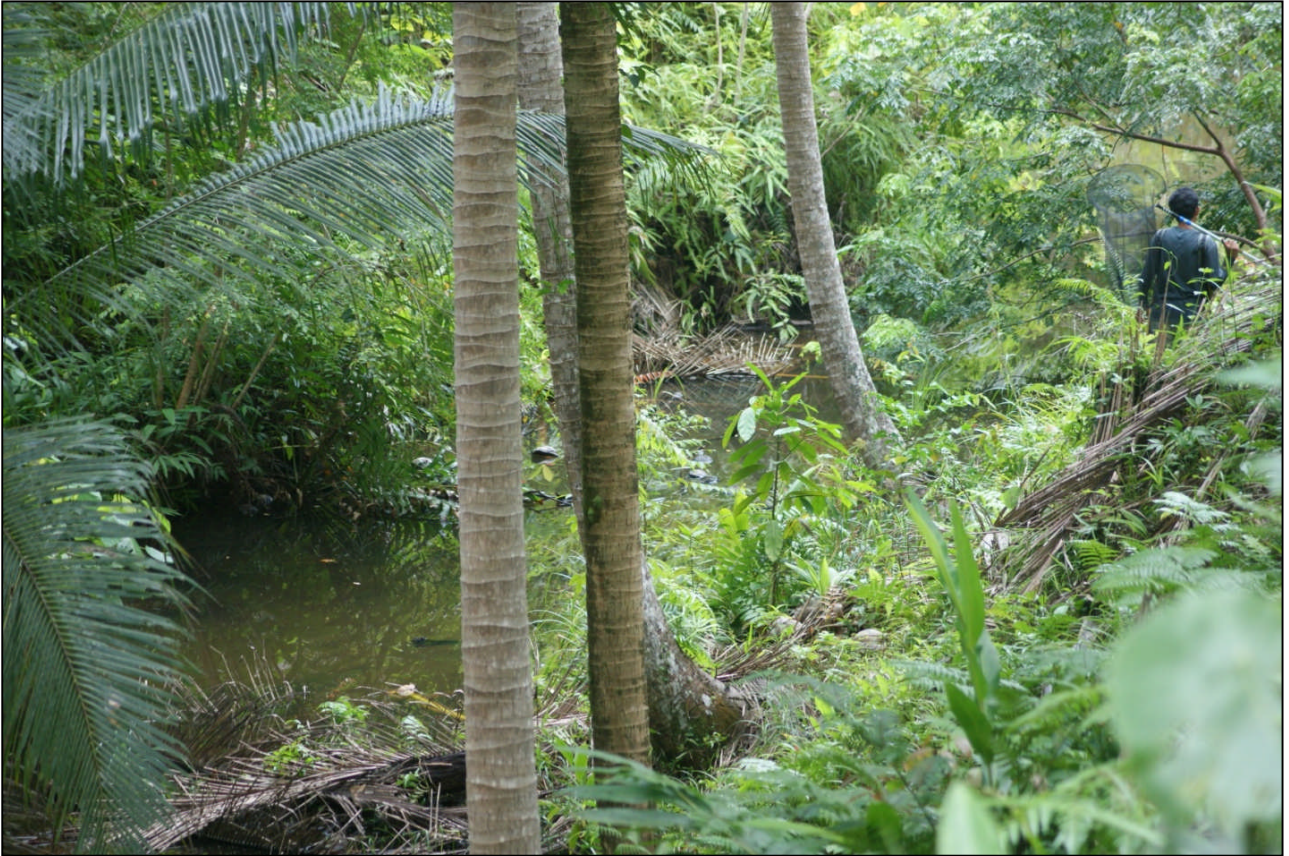
Figure 2: Secondary forest pond