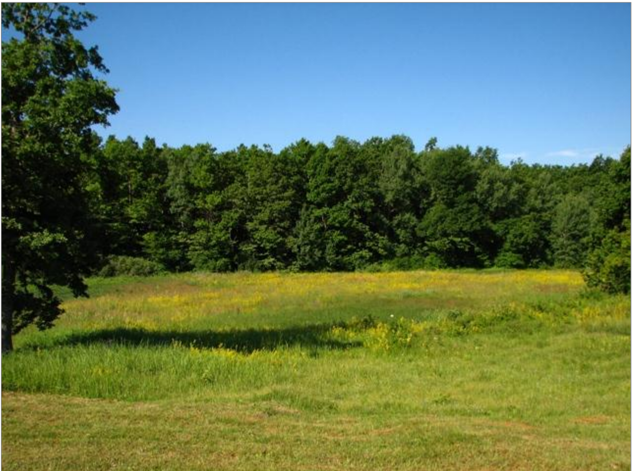
Figure 6. Alluvial forests of pedunculate oak in the northern part of the polje.

rides and the eastern Adriatic. Dry grasslands, peatlands, marshes, wet meadows and alluvial forests are the main habitats with numerous unique and relict plant associations. Their existence is based on seasonal water gradient fluctuations, naturally occurring in the polje. The unique phenomenon of karst fields of the Dinaric Alps are habitats shared by hydrophilous and thermophilous communities throughout the year, depending on variable water levels. The high water level during the spring and autumn influences rich development of hydrophilous communities, but as water level falls down considerably during the summer, the thermophilous communities dominate in the polje (Redžić et al. 2008.) (Fig. 4 & 5). The marsh forests of Livanjsko polje consists of alder, pedunculate oak and ash, and are the largest alluvial forests on karst soil in the Dinarides (Fig. 6). They are mostly found in the central and northern part of the polje.