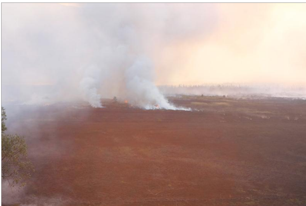
Figure 18. Fire at Veliki Ždralovac peatland in October 2011

Peat excavation and drainage that is currently practiced in Livanjsko polje is unsustainable and threatens to destroy the largest Balkan peatland. Uncontrolled burning of peat, grassland and scrub areas in the spring and autumn at Livanjsko Polje is also a serious problem for the marshland and peat areas (Fig. 18).