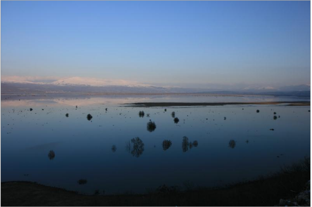
Figure 4. Flooding in central part of Livanjsko polje during the winter season