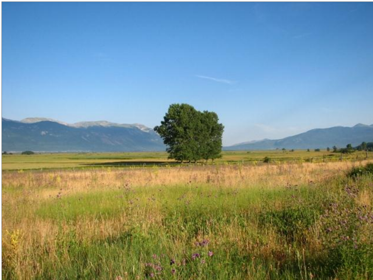
Figure 2. Livanjsko polje, pastures and meadows in the central part of the polje.

A complex network of surface and underground water bodies exist in the polje. A great diversity of different freshwater habitats can be found in the polje, among these are peat bogs, swamps, fens, swamp forests, seasonally flooded forests, artificial lakes, gravel pits, mining pools, seasonal and permanent rivers and streams, drainage channels and ditches. Fast flowing, cold and carbonate rich permanent karst rivers (Sturba, Žabljak, Bistrica) are confined to the southeastern part of the polje. Additionally, several temporary rivers run through the polje, which disappear mainly during the dry season in depressions (ponors) (Schneider-Jacoby et al. 2006; Redžić et al. 2008).