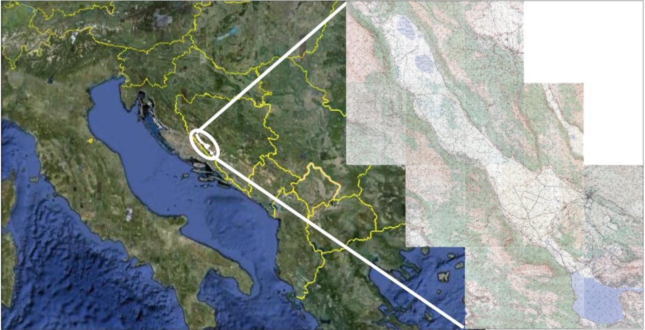
Figure 1. Geographical position of Livanjsko polje.

spring when ponors are not sufficient to drain all the surface water. They are periodic or permanent wetland areas, surrounded by dry and rocky karst mountains. More than 130 poljes exist in the Dinaric Alps, most of them located in Bosnia and Herzegovina and covering an area of app. 1.350 km 2 (Schneider-Jacoby et al. 2006). Karst areas of Bosnia and Herzegovina are among the best preserved in Europe, but are still insufficiently legally protected and under direct threat by water extraction and unsustainable use of natural resources.