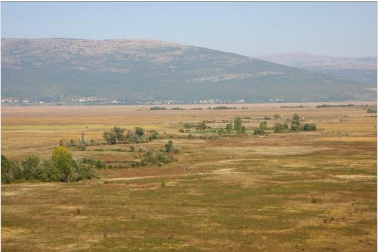
Figure 5. Dry riverbed and grasslands in late summer