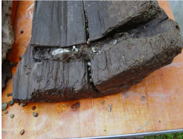
Fig 4: Fragment of the stern after removing of the transom board. Mosses and some stones are rammed into the slot.