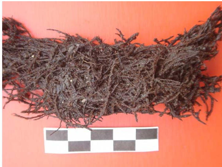
Fig 6: Part of the caulking showing the moss Anomodon viticulosus (Photograph. LAD / M. Mainberger).