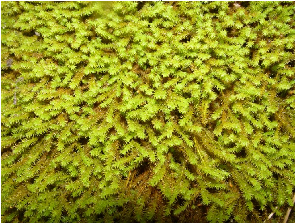
Fig.7: The moss Anomodon viticulosus growing on a limestone wall near Chemilly, Haute-Saône, France.