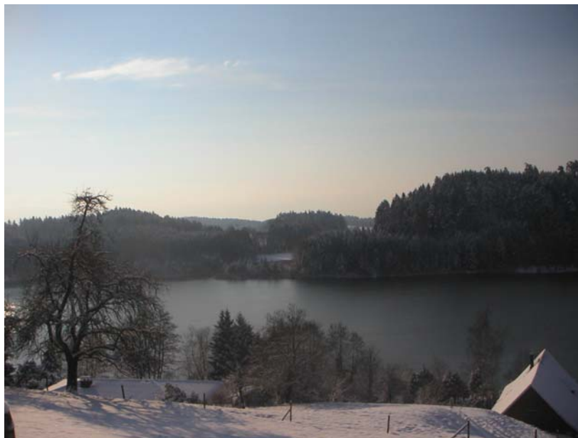
Fig 8: View across the Degersee to the south. In the right background the Höhenberg.

Therefore, assuming that the bryoflora around Degersee has not changed drastically over the last four thousand years or so, the boat was not caulked there and so perhaps was not constructed there either. Or if indeed the boat was built there then the caulking mosses came from some area nearby with more base-rich conditions. To deduce anything more would need very detailed bryological surveying of the region but we did find both the Anomodon viticulosus and the Neckera complanata on the trunk of a large willow ( Salix ) on the bank of the river Argen just upstream of the suspension bridge, some 5km southwest of Degersee. If the canoe was used for many years then perhaps there was more than one episode of caulking. However, there is no hint from the mass of mosses of multiple caulking.