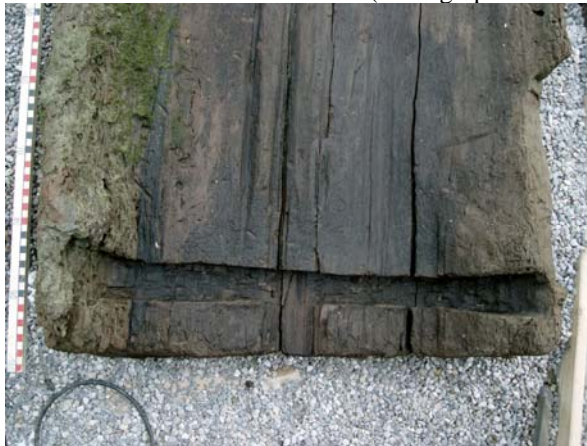
Fig 5: The stern section after removal of the caulking materials. At the inside of the gap traces of tools can be observed.

Most monoxyloous boats in Europe have been made of oak ( Quercus ) (Arnold 1995) but that from Degersee is made of alder ( Alnus ); widespread in Europe, a waterside tree Alnus glutinosa grows around the lake.