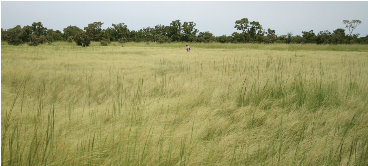
Fig. 1: A typical bowal in W National Park between Kabougou and Point Triple. The bowal is free of woody plants. / Un bowal typique dans le Parc National de la W entre Kabougou et Point Triple. Le bowal est dénué des plantes ligneuses. / Ein typischer Bowal im W-Nationalpark zwischen Kabougou und Point Triple. Der Bowal ist frei von Gehölzen.

landscape elements are typical for tropical semiarid areas where physical and chemical weathering is promoted and are hence widespread in West Africa. Their development takes place during humid periods when iron is leached from the top soils and transferred into deeper soil layers. Later, during dry periods, this material is hardened and becomes resistant to erosion (BROWN et al. 1994).