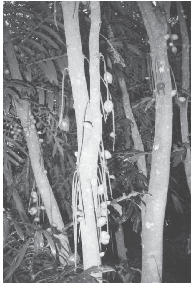
Fig. 1. Hicksbeachia pinnatifolia showing low fruit-set per inflorescence.

Hicksbeachia pinnatifolia that flowered in 1998 at the three sites had an average of 36.3 \pm 11.6 (s.e.) inflorescences per plant ( n=24 ). Inflorescences contained an average of 154.5 \pm 5.4 ( n=51 ) flowers (range 76–242). Plants produced an average of 22.0 \pm 7.9 infructescences ( n=22 ). This equates to 61% of inflorescences producing fruit. Infructescences ( n=50 ) averaged 3.1 \pm 0.4 fruits each with a range of 0–11 (Fig. 1). This equates to a final fruit-set (fruits: flowers \times 100) of 1.2%.