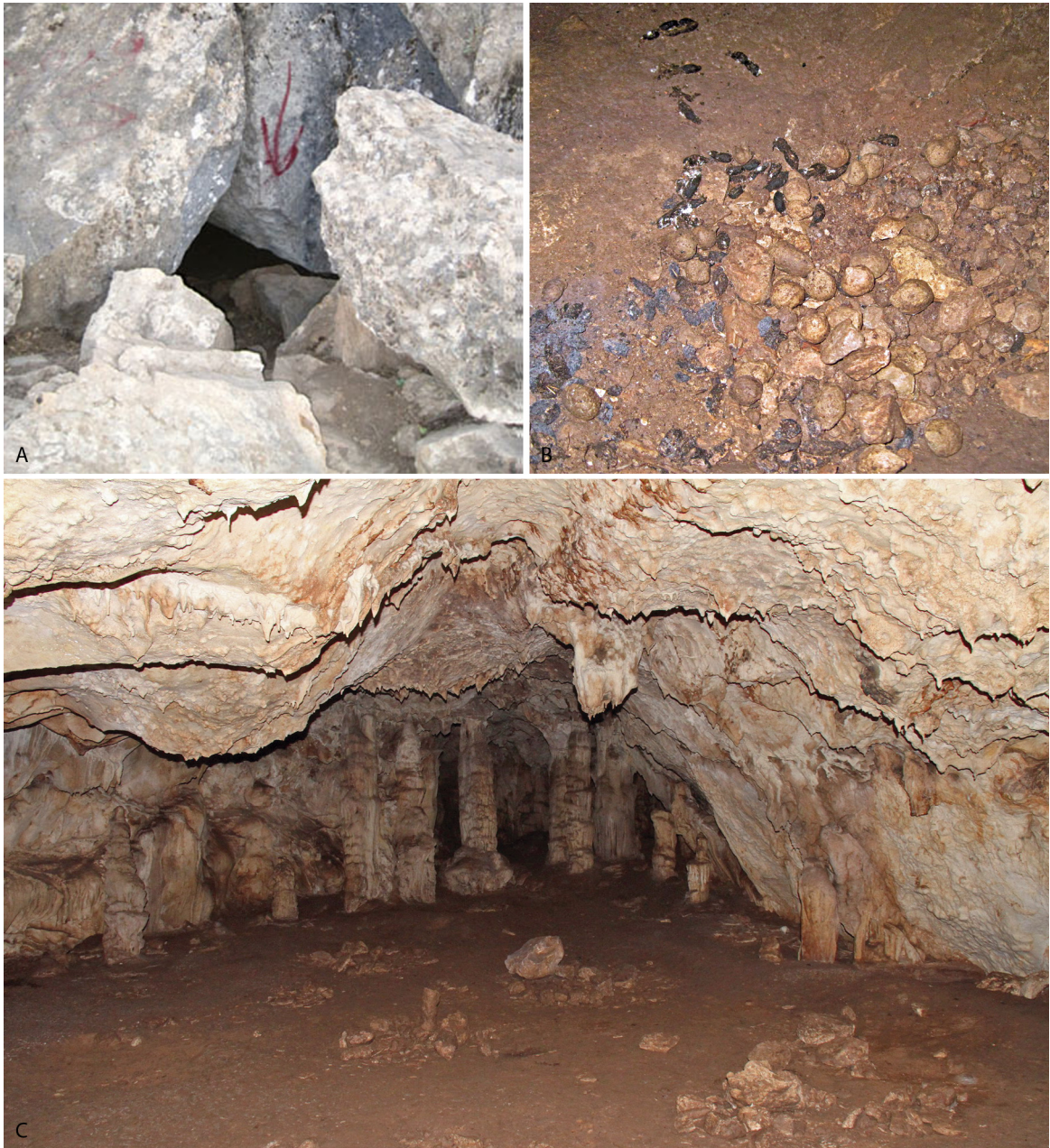
Fig. 1: Deh Sheikh cave, in which Megachernes pavlovskyi was found. A. Cave entrance. B. Detail of porcupine den. C. Cave interior.