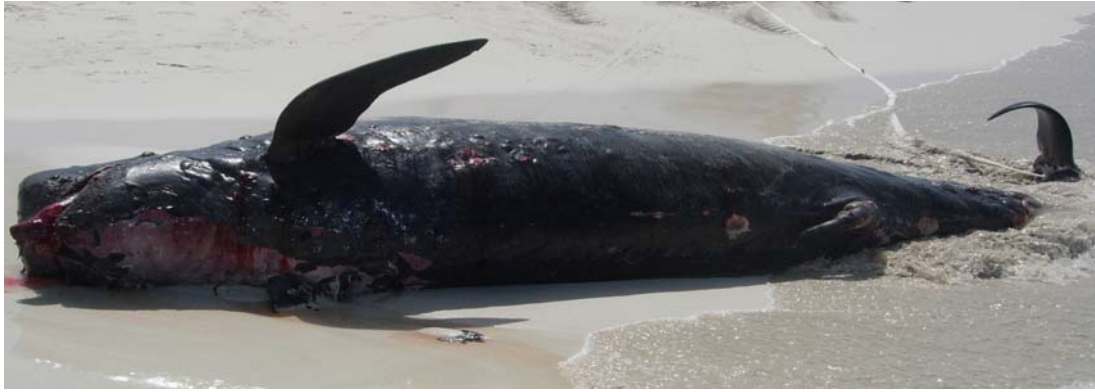
Fig. 4. Short-finned pilot whale Globicephala macrorhynchus with Isistius shark scars on ventral area, Praia de Boa Esperança, Boavista, 28 September 2010 (Gabriella Gatt).