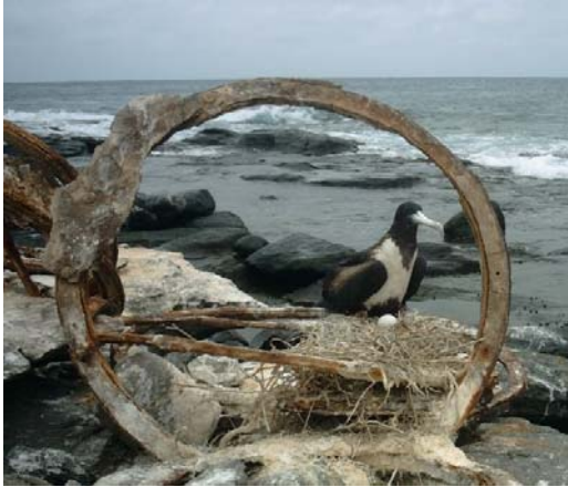
Magnificent frigatebird Fregata magnificens , female, Ilhéu de Baluarte, Boavista, Cape Verde Islands, 4 June 2003 (Pedro López Suárez).

The finding of a mummified male on Baluarte islet, 25 January 2005, reduced the known population to five birds. In 2006, a maximum of two females and two males was counted, all on Curral Velho islet (López Suárez et al. 2007). From 1999-2000 to 2005-2006, the population was regularly surveyed for seven consecutive breeding seasons. Reproductive failure, either resulting from genetic (inbreeding depression) or demographic (ageing, lack of recruits, Allee effect) imbalances, is considered to have brought the frigatebird to the verge of extinction (López Suárez et al. 2007). However, the initial decline of the frigatebird population in Cape Verde was likely triggered by human persecution, as has been the case for several other seabird populations since the islands were first colonized by man during the 15 th century (Hazevoet 1994, 1995).