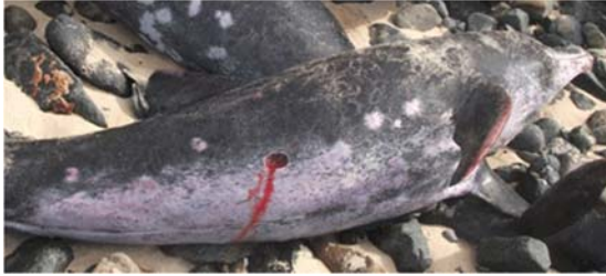
Fig. 3. Rough-toothed dolphin Steno bredanensis with open wound and completely healed Isistius shark scars, Praia de Estoril, Boavista, 20 October 2010.

for cetacean population stock determination for several species (Shevchenko 1977, Moore et al. 2003, Goto et al. 2009). Dwyer & Visser (2011) provided detailed descriptions and photographs of Isistius shark bites on cetaceans in New Zealand waters, as well as categories and descriptions of bite marks on killer whales Orcinus orca .