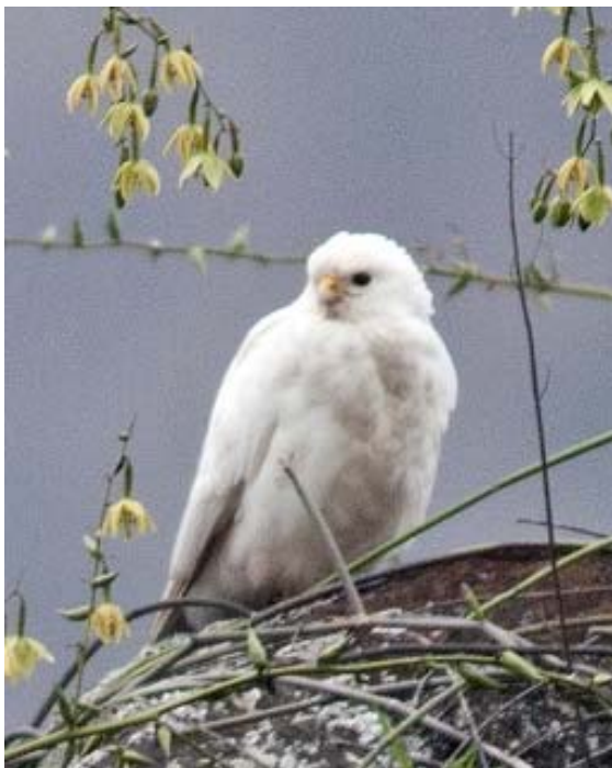
Fig. 2. Cape Verde buzzard Buteo bannermani , Santo Antão, 30 November 2012 (René Pop).

primary would appear to narrow this down to ino , a colour aberration caused by the qualitative reduction of both melanins due to incomplete synthesis (oxidation) of both eumelanin and pheomelanin (Grouw 2010, 2013). However, ino is almost exclusively restricted to females, while – in view of its display behaviour – our bird was most likely a male. Therefore, it probably concerns a strong example of dilution, a quantitative reduction in colouration that can be caused by a range of different mutations (H. van Grouw in litt. ). It should be noted that correct identification of colour aberrations in birds in the field is often problematic and not always possible (Grouw 2013). As far as we know, this is the first documented example of a white Cape Verde buzzard.