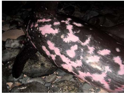
Fig. 1. Rough-toothed dolphin Steno bredanensis with healed Isistius shark bites near the head, Praia de Estoril, Boavista, 7 March 2001 (Pedro López Suárez). Fig. 2. Presumed older rough-toothed dolphin with multiple healed Isistius shark scars, Praia de Estoril, Boavista, 19 October 2010 (Junior Ramos Fonseca).