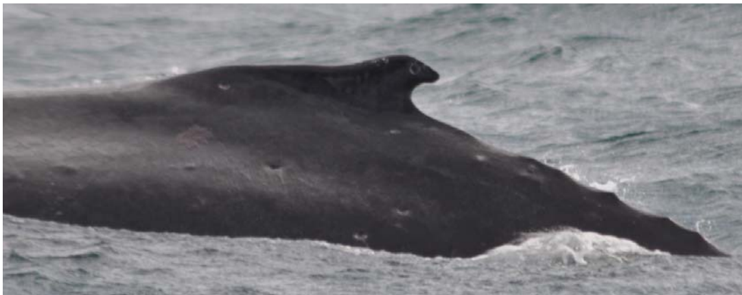
Fig. 7. Humpback whale Megaptera novaeangliae , female, with numerous Isistius shark bite scars, off Sal Rei, Boavista, 16 March 2011 (Pedro López Suárez).

At this time, there has been no effort to systematically document Isistius shark scars or wounds on cetaceans, which would help in identifying which Isistius species is the predator. The present paper confirms the necessity for continuing study of the interactions between Isistius sharks and cetaceans in order to better understand their predator-prey relationships.