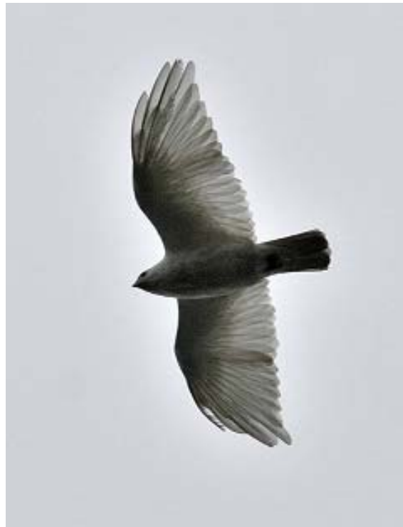
Fig. 1. Cape Verde buzzard Buteo bannermani , Santo Antão, 30 November 2012.

The plumage of the aberrant buzzard appeared essentially all-white. From below, however, the first primary on each wing appeared to be a very pale brown or creamy and may have been moulted recently, while the whiter appearance of the other flight feathers may have been due to bleaching. The pinkish colour of the bill of the white buzzard observed in Santo Antão would indicate either leucism (a partial or total lack of both melanins in feathers) or ino, while the very pale brown of the first