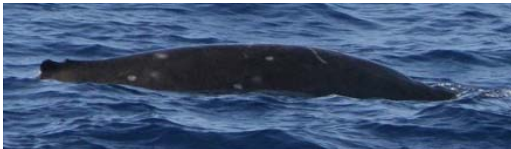
Fig. 6. Blainville's beaked whale Mesoplodon densirostris with multiple Isistius shark scars, off northern Boavista, 14 April 2011.