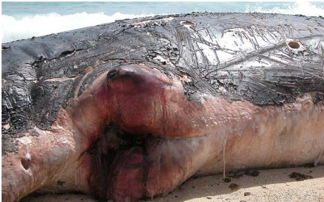
Fig. 5. Sperm whale Physeter macrocephalus with Isistius shark wounds, Praia de Roque, Boavista, 8 March 2006 (Pedro López Suárez).