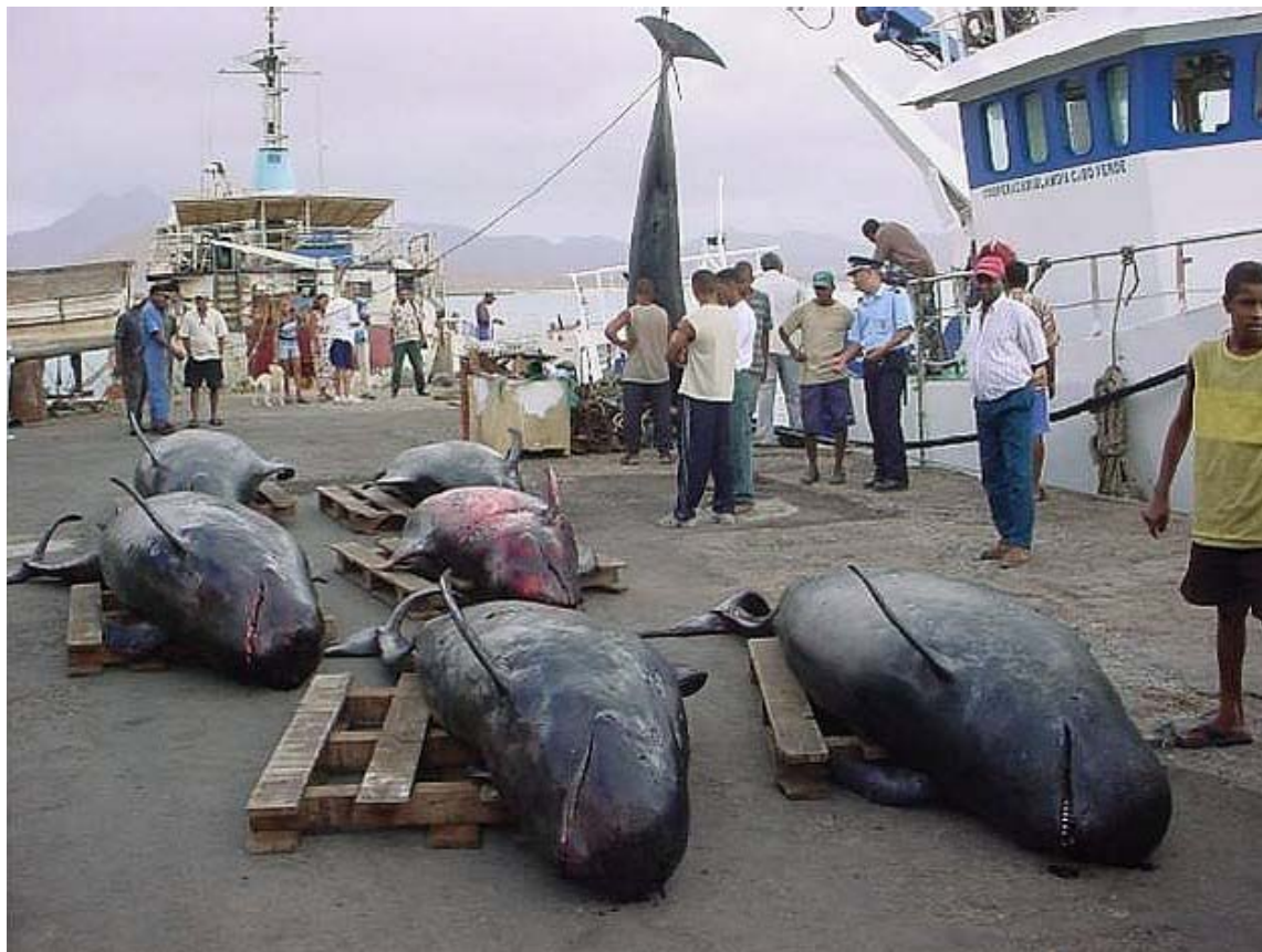
Fig. 15. Short-finned pilot whales Globicephala macrorhynchus , Mindelo, São Vicente, 6 August 2002; stranded at Praia de Escurrelete, Santo Antão, 5 August 2002 (Carlos Pulú).