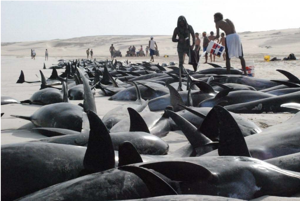
Fig. 11. Melon-headed whales Peponocephala electra , Praia da Chave, Boavista, 18 November 2007.