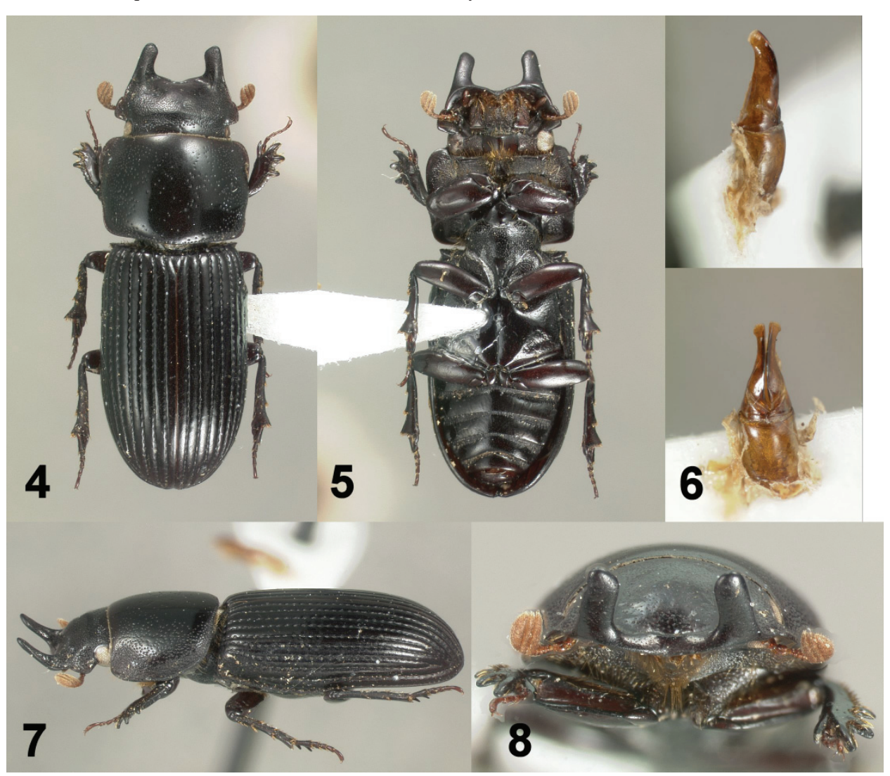
Figures 4–8. Saprovisca sarangay, holotype, male major. 4) Dorsal habitus. 5) Ventral habitus. 6) Genitalia, lateral and dorsal. 7) Lateral habitus. 8) Head, anterior view.

Remarks . The paratype male from South Luzon is similar to specimens from Mindanao, possessing similar diagnostic characters and all other characters studied. It is the smallest specimen studied and its horn development is intermediate between the major and minor males described.