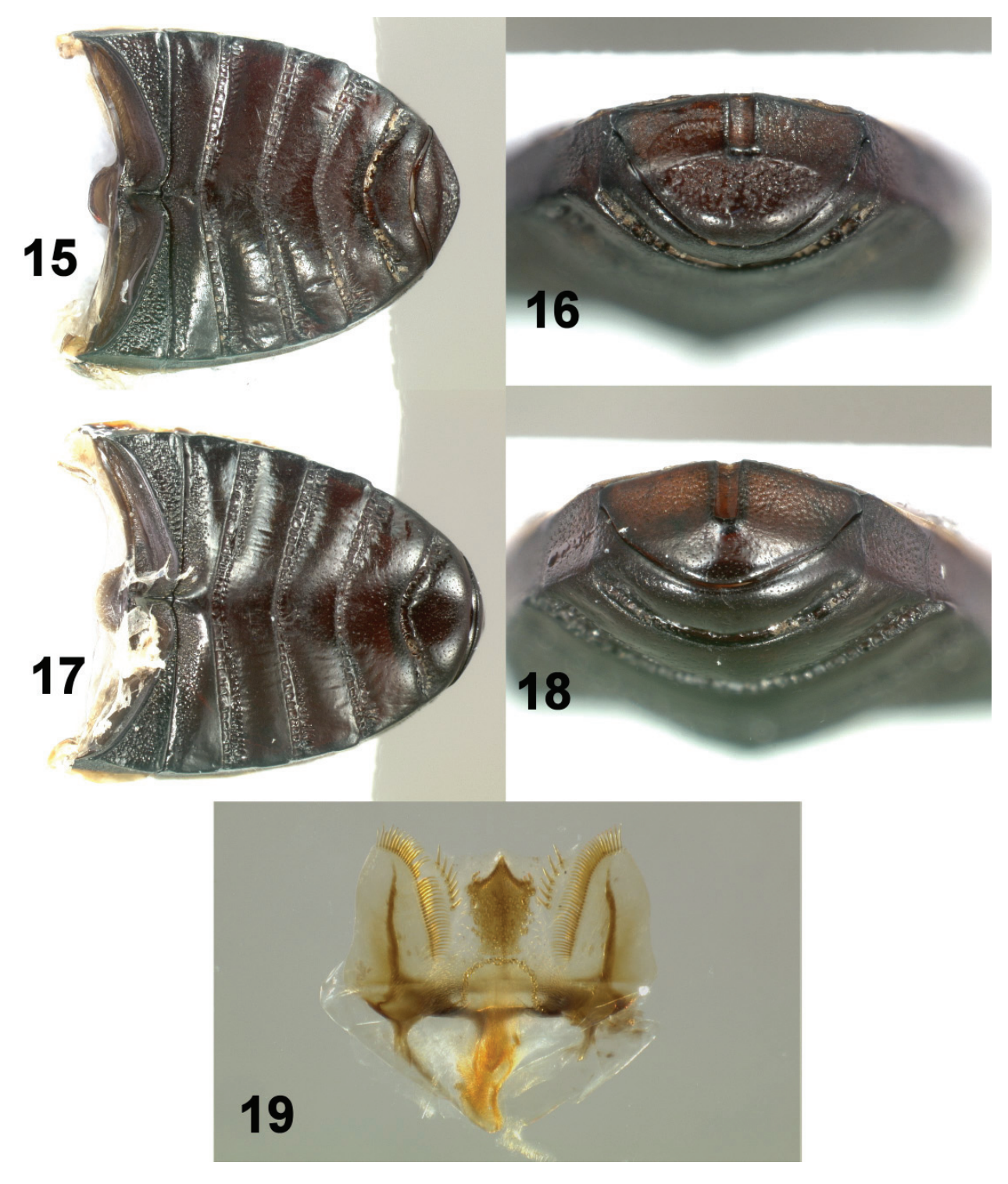
Figures 15–19. Saprovisca sarangay. 15–16) Abdominal sternites and pygidium, male paratype. 17–18) Abdominal sternites and pygidium, female allotype. 19) Epipharynx, male major paratype.