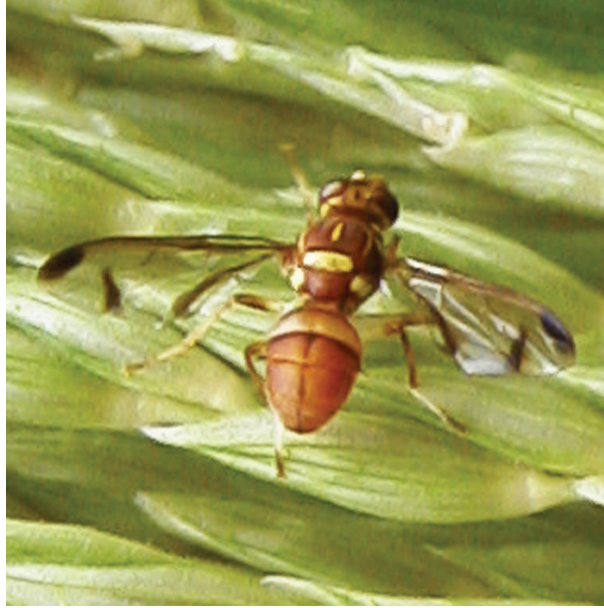
Figure 1. Adult male Bactrocera cucurbitae on a corn ( Zea mays L.) tassel, showing identifying features of black spot on the wing tip and a black band on the wing.