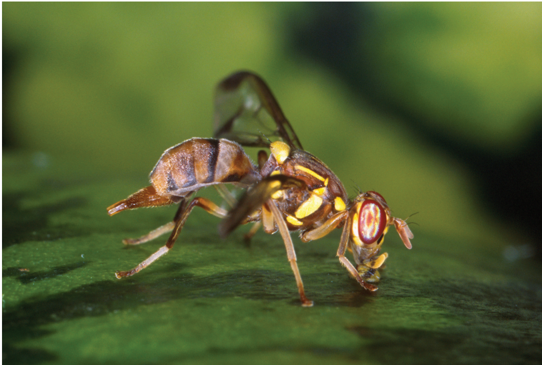
Figure 2. Adult female Bactrocera cucurbitae on watermelon fruit, Citrullus lanatus (Thunb.) Matsum. & Nakai.