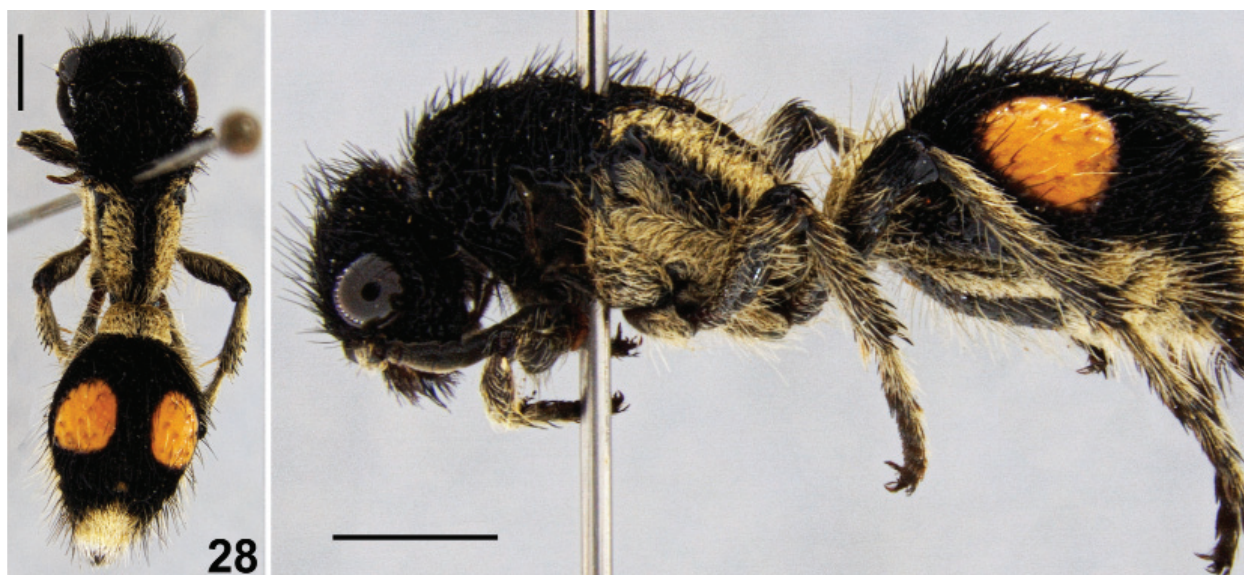
Figures 28–29. Traumatotutilla gemella André, 1906. 28) Habitus, dorsal view. 29) Habitus, lateral view. Scale bar: 3 mm.