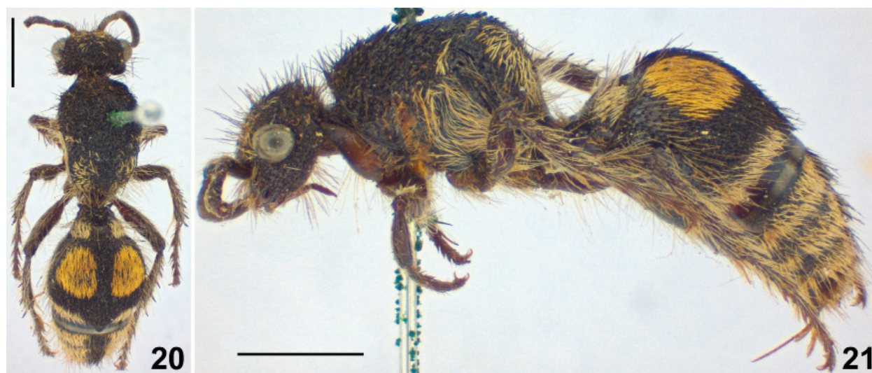
Figure 20–21. Traumatotutilla auriculata (Gerstaecker, 1874). 20) Habitus, dorsal view. 21) Habitus, lateral view. Scale bar: 3 mm.