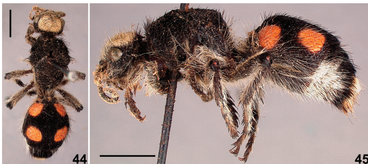
Figures 44–45. Traumatotutilla vitelligera (Gerstaecker, 1874). 44) Habitus, dorsal view. 45) Habitus, lateral view. Scale bar: 3 mm.