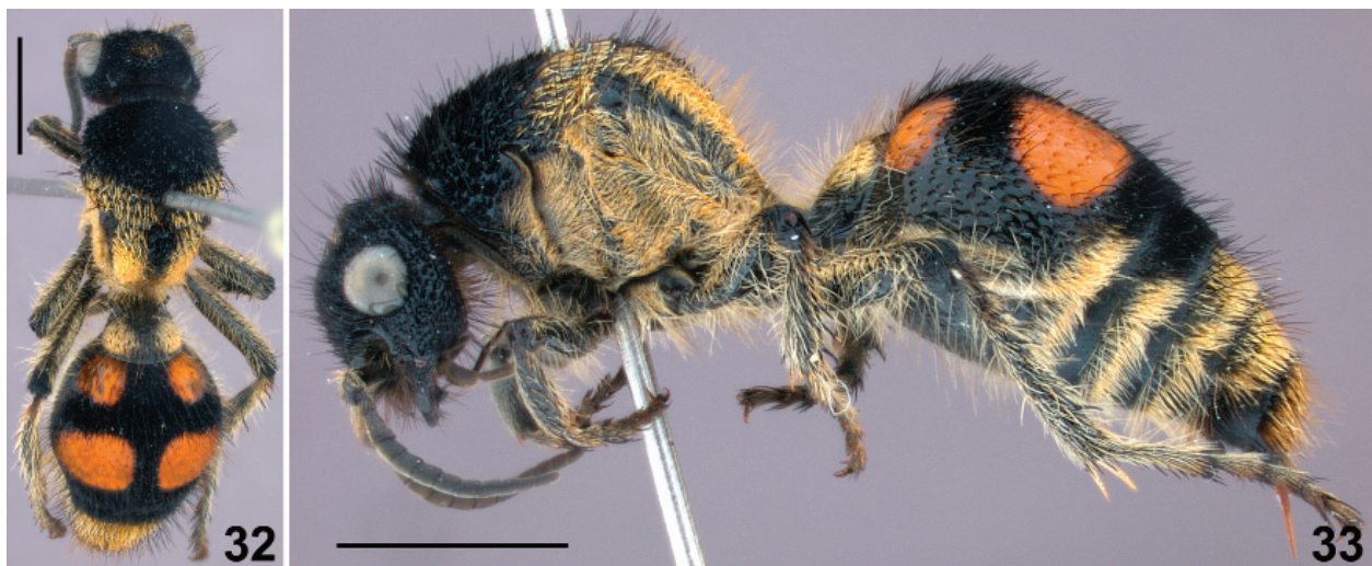
Figures 32–33. Traumatomutilla inermis (Klug, 1821). 32) Habitus, dorsal view. 33) Habitus, lateral view. Scale bar: 3 mm.