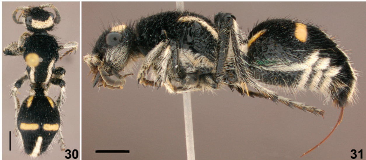
Figures 30–31. Traumatomutilla indica (Linnaeus, 1758). 30) Habitus, dorsal view. 31) Habitus, lateral view. Scale bar: 2 mm.