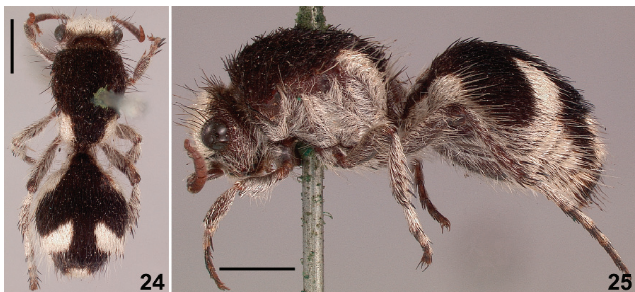
Figures 24–25. Traumatomutilla bifurca (Klug, 1821). 24) Habitus, dorsal view. 25) Habitus, lateral view. Scale bar: 2 mm.