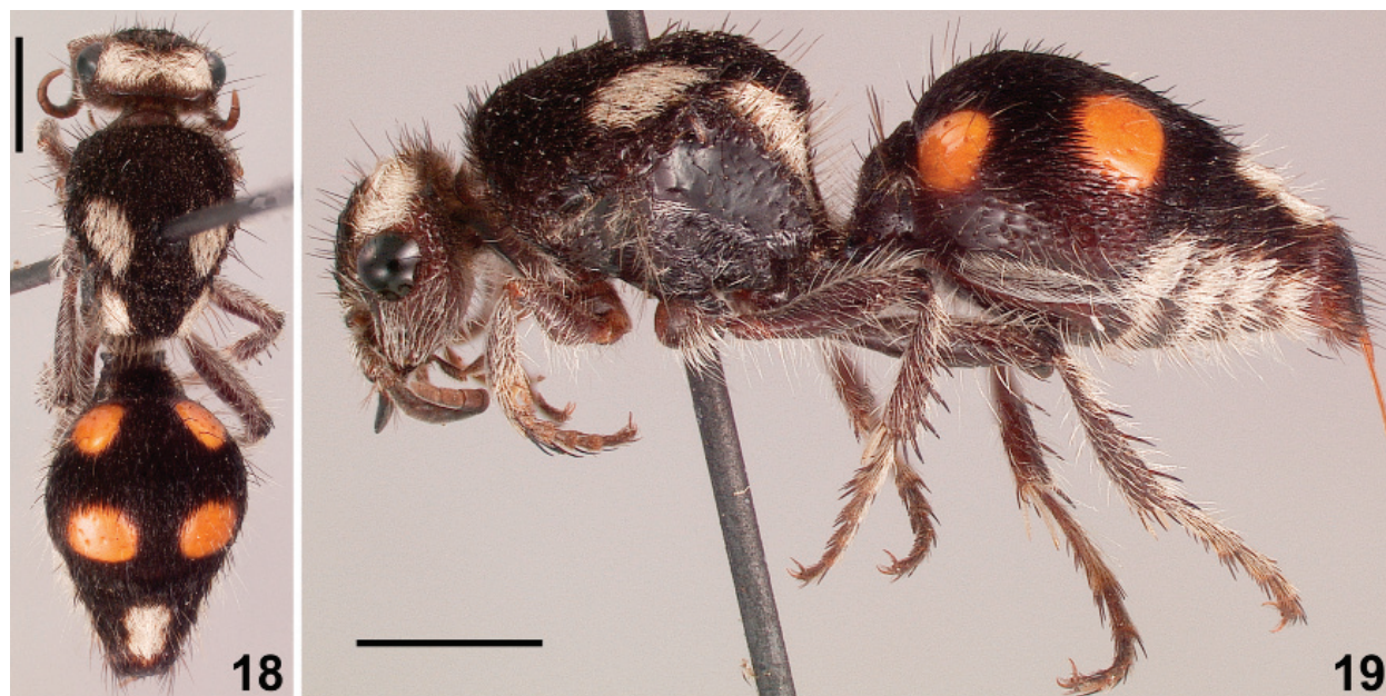
Figures 18–19. Traumatotutilla americana (Linnaeus, 1758). 18) Habitus, dorsal view. 19) Habitus, lateral view. Scale bar: 2 mm.