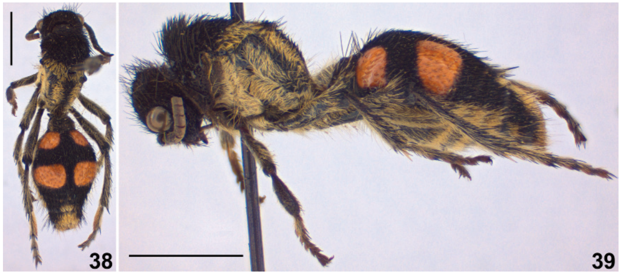
Figures 38–39. Traumatomutilla quadrinotata (Klug, 1821). 38) Habitus, dorsal view. 39) Habitus, lateral view. Scale bar: 5 mm.