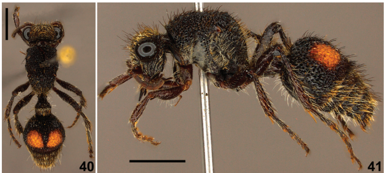
Figures 40–41. Traumatomutilla tabapua Casal, 1969. 40) Habitus, dorsal view. 41) Habitus, lateral view. Scale bar: 2 mm.