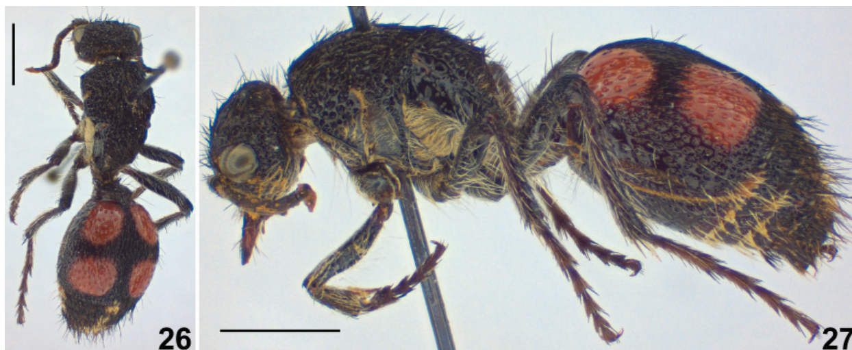
Figures 26–27. Traumatotutilla diabolica (Gerstaecker, 1874). 26) Habitus, dorsal view. 27) Habitus, lateral view. Scale bar: 3 mm.