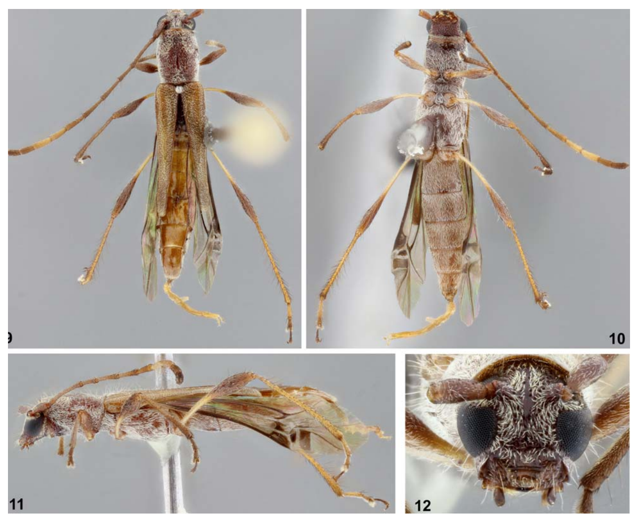
Figures 9–12. Rhinion parkeri sp. nov., holotype female. 9) Dorsal habitus. 10) Ventral habitus. 11) Lateral habitus. 12) Head, frontal view.