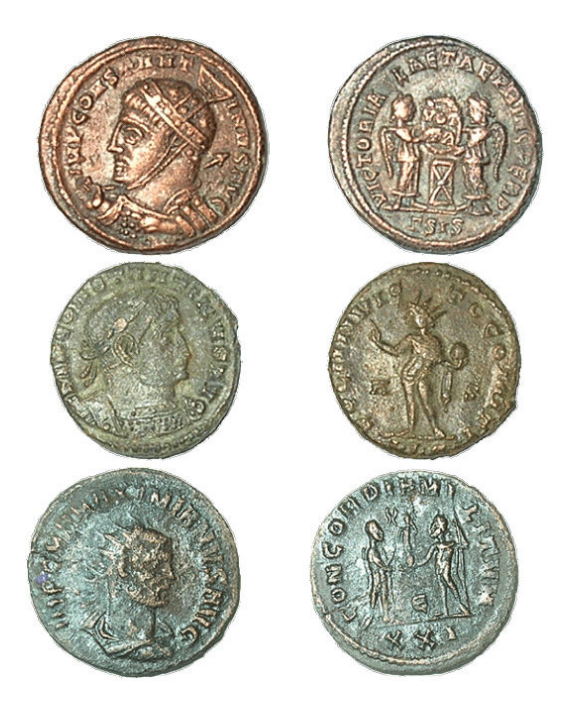
Figure 3. A selection of excavated coin finds from Yotvata, Israel. A.) follis of Constantine the Great, RIC VII (Siscia) 55; B.) follis of Constantine the Great, RIC VII (Lugdunum) 53; C.) follis of Maximian, RIC V.2 (Max. Herc.) 607.

Those who argue that proper archaeological sites do not produce large numbers of coins are simply unfamiliar with the scholarly literature. Many large hoards and thousands of single finds can be found at sites of varying sizes. Familiarization with the Fundmünzen inventories and similar publications will show that coin finds frequently are found in great numbers at civilian and military sites alike, as the numbers from Burghöfe illustrate. The idea that large hoards, devoid of any archaeological context associated with settlement-remains, satisfy collector and dealer demand is a fallacy; in fact, the selling practices of many coin dealers betray this notion. For example, when looking at bulk lots of coins on eBay and VCoins, one can read in the descriptions various disclaimers that there may be a mixture of Greek, Roman, Islamic, Medieval, or even modern coins in the lots; clearly, these are not the contents of an ancient hoard, which usually would have a much tighter chronological association, but rather the accumulation of coins robbed from multiple archaeological sites with different periods and ranges of occupation.