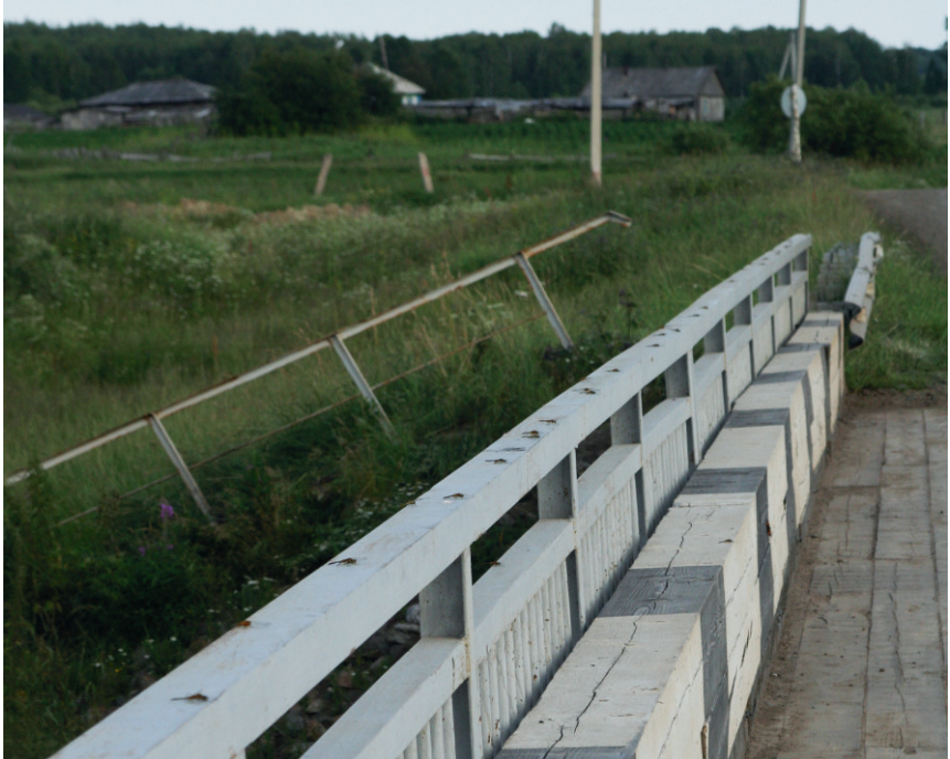
Figure 11. Sympetrum flaveolum perching at a railing of a bridge across the Uy River in Orlovka village (Loc. 1), 16.07.2015.

An abundance of these dragonflies at a waterless peat-moss bog was quite surprising. They perhaps migrated there for feeding from the surrounding shallow reed swamps, where this species would find its preferred breeding habitat, but where I failed to observe any individual.