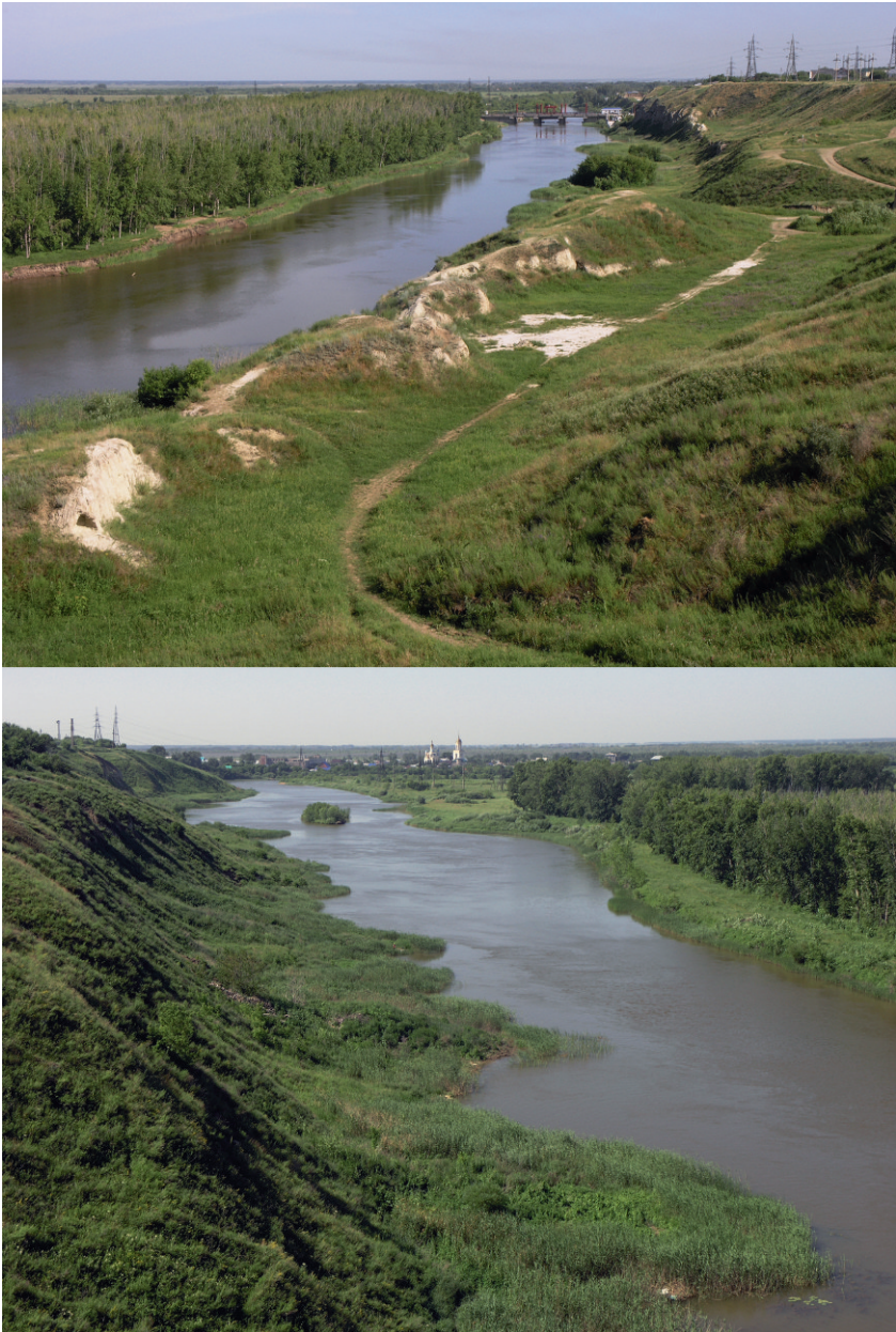
Figure 2. The Ishim River in the northern part of the city of Petropavlovsk (Loc. 1a). 26.06.2015.