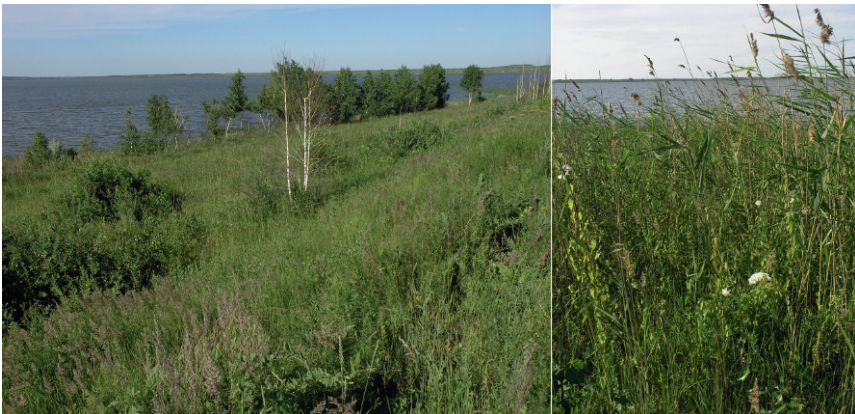
Figure 6. The south-eastern bank of Lake Bol'shoe Beloe (Loc. 6). 27.06.2015.