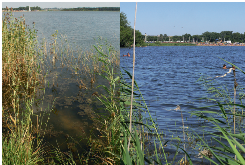
Figure 8. The south-western bank of Lake Pestroe at the Petropavlovsk southern suburbs (Loc. 9). 28.06.2015 (right) and 16.08.2015 (left).