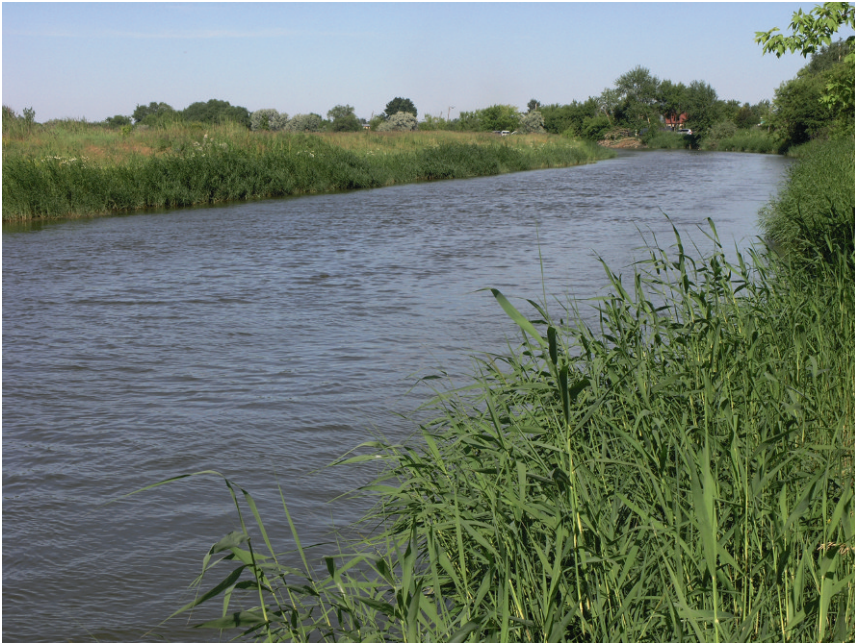
Figure 5. A warm-water channel from the power station to Lake Bol'shoe Beloe (Loc. 5a). 27.06.2015.