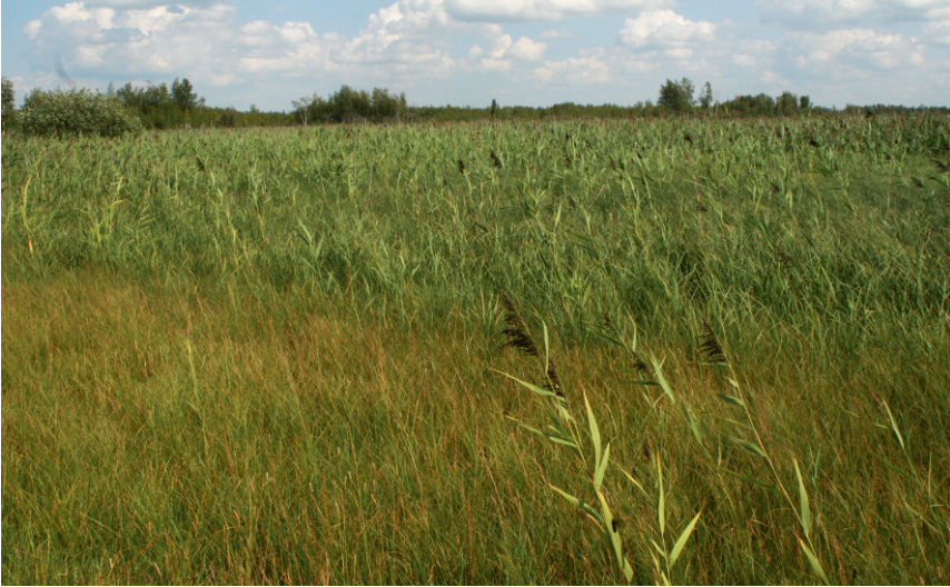
Figure 3. A reed swamp margined by a damp sedge meadow (Loc. 5) at the major Paganay Bog near Usmanka village, a habitat of Lestes dryas , L. barbarus , Coenagrion puella , Aeshna serrata , Sympetrum flaveolum , 15.07.2015.