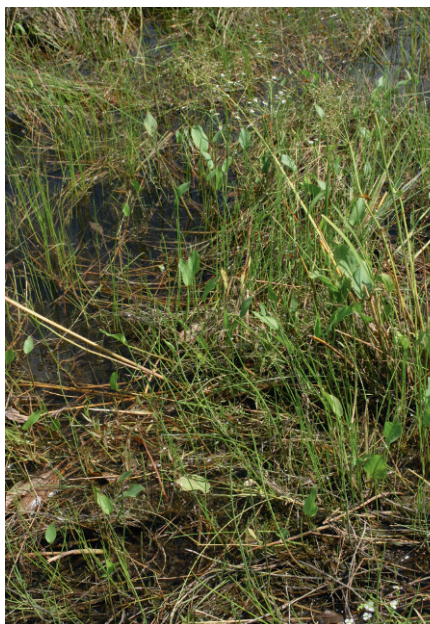
Figure 7. A shallow roadside swamplet at the Kyshtovka village northern margin (Loc. 3b), a habitat of Lestes dryas , L. sponsa , L. virens , L. macrostigma , Libellula quadrimaculata , Sympetrum flaveolum , 16.07.2015.