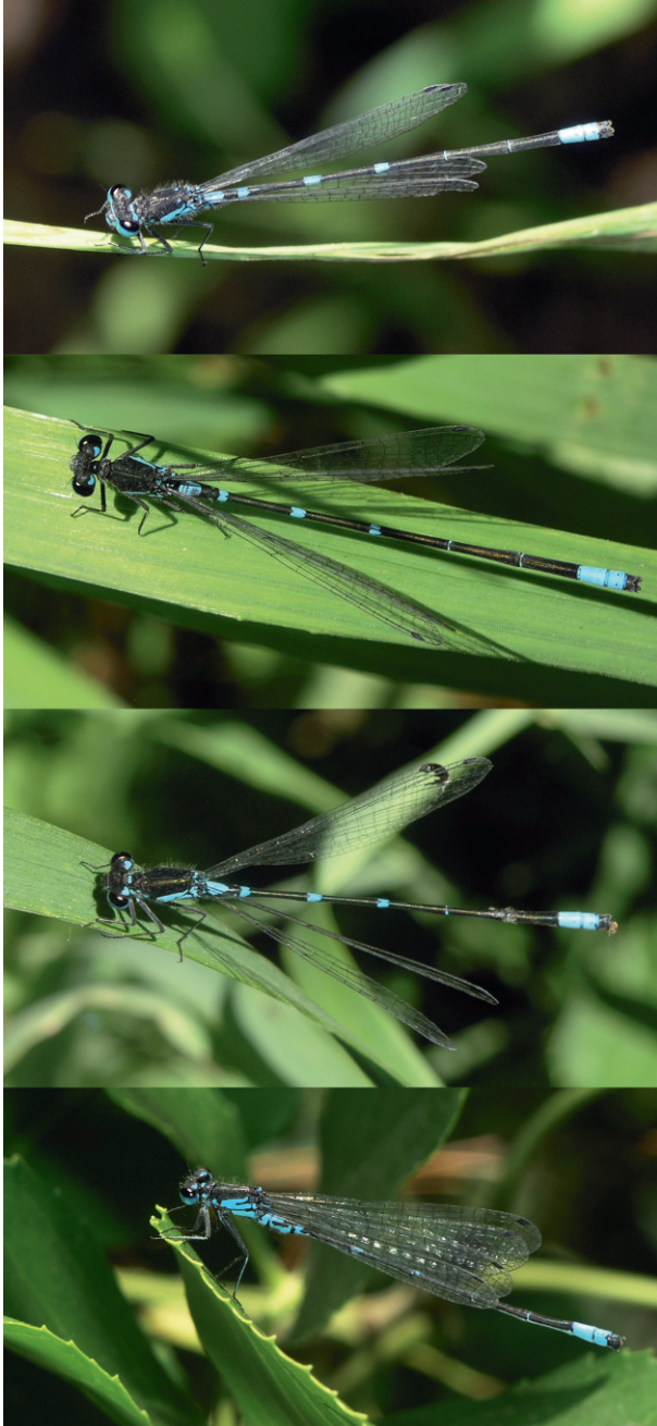
Figure 10. Four different males of Coenagrion pulchellum sibiricum at the eastern bank of the Kamenka oxbow lake of the Ishim floodplain (Loc. 7). 28.06.2015 (left).