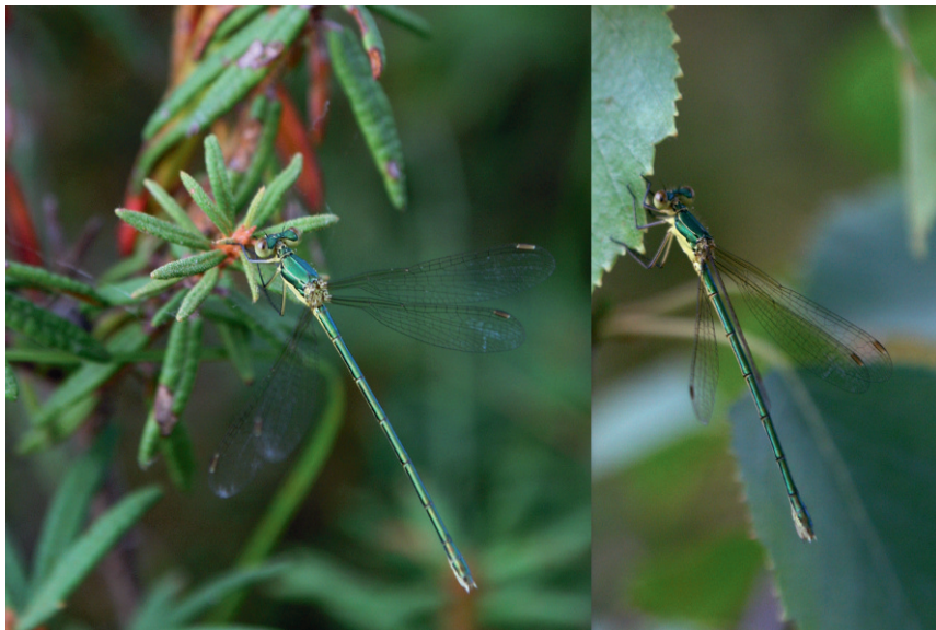
Figure 10. A female of Lestes virens at the raised peat-moss bog with pine (Loc. 6) 3.7 km NE Usmanka village, 15.07.2015.