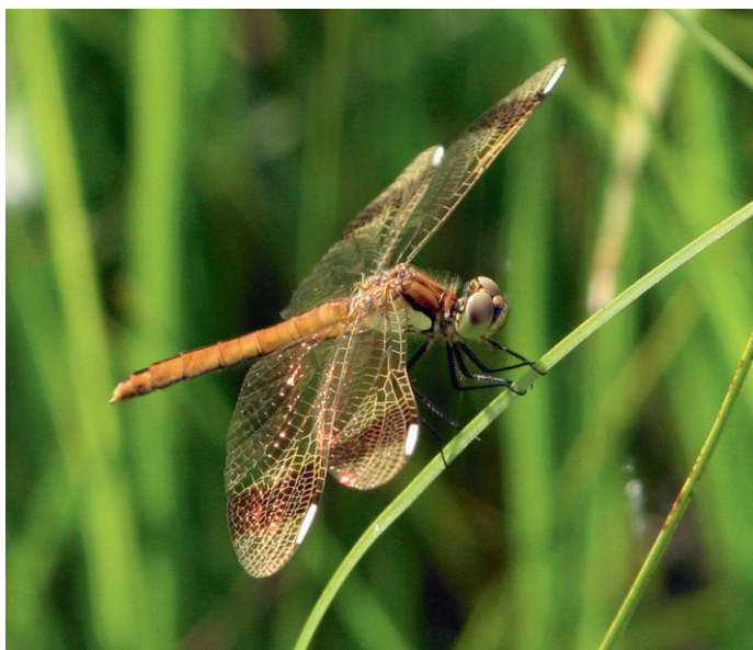
Figure 13. A female of Symptetrum pedomontanum at a small sedgy marsh (Fig. 9) at Lake Pestroe SW bank (Loc. 9), 16.08.2015.