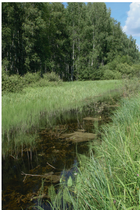
Figure 6. A long roadside swamp at the Kyshtovka village northern margin (Loc. 3a), a habitat of Lestes dryas , L. sponsa , L. virens , L. macrostigma (?stray), Coenagrion ecornutum , C. puella , Aeshna juncea , Libellula quadrimaculata , Sympetrum flaveolum , S. sanguineum , 16.07.2015.