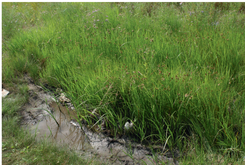
Figure 9. A small marsh with Juncus sp. and Carex sp. at the south-western bank of Lake Pestroe at the Petropavlovsk southern suburbs (Loc. 9), a habitat of Lestes dryas and Sympetrum pedemontanum . 16.08.2015 (left).