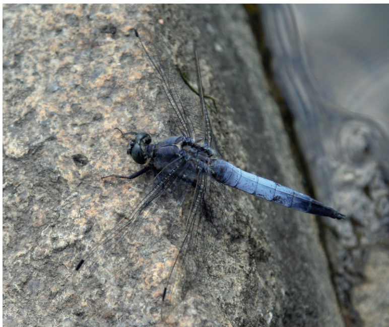
Figure 12. A male of Orthetrum cancellatum at Lake Pestroe SW bank (Loc. 9), 16.08.2015.