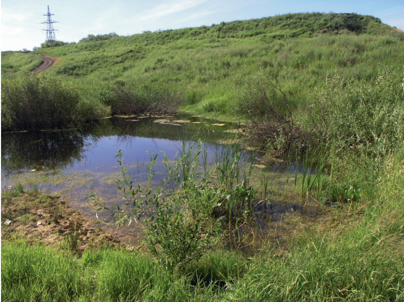
Figure 3. A pool in a fold of the Ishim Right bank (Loc. 1b). 28.06.2015.