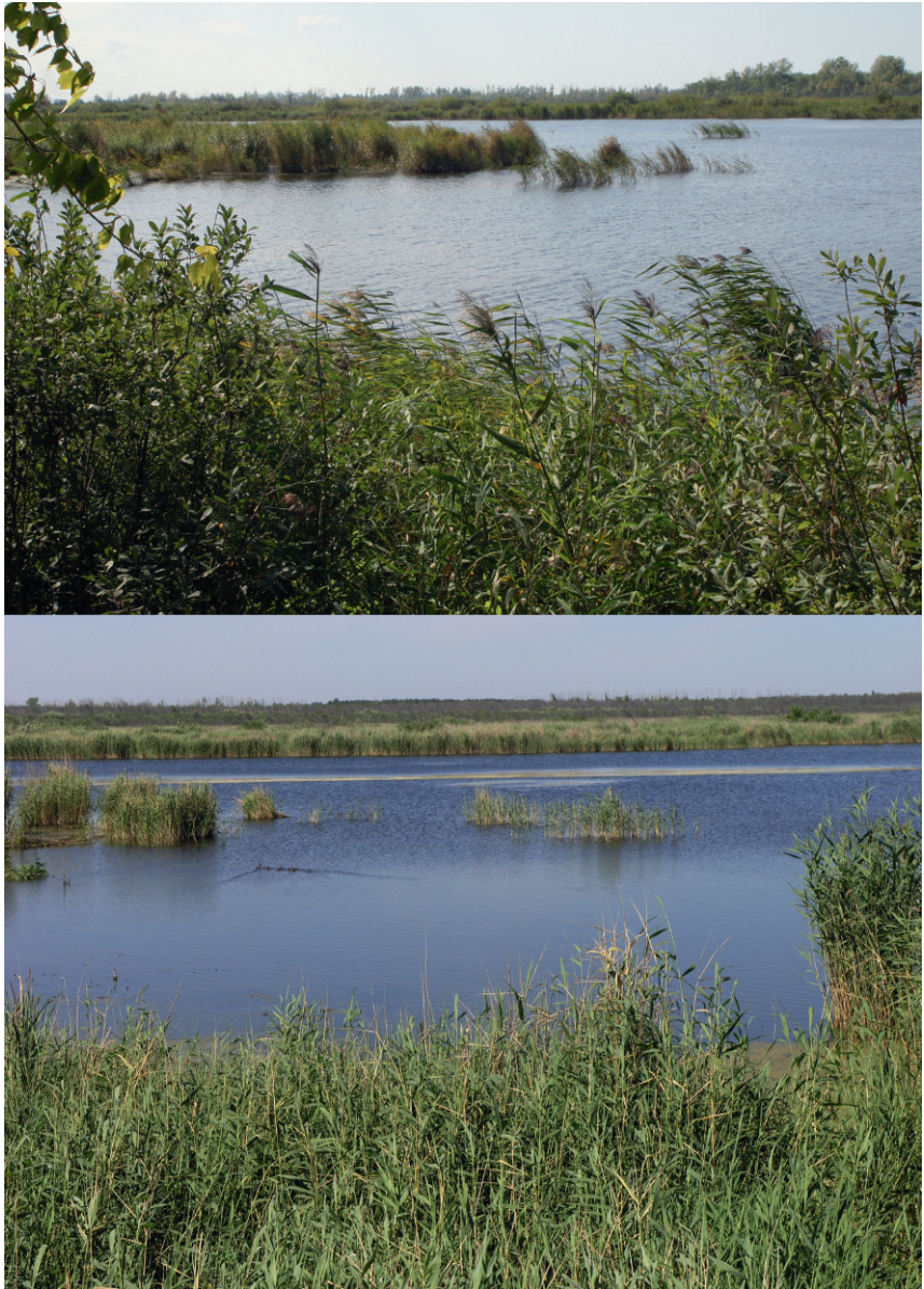
Figure 7. The eastern bank of the Kamenka oxbow lake of the Ishim floodplain (Loc. 7). 28.06.2015 (below) and 16.08.2015 (above).