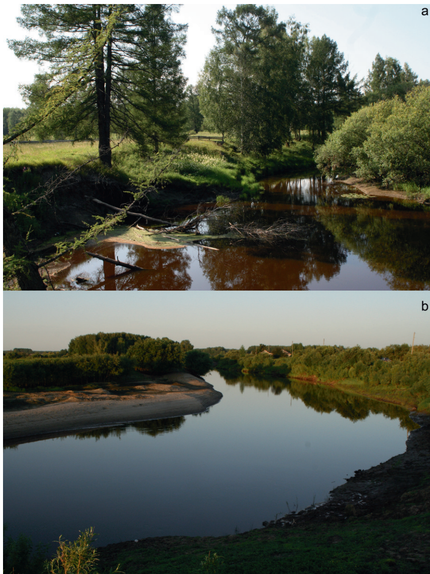
Figure 2. The rivers of Kyshtovka District of Novosibirsk Province: a – the Uy River at Orlovka village (Loc. 1), 16.07.2015; b – the Tara River at Kyshtovka village (Loc. 4), 14.07.2015.

pine ( Pinus sylvestris L.) with admixture of Siberian larch ( Larix sibirica Ledeb.) in the upper layer; and Siberian spruce ( Picea obovata Ledeb.) with admixture of Siberian