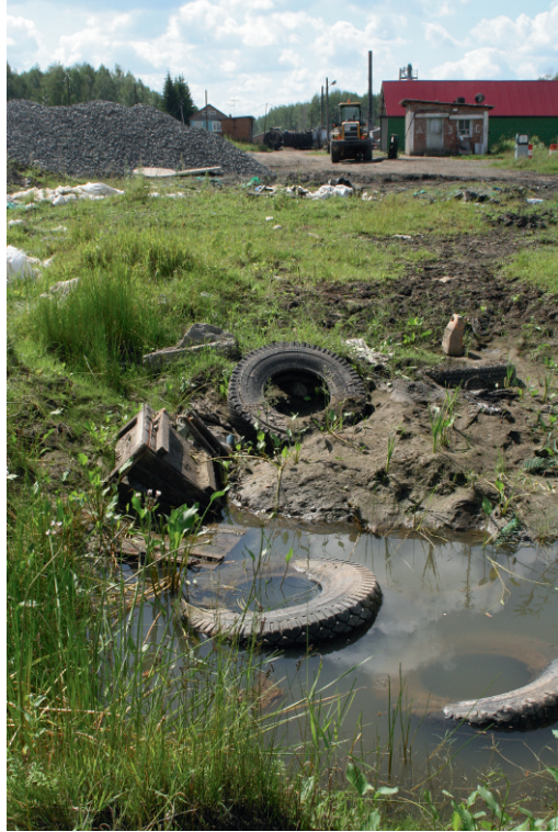
Figure 8. A small water-filled hole at the Kyshtovka village northern margin (Loc. 3c), a habitat of Lestes dryas and L. macrostigma , 16.07.2015.

Locality 3c. 600-700 m from Loc. 3a, ca 300 m from Loc. 3b. A flooded and garbage-strewn man-made hole (3x5 m) at a construction site, with Juncus sp., Eleocharis sp., A. plantago-aquatica and Butomus umbellatus L. (Fig. 8). 56°34'36" N, 76°36'04" E. 95 m a.s.l.