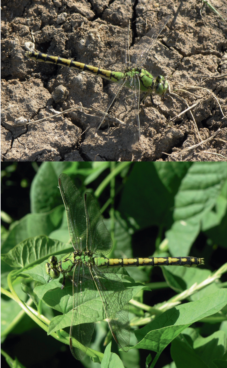
Figure 11. Ophiogomphus cecilia is well camouflaged at any background: a male (top) and female (bottom) at the Ishim River right bank (Loc. 1a, 28.06.2015 and Loc. 1c, 26.06.2015, respectively).