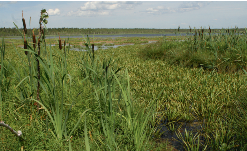
Figure 4. The western water margin of the large Lake Kyshtovo (Loc. 2) at Kyzhtovka village, a habitat of Lestes dryas , Sympecma paedisca , Enallagma cyathigerum risi , Aeshna grandis , Libellula quadrimaculata , Sympetrum flaveolum , S. danae , 14.07.2015.