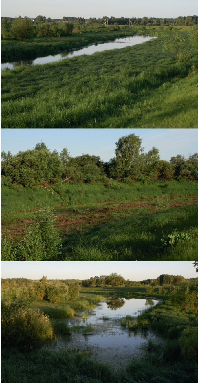
Figure 9. The Tara River right bank oxbows at Kyshtovka village (Loc. 4), habitats of L. sponsa , Aeshna grandis , Somatochlora metallica , ? S. flavomaculata , Libellula quadrimaculata , Symptetrum flaveolum , S. vulgatum , 14.07.2015.