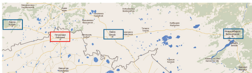
Figure 1: Cities involved in this study or discussion: Blue frame: Kurgan, Tomsk, Novosibirsk (Russia); red frame Petropavlovsk (Kazakhstan)

and serving as provincial centres: Kurgan (55°25-30' N, 65-90 m a.s.l., 326 thousand people), Petropavlovsk (54°50-55' N, 95-145 m a.s.l., 208 thousand people), Omsk (54°54'-55°05' N, 70-125 m a.s.l., 1 million 173 thousand people), and Novosibirsk (54°50'-55°07'°N, 90-220 m a.s.l., 1 million 567 thousand people) (Figure 1). These cities respectively reside on the banks of the major rivers of Tobol, Ishim, Irtysh and Ob', and are separated by distances of 273, 278 and 610 km. Presently three of these cities, Kurgan, Omsk and Novosibirsk are in Russia while Petropavlovsk is the northernmost city of Kazakhstan. (Recently Petropavlovsk, named after saints Peter and Paul, was officially renamed to Petropavl but the original Russian name is still in the predominant use even locally.) It would be very interesting to compare data on local fauna and flora of the immediate environs of these four cities to observe an effect of longitude. Unfortunately, they are too unevenly explored.