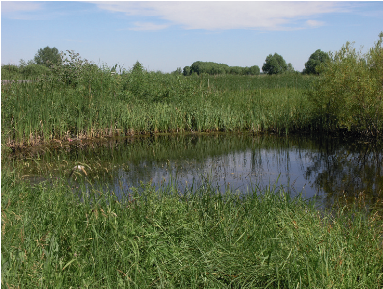
Figure 4. A small roadside swamp in the Petropavlovsk north-eastern environs (Loc. 4). 27.06.2015.