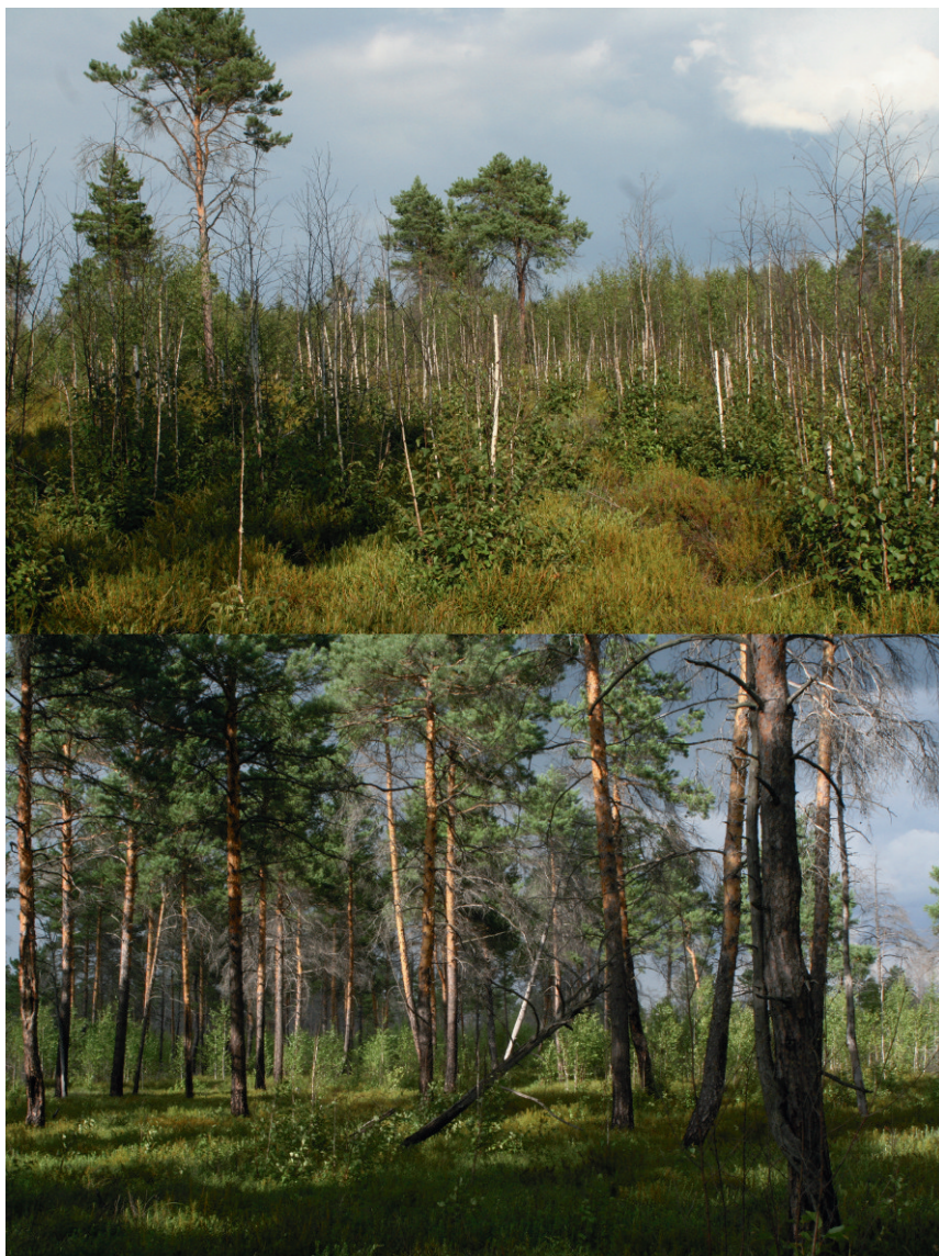
Figure 5. A round raised peat-moss bog (local ryam) (Loc. 6) inside the Paganay Bog at Usmanka village, a foraging habitat of Lestes dryas , L. virens , L. barbarus , Sympetrum flaveolum , S. vulgatum . 15.07.2015.