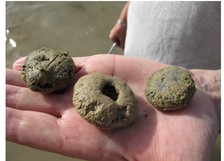
Mystery "donuts" at Khor

Khor Madfaq is the mouth of a watershed that, after the heaviest rains, drains the mountain and gravel plains from Masafi to Mleiha. This estuary was once home to mudskippers and spoon worms but is today better known for kite surfers (and in our case for air-rifle target practice) and its views of the modern-day Aztec city rising at nearby Jazirat al-Hamra. This site also added another "What is it?" challenge in the form of the mystery "donuts" found there (see photo below).