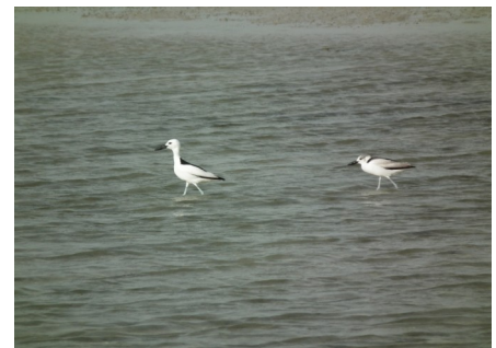
Adult and immature Crab Plover

Neil Tovey's IEW expedition started the day with a good selection of waders at Khor al-Beidhah in Umm al-Qaiwain, including some distant Crab Plovers, one of the UAE's signature birds.