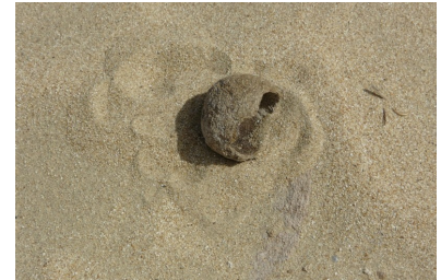
A hollow hemisphere of brittle, sandy material

ameter, made of fine sandy material like a small, thick eggshell, but very hard and rock-like in texture, as if the sand grains had been glued tightly together, and having the texture and appearance of rough, fired clay.