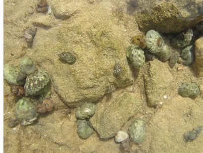
Turbo coronatus , now an abundant colonizer at Khor Zawrah (the pale green, turban-like shell)

upper channels; an evident decline in the number of common mud creepers Cerithidiopsilla cingulata (syn. Cerithidea cingulata ); an impressionistic decline in the abundance of mangrove tree snails ( Littoraria intermedia ); and the absence of fiddler crabs ( Uca annulipes et al.).