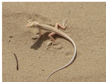
Striped Fringe-Toed Lizard

New to several participants was the Black-Crowned Finch (or Sparrow) Lark, a distinctive looking bird that nevertheless blends into oblivion on the sandy gravel plains of the area. Another highlight was a sighting of the uncommon Striped Fringe-Toed Lizard ( Acanthodactylus gongrorhynchatus ), a relative of the more common White Spotted Fringe-Toed Lizard ( A. schmidti ).