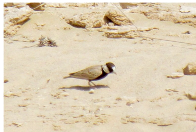
Black-Crowned Finch Lark

the car doors than we encountered the tracks of a Monitor Lizard ( Varanus griseus ), which we followed to reveal the beast's meanderings among the shrubs that dotted the low dunes. Tracks and droppings of gazelle were also common, and it appears they may receive supplemental food and water, but it also appears that camels have been kept away from the area for some time. Tracks of Brown-Necked Ravens (see photo) were common. Tracks of Desert Hares and Hoopoe Larks were also seen but were not common.