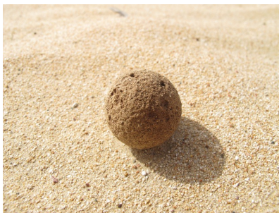
Photo: An intact sphere, showing the tiny holes

va emerge from such a hard "shell"? Does an intact ball represent a failed breeding attempt, unearthed prematurely (or much later) by the shifting sands? Finally what accounts for the two tiny holes. Are these where the female beetle inserted her ovipositor? Or is the answer more sinister? Has something else (a predator or parasite?) entered or exited? If the latter, does that explain the "failure" of this particular ball?