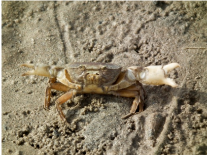
The Violet Crab Eurycarcinus orientalis in threat posture

crab was new to Binish, who immediately noticed something that had escaped Gary in years of intermittent sightings: The two claws of the crab, although normally roughly equal in size, are distinctly asymmetrical.