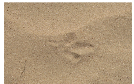
Tracks of Brown-Necked Raven

The IEW trip to Dubai's hinterland traversed the area inland of the Jebel Ali to Hatta Road and along the border with Abu Dhabi -- an area once called the Southern Loop, that is today much modified and has therefore much neglected from the point of view of plant and animal life. It is difficult to appreciate that only 20 years ago it was genuinely remote, without even good graded roads.