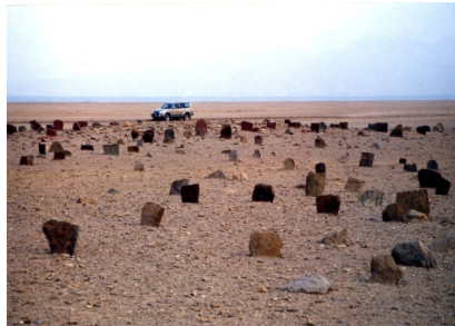
The Quick & the Dead

for background information about the site. The basic information is thus: