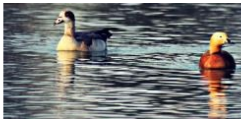
Egyptian Goose and Ruddy Shelduck

Australian Wood Duck, Muscovy Duck, Ferruginous Duck, Falcated Duck, Northern Pintail Duck, Common Shelduck, Eurasian Wigeon, Chiloee Wigeon, Mute Swan, Great Egret and Grey Heron.