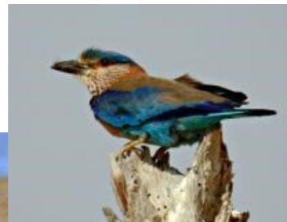
Indian Roller ( Coracias benghalensis )