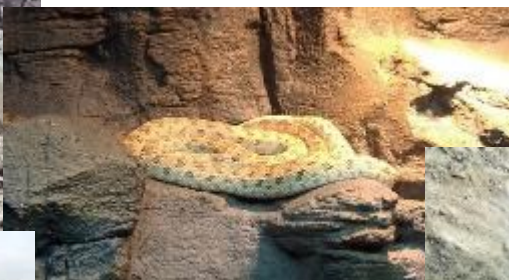
Clifford's Diadem Snake