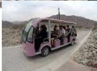
Tour bus within the Centre