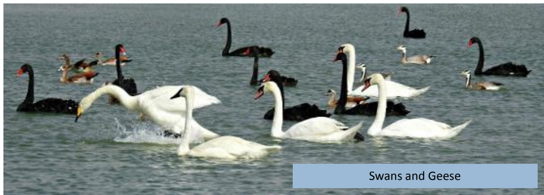
Swans and Geese