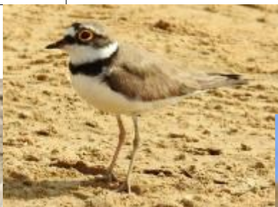
Little Ringed Plover (Charadrius dubius)