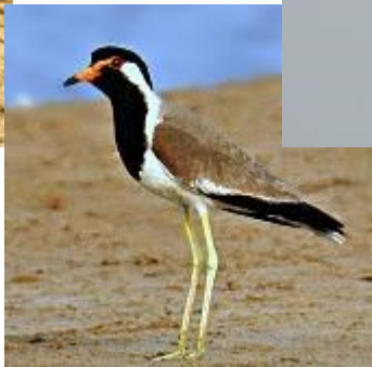
Red-wattled Lapwing (Vanellus indicus)