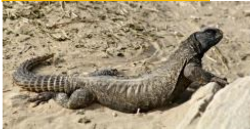
Egyptian Spiny-tailed Lizard (Dhub) (Uromastix egyptia microlepis)