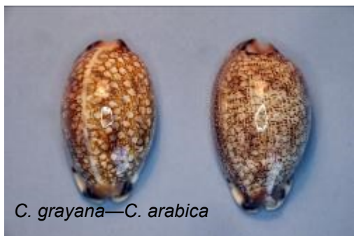
C. grayana — C. arabica

The largest cowrie in the UAE, which is commonly found washed up on the beaches on both West and East coasts, is