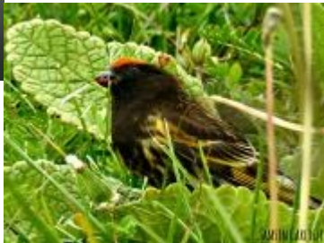
Fire-fronted Serin ( Serinus pusillus )