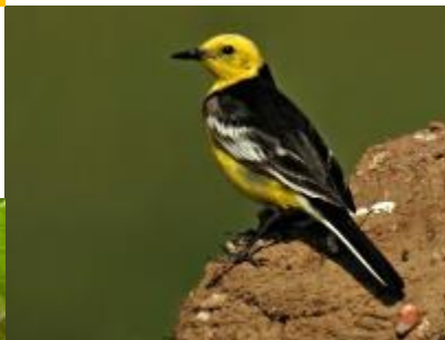
Citrine Wagtail—male ( Motacilla citreola )