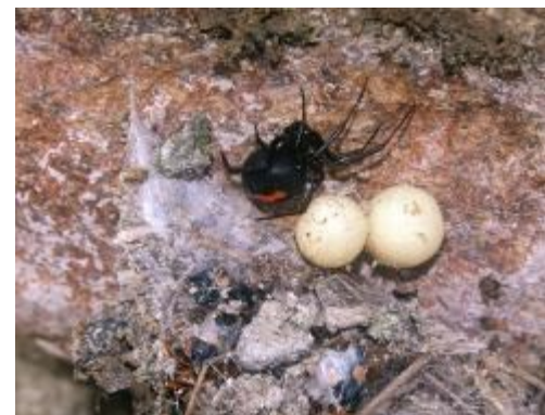
A UAE Redback female Latrodectus cf. cinctus (not an Australian import), guarding her smooth spherical egg cases in a Hajar Mountain wadi.