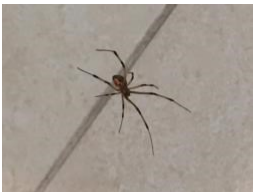
A Brown Widow female, Latrodectus geometricus, a brown spider with a red-orange hourglass shape on the underside of her abdomen.