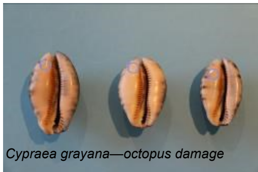
Cypraea grayana —octopus damage