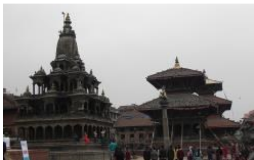
Shree Pashupatinath Temple, Kathmandu