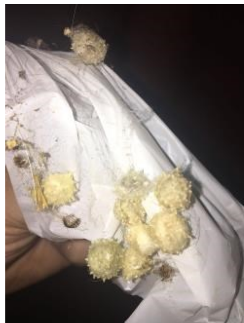
The distinctive, spiky spherical egg cases of the Brown Widow.