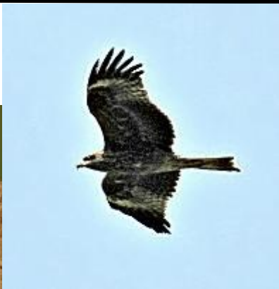
Black Kite ( Milvus milvans )