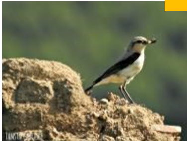
Northern Wheatear ( Oenanthe oenanthe )