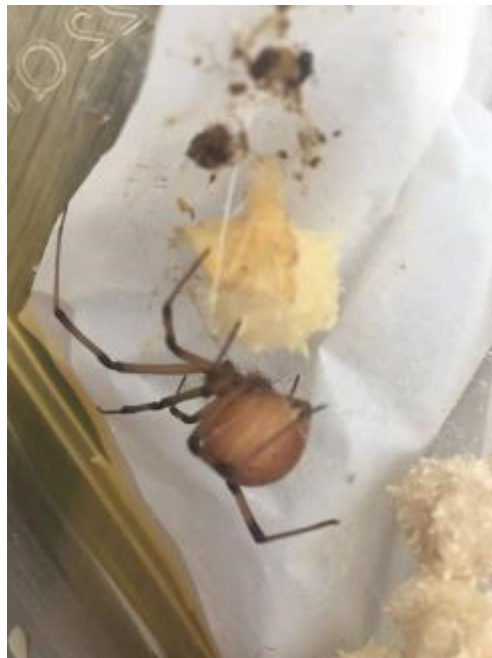
Posterior view of a Brown Widow female showing the fully mature color. In juveniles and some adults, the dorsal abdomen may be marked with diagonal white bands.

All Latrodectus species should be treated with care. The Redback is