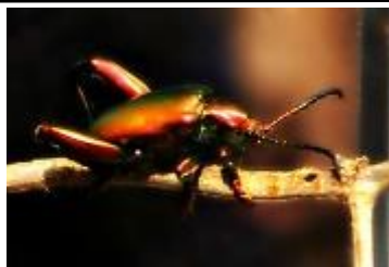
Frog-legged Beetle Sagra femorrata