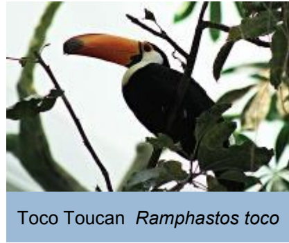
Toco Toucan Ramphastos toco

Some of you may be lucky enough to visit a real rainforest over the summer. If you do, send some photos of what you see to gazelleeditor@gmail.com We would love to publish photos and reports of anything at all connected to natural history, in the July/August or September edition.