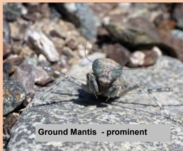
Ground Mantis - prominent