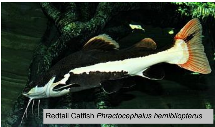
Redtail Catfish Phractocephalus hemibliopterus

There are 3,000 species of plants and animals in the bio-dome and each one fits uniquely into its part of the eco-system. From fish, giant beetles and centipedes to freely-flying colourful birds, all were fascinating!