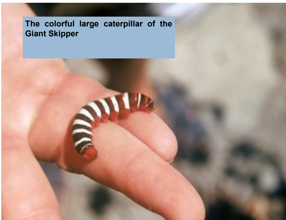
The colorful large caterpillar of the Giant Skipper