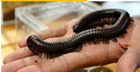
Giant African Millipede Archispirostreptus gigas