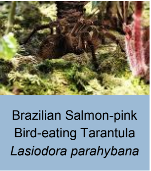
Brazilian Salmon-pink Bird-eating Tarantula Lasiodora parahybana