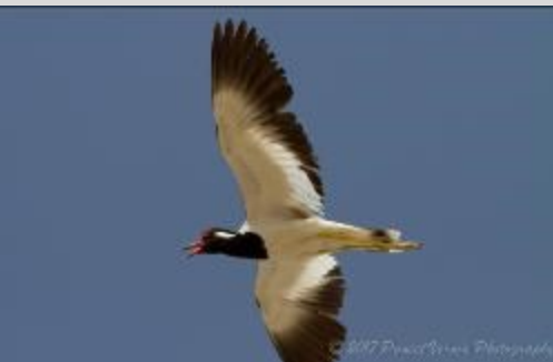
Red Wattled Lapwing Vanellus indicus in flight, protecting its young

Finally, a newly-hatched and abandoned egg shell was noticed on the edge of the lake. I'm not sure from which bird, but it's definitely not from the Lapwing. It was, however, close to the newborn chicks.