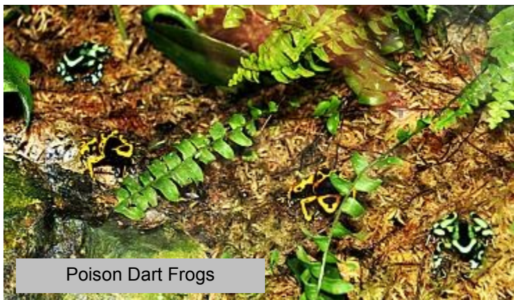
Poison Dart Frogs

We could see that The Green Planet was proving popular amongst other visitors too, as we descended through the middle layer of the rainforest, observing the creatures that co-exist amongst larger-leaved foliage (the predatory and poisonous, safely tucked away inside translucent exhibit