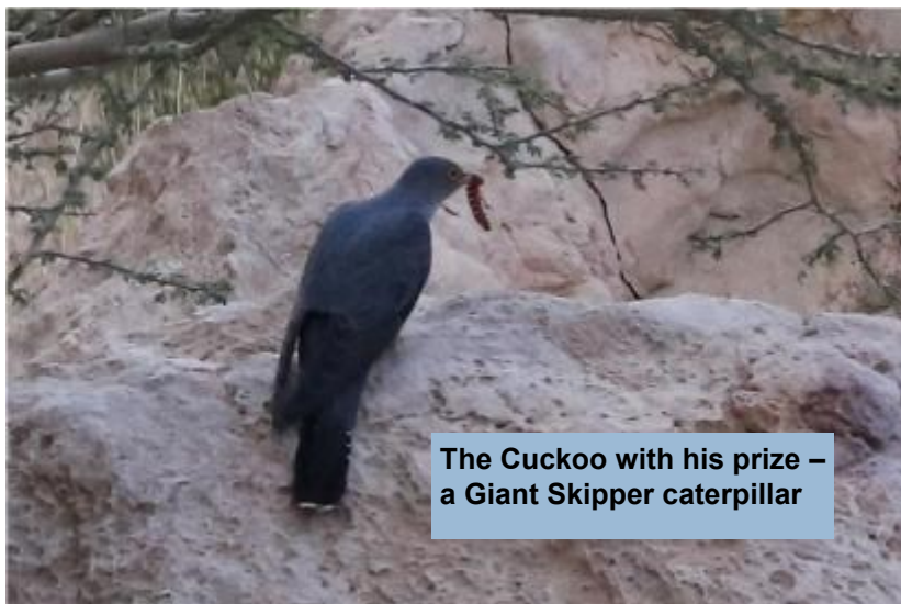
The Cuckoo with his prize – a Giant Skipper caterpillar