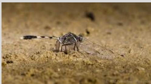
Slender Skimmer Dragonfly Orthetrum sabina