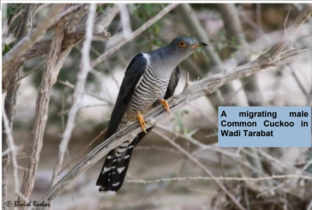
A migrating male Common Cuckoo in Wadi Tarabat

Contribution by Gary Feulner and Binish Roobas