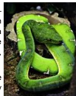
Emerald Tree Boa Corallus caninus

Article by Margaret Swan (see more photos on pages 2 and 3)