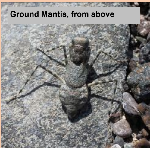
Ground Mantis, from above