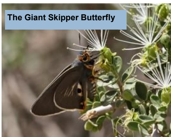
The Giant Skipper Butterfly