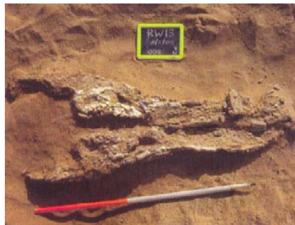
Elephant jaw in situ (Scale 1 metre) From Abu Dhabi 8 Million Years Ago