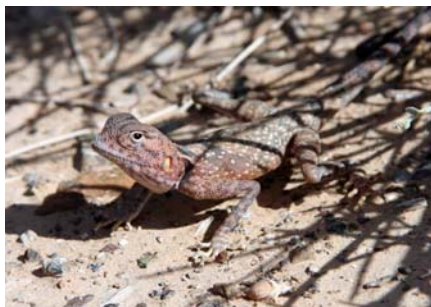
Agama with red hue...

During a recent walk in a tributary of Wadi Shawkah, between Dhaid and Madam, we disturbed a blue rock agama ( Pseudotrapelus sinaitus ), which treated us to a colourful display during our lunch stop. When we first spotted the agama under a small bush it had a rather ruddy red colouration and blended in well with the background.