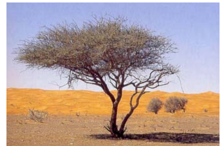
A. tortilis Photograph Marijcke Jongbloed's book on wild flowers of the UAE

since it grows as a shrub, i.e., as numerous sub-parallel vertical trunks. Also, it rarely grows as large as A. tortilis .