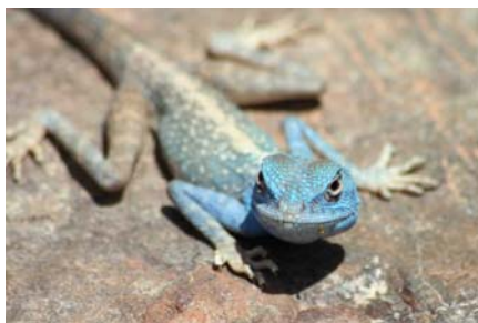
...and now blue!

However, after leaving that spot in favour of an exposed rock face in full sunlight, the reptile almost immediately started to change colour and after little more than 5 minutes, his head and shoulders were bright blue.