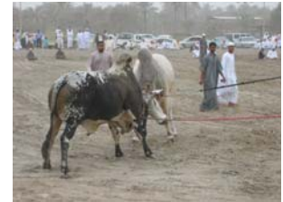
Bull pushing, Fujeirah

On the evening of Friday 27th we will be holding the Inter-Emirates photographic competition. The format of this is changed. Please see pp.6&7 for all the details you'll need.