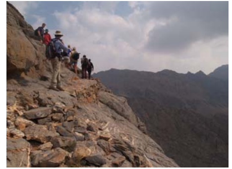
Stone work made the trail easier

The trail showed clear evidence of recent improvements but was nevertheless a relentless climb.