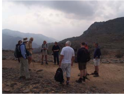
The group enjoyed cool weather

local man and two local teenagers, along with several laborers, making this trail one of the busier ones in the area.