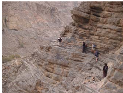
The ascent trail was a scenic one, with many photo opportunities.

The day was generally overcast but never threatening, although heavy rains in RAK in the preceding days had washed out a section of the normal access wadi – perhaps not surprising considering that recent quarrying had lowered it to well below the former base level.