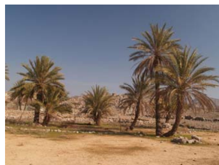
Palm gardens at Difan

Five of us met early on a Saturday morning for the shelling trip. After a few mishaps on finding 'black palace beach' for the novices (luckily there is a u-turn just beyond the entrance to the beach so we weren't delayed) we found the beach to be more or less empty of sun-seekers but full of shells.