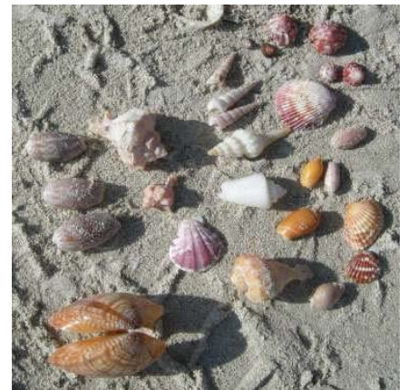
Some of the shells found

We scoured the beach only to discover that Sandy's plan of sitting in one spot and picking shells within reach drew a greater variety of shells than all of us combined had managed to gather.