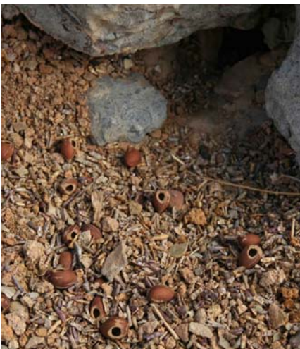
The debris of last night's dinner

We're not the only fans of the almonds of course. During a chilly walk in the same area on Christmas Day last year we found a small rodent burrow, easy to spot because of the excavated debris outside the hole, topped with a collection of almond shells, each one neatly nibbled open at the top.