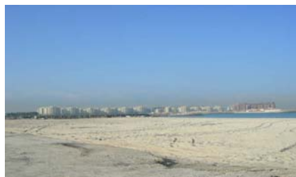
Black palace beach

Three labourers and a goatherd were also in residence during our Friday afternoon visit, and for Gary Feulner there was a happy reunion with an older Pakistani labourer met some eight years earlier, at the time of construction of one of the first of the new stone houses. On our descent, we met an additional six people ascending, including an elderly