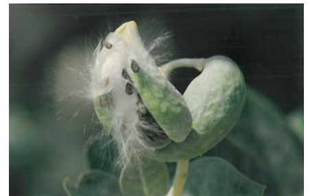
Seed pod of Calotropis procera (open to show seeds)

The kidney-shaped fruit or seed pod (technically called a follicle ) is, when opened (a sticky job), found to contain many scores of small seeds, each attached to a silken ribbon that dries and disaggregates to become a mini-parachute of many splayed, silken threads, ready to catch a breeze and glide for long distances. The other UAE milkweeds follow a similar strategy.