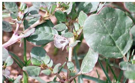
A dark-spotted 'sport' of the grass blue, Zizeeria karsandra

Areas adjacent to the grassy fields were frequently alive with butterflies. On sandy areas with mats of Sesuvium we saw the western pygmy blue Brephidium exilis . Elsewhere, on "weed" species such as Trianthema portulacastrum (Family Aizoaceae) or Tribulus terrestris (Family Zygophyllaceae) we saw many grass blues, generally fresh and vividly colored, with a number mating and several females observed egg-laying on nearby Amaranthus sp.