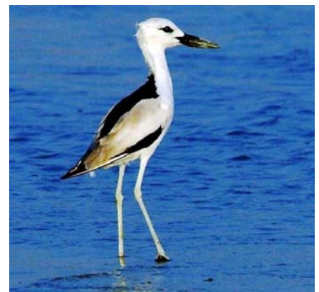
The crab plover's huge bill is always unmistakable

The crab plover is easily distinguished in flight by its fully black back and flight-feathers. At rest, it carries its head low (like a gull), but when on alert or in flight, it extends it up or forward on a stretched neck. The juvenile has a grey rear crown and plumage of a