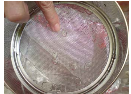
Salps - strings of these little creatures found in the sea break up easily

Angela Manthorpe has provided the answer to Willy Meyer's question about the strings of tiny jelly creatures in the sea at this time of year. They are probably salps. A salp is a free floating tunicate and is barrel shaped. The brown spot that can be seen with the naked eye is the salp's stomach.