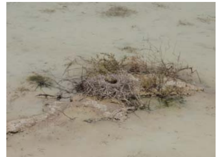
Nest of black-winged stilt at Ramthah wetlands

Plans exist to develop the area in a more sanitised and conventional way as the Al-Wasit Nature Reserve, but these have not progressed to date. In the meantime, nature has taken matters into her own hands. Now the area is home to a small number of characteristic and interesting local species. A few pair of black-winged stilt Himantopus himantopus still breed there. Chicks and active nests with speckled eggs could be observed in mid-summer, the nesting parent birds repeatedly dipping their chests in the shallow ponds before returning to their nests to moisten and cool the eggs.