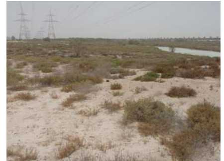
Ramthah wetlands with powerlines and saline pools

Ramthah wetlands, an area of drainage accumulation (and tidal probably tidal seepage) on the Sharjah-Ajman border, was once one of the UAE's premier bird-watching sites, under the official protection of the government of Sharjah. The imperatives of development were not kind to the site, which suffered the side effects of highway development, powerline installation and dehydration (partly, it must be admitted, due to the cessation of wastewater dumping by tankers).