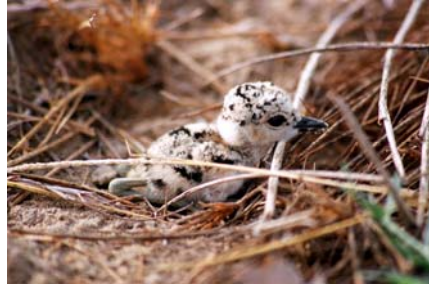
White-tailed plover chick

cious inspection revealed two chicks among the cover of newly planted palms. The spotted, downy chicks, already with incongruously long legs, hunkered down in palm debris and tolerated a few quick photos. The nest and chicks cannot have been unknown to the gardeners who tend the site, so it is comforting to know that the birds have been unmolested, and perhaps even encouraged.