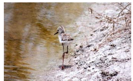
Young black-winged stilt at Ramthah wetlands.