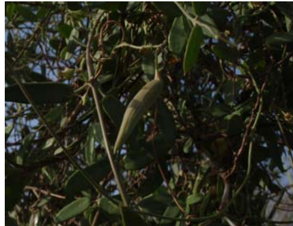
Seed pod of Pentatropis nivalis

shaped fruit of the climbing milkweed vine Pentatropis nivalis and the elongated fruit of the large, desert-dwelling broom bush Leptadenia pyrotechnica .