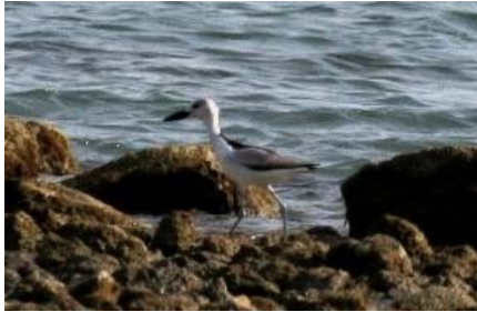
Crab plover crabbing

duller contrast, lacking the striking pattern of the adult. At all ages, the bill is black, paler at base. The legs are dark-coloured, strong and sturdy.