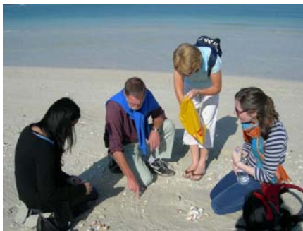
Shelling on 'Black Palace Beach'

Members are reminded that DNHG field trips are cooperative ventures among the participants, for their mutual benefit and enjoyment. DNHG field trip leaders are not normally professionals or experts, but fellow members who have agreed to share their time and their knowledge with other participants, on a volunteer basis. The relationship of trip leaders and participants is that of co-venturers, not professional and client. For these reasons field trip participation is limited to DNHG members and their bona fide non-resident guests.