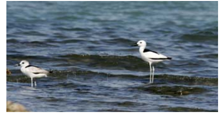
Crab plovers

The crab plover ( Dromas ardeola ) is considered to be one of the most extraordinary waders because of what it eats, the nest it builds and its largely nocturnal habits.