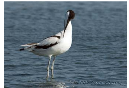
Avocet grooming itself

At 33–36 cm of body length and with a wingspan of 75–78 cm, it is a beautiful bird that birdwatchers are delighted to spot. It has a very large bill and a heavy head, which seem to be out of proportion to the rest of its body. Its plumage is black and white and on the ground, it somewhat resembles that of the avocet ( Recurvirostra avoceta , also found in Masirah, usually during spring migration).