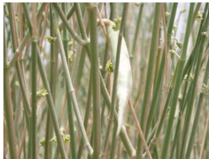
Seed pod of Leptadenia pyrotechnica