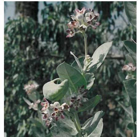
Seed pod of Calotropis procera

Most members will be familiar with the large and attractive milkweed Calotropis procera , also known as Sodom's apple. It is particularly common in the low sands of the northern Emirates, especially on waste ground or overgrazed terrain, and flowers through the summer.