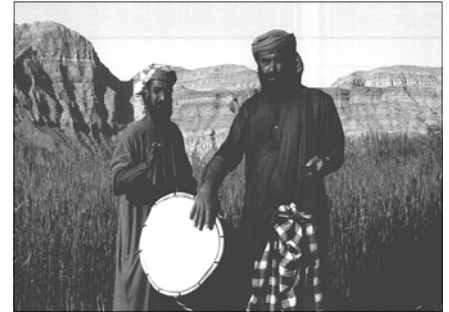
Photograph, uncredited, from Gazelle , June 1998. It was taken during a field trip to the Ru'us Al Jibal, and is an example of the treasures housed in the DNHG library

technician. As a precaution, it is advised to phone (04 315 5145) in advance to be sure that there is not a meeting taking place in the workroom.