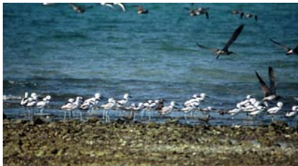
Crab plovers, whimbrels and godwits in Dawwa

The crab plover is an essentially maritime wader, occurring on coastal isles, coral reefs and mud- or sandbanks. It nests in dense colonies, in sandy ground close to the sea, usually on islands or coastal dunes. The nest is in a chamber at the end of a tunnel 120–188 cm long, excavated by the birds themselves.