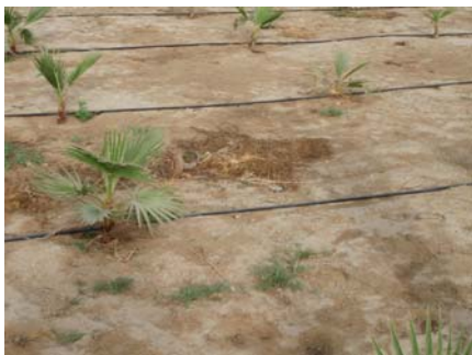
Nesting area of white-tailed plover

The white-tailed plover was relatively new to the UAE in the mid-1990s, associated particularly with the former "Wimpey Pits" where it was considered a potential breeding species. It is now a regular at the Pivot Fields, feeding in the low grass and readily distinguished by its yellow legs. It is believed to have bred there for a number of years. As we walked slowly along the vehicle track at one point, an adult began to circle above us, calling. The bird was obviously serious, but as 'harassment' its performance was ineffective against UAE naturalists inured to the much more raucous and persistent efforts of its relative, the red-wattled plover.