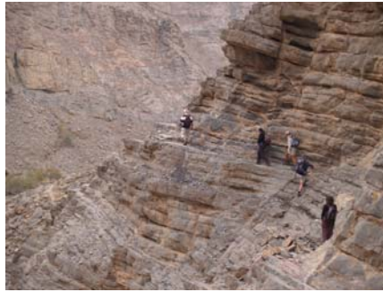
Musandam mountain hike

to sponsor field trips or to recruit volunteers to lead them.