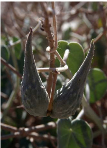
Seed pod of Pergularia tomentosa

The other is the twining dwarf shrub, Pergularia tomentosa , which favours disturbed ground and features widely spaced, heart-shaped leaves. Its fruits are typically in pairs.