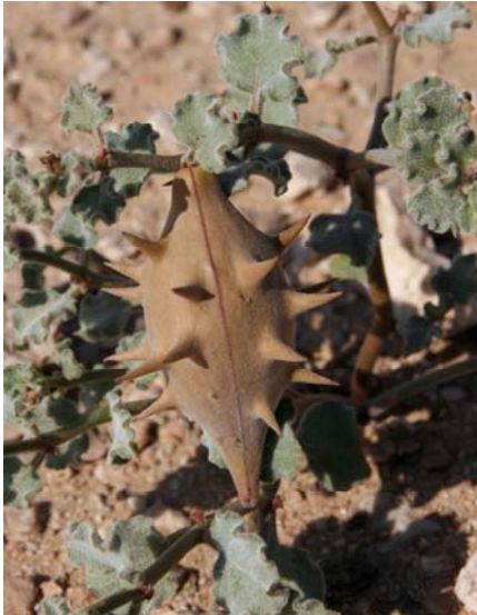
Seed pod of Glossonema varians

Angela Manthorpe recently encountered the fruits of two other milkweed plants (Family Asclepiadaceae) that are much less common but equally interesting and unforgettable. One is the small, wrinkly leafed Glossonema varians .