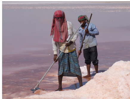
Salt collectors, Masirah Island, Oman

Heat exhaustion may result from either too little water or too little salt, but the body's reaction to the two phenomena is very different. Lack of water produces thirst, and a person drinks and recovers. Salt depletion, on the other hand, produces neither thirst nor a craving for salt. The victim feels unwell, but doesn't know why. Initial symptoms of salt deprivation include lassitude, apathy, headache and muscular weakness. These may be followed by giddiness and fainting, and finally by anorexia and vomiting, which themselves impede re-hydration. Death from salt depletion may often have been misdiagnosed, especially if it was accompanied by another illness, e.g., typhus.