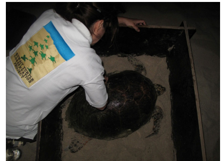
Cleaning prior to gluing on the transmitter

Within a few hours on the night of the 24 th May, two hawksbill females crawled out on to the south beach to dig nests and lay eggs.