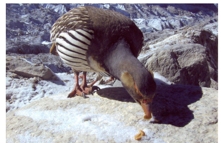
Himalayan snow cock seen on higher slopes

Individual group sizes will be a maximum of 5/6 birders plus 2/3 urban school/college students, plus local village youths and forestry staff. Each group is encouraged to interact with local village elders to generate a list of vernacular names and to document oral folk knowledge.