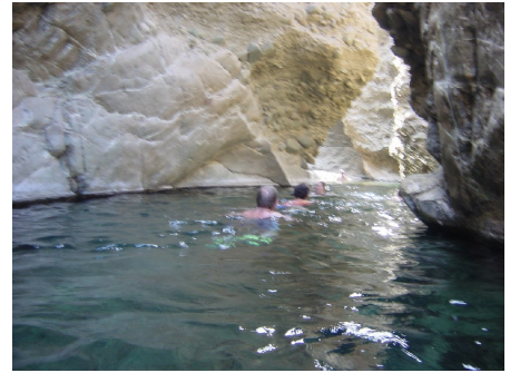
Swimmers in Wadi Wurayah in 2006 enjoying the benefits of a Pacific El Niño

the SOI pattern through its proximity to the Indian ocean.