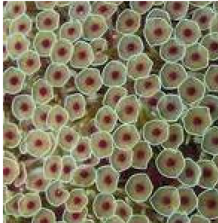
The flower-like 'little feet' of T. pileolus

rocks or coral should wear protective footwear. The recommended treatment is immersion of the affected area in near-scalding water (just below 50 degrees C). DNHG members will recall that the late Dr. Sandy Fowler recommended carrying a thermos of hot water when beachcombing. I didn't know we had this species here, but perhaps some of our members who are SCUBA divers may be able to tell us more."