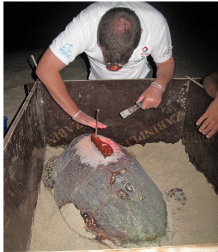
then transmitter ...

In Garouh, a few days later, on a quiet evening at very low tide, another small hawksbill crawled out of the water in front of the Coast Guard station and looked for an appropriate place to nest. She changed her mind and, as she was returning to the water, the KTCP team attached a satellite transmitter on her. Najat, this third turtle, was seen attempting to nest the next night and finally laid her eggs in a shallow nest in front of the Coast Guard Station.