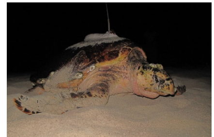
Nada ready for sea again

tion may not only improve turtle conservation but also the conservation of fisheries and coral reefs.