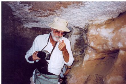
The author in a salt cave near Ghaba, Oman

As the process continues, the brain will be starved of blood, causing fainting and eventually total unconsciousness. Since it is impossible to feed or re-hydrate an unconscious person except intravenously, death often ensues.