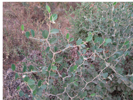
A thicket-forming Ziziphus species

[*The book as a whole is an extended personal essay on the tax levied by the British on the manufacture and trade in salt within colonial India in the 18 th and 19 th centuries, and in particular the erection in the 19 th century of a nearly 2,500 km barrier to prevent salt smuggling and tax evasion. Some 1,100 km was a live hedge of thorn bushes, including species of Ziziphus (the genus of the local sidr tree and the Indian jujube .) The essay is interwoven with the tale of the author's personal search for modern day remains of the hedge.]