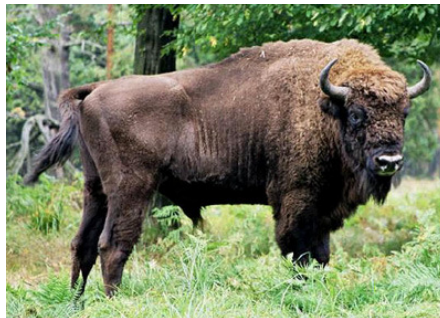
Zubr, Bison bonasus

freely whilst a small number are kept in enclosures.