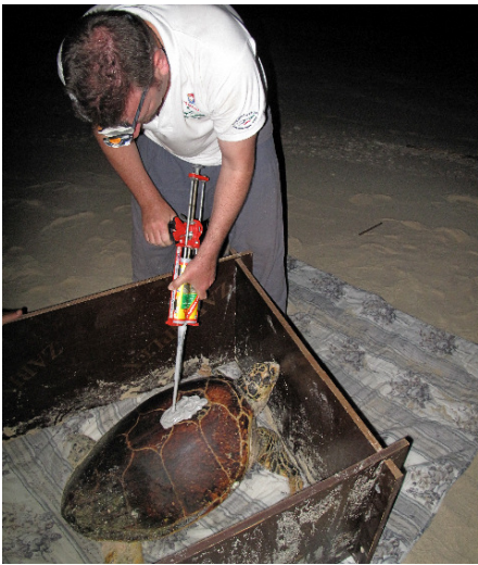
First glue ...

Dareen had not nested when intercepted by the tagging team, but came back to nest successfully the following night, her transmitter safely on her carapace.