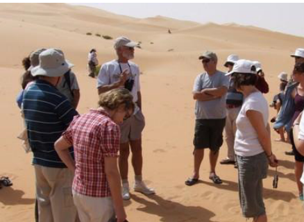
In the dunes, west Liwa

Members who attended this year's Inter-Emirates Weekend, hosted by ENHG Abu Dhabi at the Tilal Liwa Hotel reported a wonderful weekend with a varied and interesting programme. Thanks to ENHG Abu Dhabi!