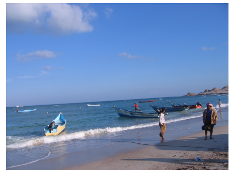
The boats to Shu'ub

"After a cat wash, we went off to the fishing marina of Qalansia where three fishing boats were awaiting us. Within a short time, off we went to explore another beautiful part of the island. One of the boats exercised a "man overboard manoeuvre"; a passenger's walking stick was chucked out by the skipper who considered it garbage. Hearing the protest, he turned around and successfully rescued the faithful aid.