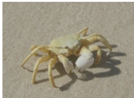
One of the many crabs on Qalansia beach

We reached Qalansia beach late morning, and most of the group walked from the village back to the campsite, shelling and swimming on the way. The sea was calm, the beach white and deserted.