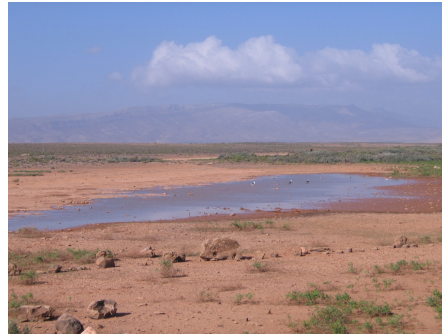
Pool with variety of birds