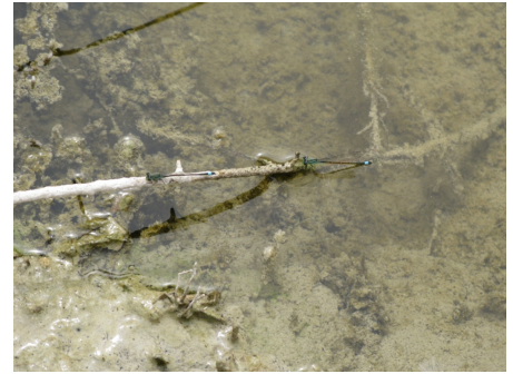
Male damselfly (left) and crossdressing female

Within another minute, the pair attempted copulation in the wheel position; the male grasped the female's neck but the (androchrome) female seemed only half-hearted and failed in her efforts to maintain a reciprocal hold on the male. Three times in the course of several minutes the tandem pair fell onto the surface of the water in the channel, but each time they were able to take flight and find a perch. In the end, however, they disengaged and went their separate ways, evidently without consummation.