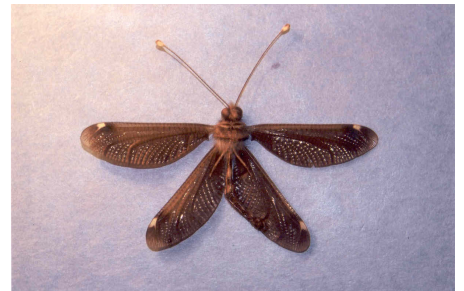
Brown-winged owl fly, male Ptyngidricerus venustus

Ants (Family Formicidae) are also included, making Vol. 4 the principal reference for UAE ants, as far as I am aware, although armchair entomologists may find it difficult to distinguish most ant species confidently using the photos of laboratory specimens, as good as they are. Easier to recognize from their photographs are two distinctive organisms that have languished unidentified in my photo collection for many years: a brown-winged owl fly Ptyngidricerus venustus (Family Ascalaphidae), and a long-nosed ribbonwing Halter nutans , Family Nemopteridae.