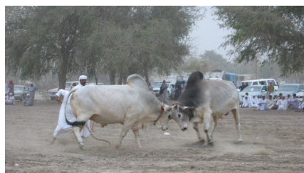
Bull pushing, Fujairah

Members are reminded that DNHG field trips are cooperative ventures among the participants, for their mutual benefit and enjoyment. DNHG field trip leaders are not normally professionals or experts, but fellow members who have agreed to share their time and their knowledge with other participants, on a volunteer basis. The relationship of trip leaders and participants is that of co-venturers, not professional and client. For these reasons field trip participation is limited to DNHG members and their bona fide non-resident guests.