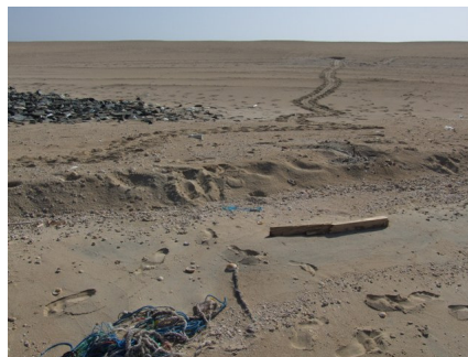
Turtle tracks leaving the beach

But, to our great surprise, we spotted a fresh turtle track crisscrossing an area of the beach, leading inland, turning back towards the sea and then ending in a clearly recognizable nest !