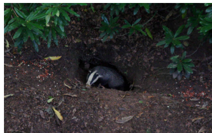
Badger in sett

Sometimes, they do keep their feet on the ground. En route to Costa Rica, they visited the Lancashire Badger Group and spent two hours watching a group of five badgers – a parent and four cubs – at a sett by the River Ribble.