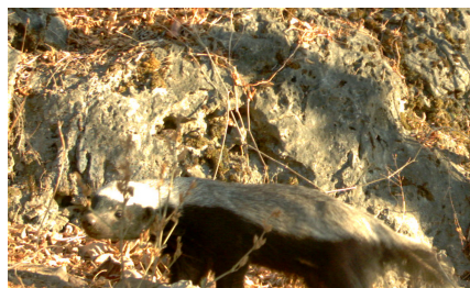
Honey Badger