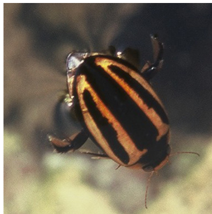
Striped predaceous diving beetle Hydaticus (Prodaticus) histrio