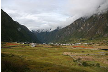
Langtang Village

Arrangements for this are now finalised. It is a very small group, but Sonja is still speaking to us. Now we can only look forward to hearing about it.