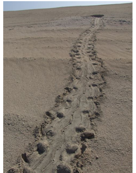
The very distinctive tracks

We came to the conclusion that the turtle was one of the critically endangered hawksbill turtles as the traces clearly showed that the turtle moved along the beach by alternately sweeping the left and right fore flippers backwards. A green turtle would have left horizontal flipper traces exactly parallel to each other.