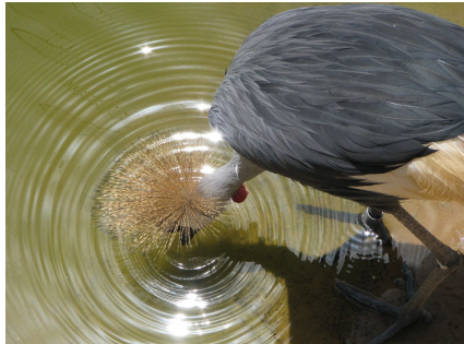
Grey crowned crane, at Al Ain Zoo

No details available yet - might be an evening trip, when the animals venture out of shelter. Watch this space (or watch for an email). This is one for the whole family, too.