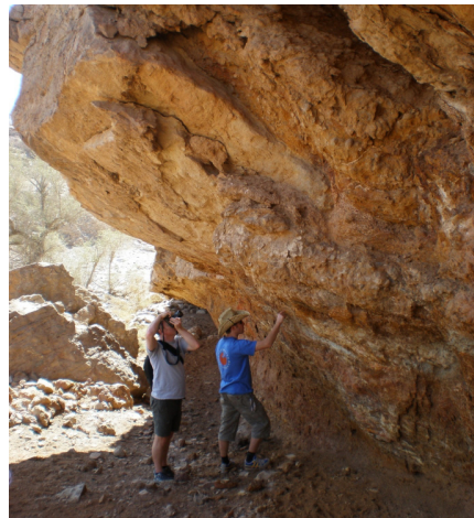
In Donkey Fox Wadi