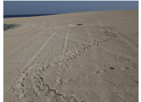
The tracks led to a nest

observed instances of turtles nesting on any of the artificial islands in the area. So finding this nest was really special and extremely good news. It seems to indicate that marine wildlife may slowly accept artificial islands as 'natural' habitats.