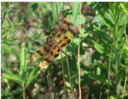
Celithemis eponina , the halloween pennant, an attractive dragonfly of the eastern U.S.A.

Taking advantage of his first summertime visit to the US in many years, Chairman Gary Feulner conducted a spare time survey of dragonflies and damselflies at various ponds and marshes in his native area on Long Island, in the New York suburbs. This turned up a total of 21 species - 15 dragonflies and 6 damselflies. In contrast to the typical situation in the UAE and Arabia generally, it proved possible to make a confident identification of all of the observed species by reference to printed guides and internet sources. A few species were surprisingly showy -- resembling those more characteristic of tropical or subtropical regions.