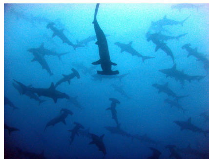
Shark soup at Cocos Island

do justice to the huge number of hammerheads that we saw at Cocos, along with whale sharks, eagle rays, tuna, Galapagos and tiger sharks. Now, we are embarking on a yacht to sail, via the San Blas islands, to Cartagena in Colombia."