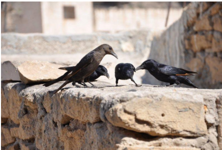
Tristram's grackles at the house on the coast

breeding and short-toed eagle which may also breed. Other typical birds of the region recorded were Lichtenstein's sandgrouse, African scops, Hume's desert eagle and little owls, black-crowned tchagra, African paradise flycatcher, Arabian warbler, Abyssinian white-eye, Tristram's grackle (extremely common down to sea level and collecting scraps from houses), blackstart, long-billed pipit, golden-winged grosbeak (regarded as an endemic by some) and cinnamon-breasted bunting.