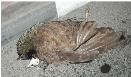
The beautiful peahen on the road

En route to the scene of the accident (we hoped it was an accident, not bird 'flu), Gary recalled that he had very recently seen a number of peahens on the adjacent and attractively landscaped grounds of Emirates Towers, some so tame that they perched beside groups of lunching labourers and were unfazed by a passing jogger.