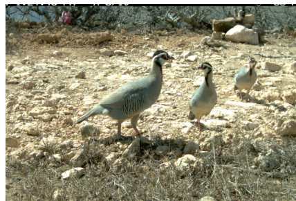
Arabian partridge