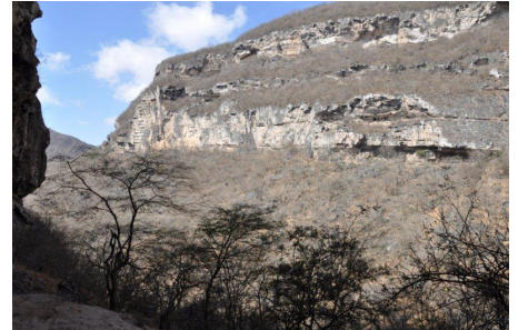
In eastern Yemen, near where the first leopard was captured on film