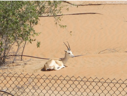
Sand Gazelle, seen along the desert roads leading back from the Liwa

Both studies looked at population dynamics, a matter of particular concern for management of the herds at Mahazat as-Sayd. The reserve is fenced and, although it is very large, in a wild state the Sand Gazelle populations would migrate over even larger areas in response to rain and forage availability.