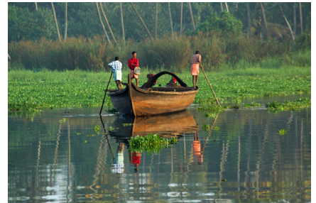
Along the backwaters, Kerala