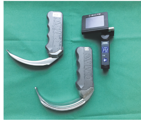
FIGURE 1: C-MAC PM®. C-MAC PM® videolaryngoscope (right), D-Blade® (middle), and Macintosh blade size 3 (left).

Preoperative airway evaluation was carried out by assessing the Mallampati score, thyromental distance, cervical spine clearance, and interincisor distance. Difficulty was defined as a Mallampati score III or IV, thyromental distance of <6.5 cm, reclinatio