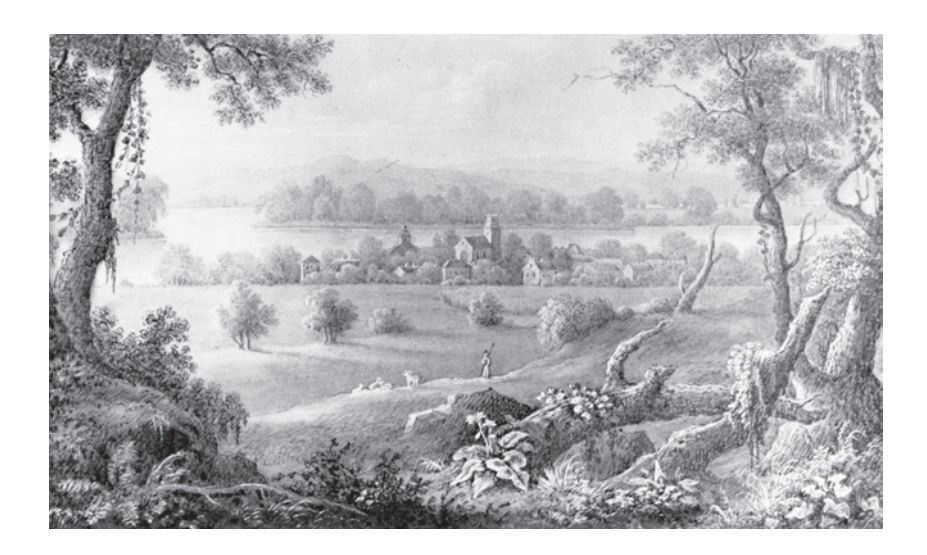
Fig. 2. 'New Harmony'.

social mission in New Lanark was meant to be accomplished with the help of the government<sup>28</sup> or of political parties, his new experiment was insularly located within the society and maintained without the idea of governmental support. Moreover, whereas 'New Lanark' conformed to the interests of the government, 'New Harmony' was designed to break with the existing society. He intended it to constitute the perfect microstructure of the future society, that is, his experiment was meant to be only the beginning of a large-scale extension of his concepts from the insular realm of 'New Harmony' to the whole society.<sup>29</sup> A closer look at the constitution and development of this newly founded community might show how the tension within nineteenth-century society was conceptualized and how it might be understood or even criticized from today's perspective.