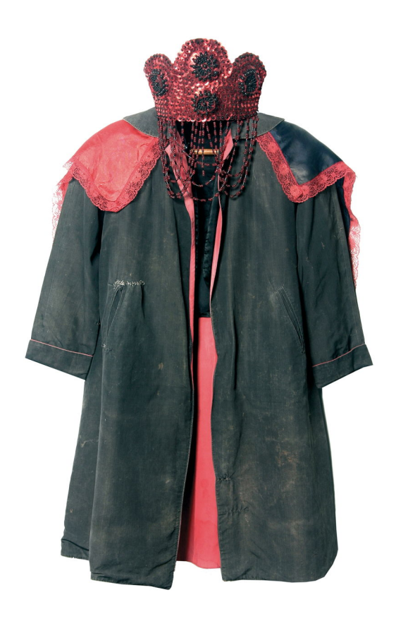
Figure 5. Capa de Exu (Exu Cape), Museu Bispo do Rosário Collection.

to word and language, as well as to time, travelling between past and present, and deeply connected to \it ancestrality.^{33}