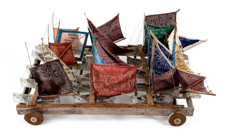
Figure 1. Vinte e Um Veleiros (Twenty-One Sailboats), Museu Bispo do Rosário Collection.

In this sense, I would like to suggest, inspired by the reflections of other contemporary thinkers, to look at Bispo do Rosário's production through the prism of decolonial critique and blackness. I propose to emphasize an aspect that was for a long time avoided in the analyses of Bispo's works, namely, that they are produced by a black man, in a society profoundly marked by racist and colonial elements.<sup>10</sup> The many ships he produced throughout his life can be read as part of an 'ecology of the ship'. They constitute forms that deal with, that assemble, and reassemble mnemonic elements inscribed in his body.