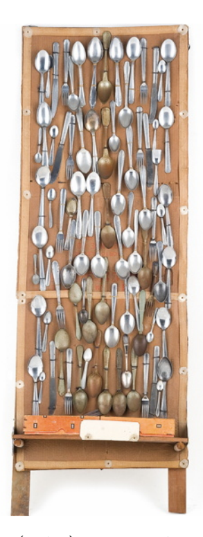
Figure 3. Talheres (Cutlery), Museu Bispo do Rosario Collection.

Bispo also created mantles and cloaks, sceptres, different kinds of maps, small installations, miniature representations of things on Earth (kites, carousels, ox carts, etc.), pieces, sashes, and tissues about Miss World pageants and participants — that construct a 'Pop Geography', according to curator and art critic Paulo Herkenhoff.<sup>25</sup> The works on fabric constitute often very complex, detailed, and repetitive embroideries. Among the mantles, one can find the 'Exu cape' or the famous 'Mantle of presentation', which he worked on for several decades. On the inside part of the latter, he inscribed the names of people he chose