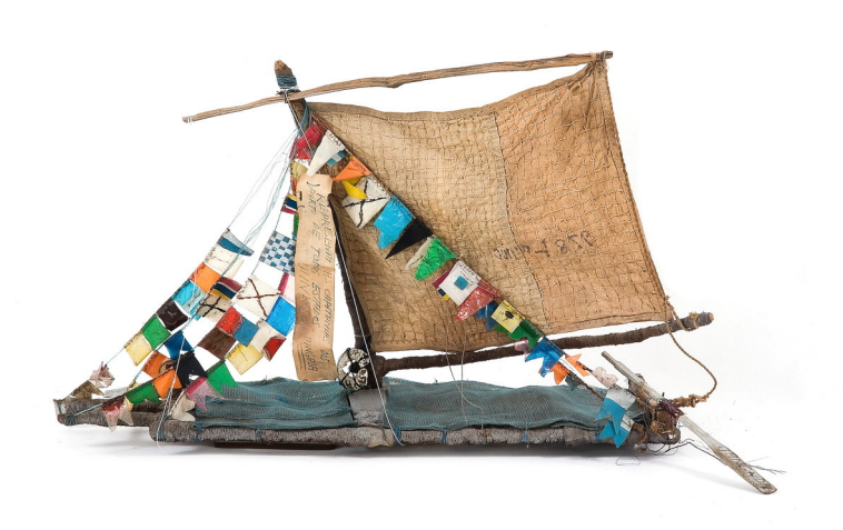
Figure 7. Jangada (Raft), Museu Bispo do Rosario Collection.

tries to obliterate the memory, there is such a thing as the weather , the atmosphere, where these questions and traces remain present. More than haunting, they structure the space, the world in which one lives; they give form to this 'one ecology of the ship that continues into the present.'<sup>41</sup>