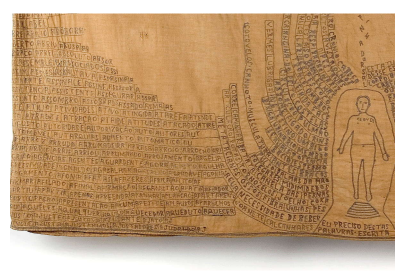
Figure 2. Above: Eu Preciso Destas Palavras. Escrita (I Need This Words in Writing), Museu Bispo do Rosário Collection. Below: Detail.

1939, becoming patient number 01662. As a typical poor, black figure of Brazilian society, he was just another person without a name, history, or identity — a mere black 'indigent', according to the police