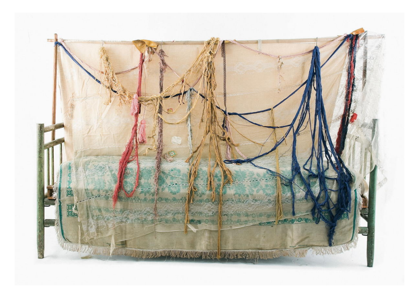
Figure 6. Cama de Romeu e Julieta (Romeu and Juliet's bed), Museu Bispo do Rosario Collection.

oceans of history. I think it is no mere coincidence that ships are so recurrent in his artistic representations and productions — as well as in those of the other artists who are part of the Lugares do delírio exhibition.