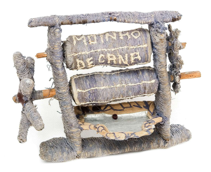
Figure 4. Example of an O.R.F.A (object wrapped by blue threads): Moinho de Cana (Sugar cane Mill), Museu Bispo do Rosário Collection.

This task of creating an inventory of the world follows a logic of a 'poetic of accumulation' or of repetition through which he aims to repeat in order both 'to understand' and 'to include himself in history (which excluded him)'. The inventory process is 'his way of rewriting the world'. Flavia dos Santos Corpas identifies in Bispo's production three types of actions — 'extracting', 'reuniting', and 'registering'. Through these actions, Bispo creates a very complex and coherent