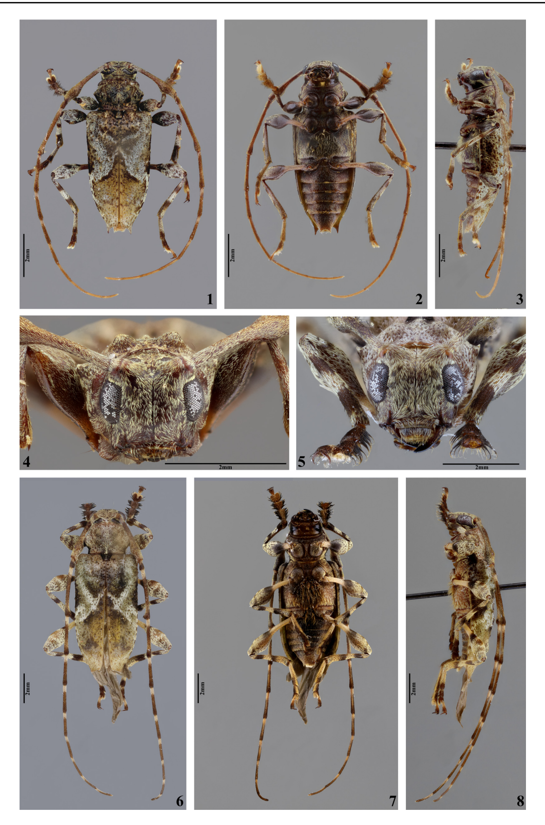
Figs 1–8. 1–4 . Alcathousiella giesberti sp. nov. Holotype, ♂ (FSCA). 1 . Dorsal habitus. 2 . Ventral habitus. 3 . Lateral habitus. 4 . Head, frontal view. 5–8 . Alcathousiella polyrhaphoides White, 1855. Males from Bolivia (FSCA). 5 . Head, frontal view. 6 . Dorsal habitus. 7 . Ventral habitus. 8 . Lateral habitus.