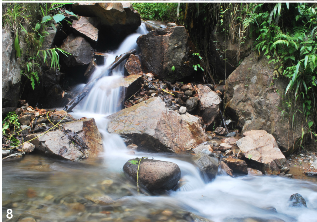
Figures 7–8. Habitat of Thopeutica ( Thopeutica ) petertaylori , new species.