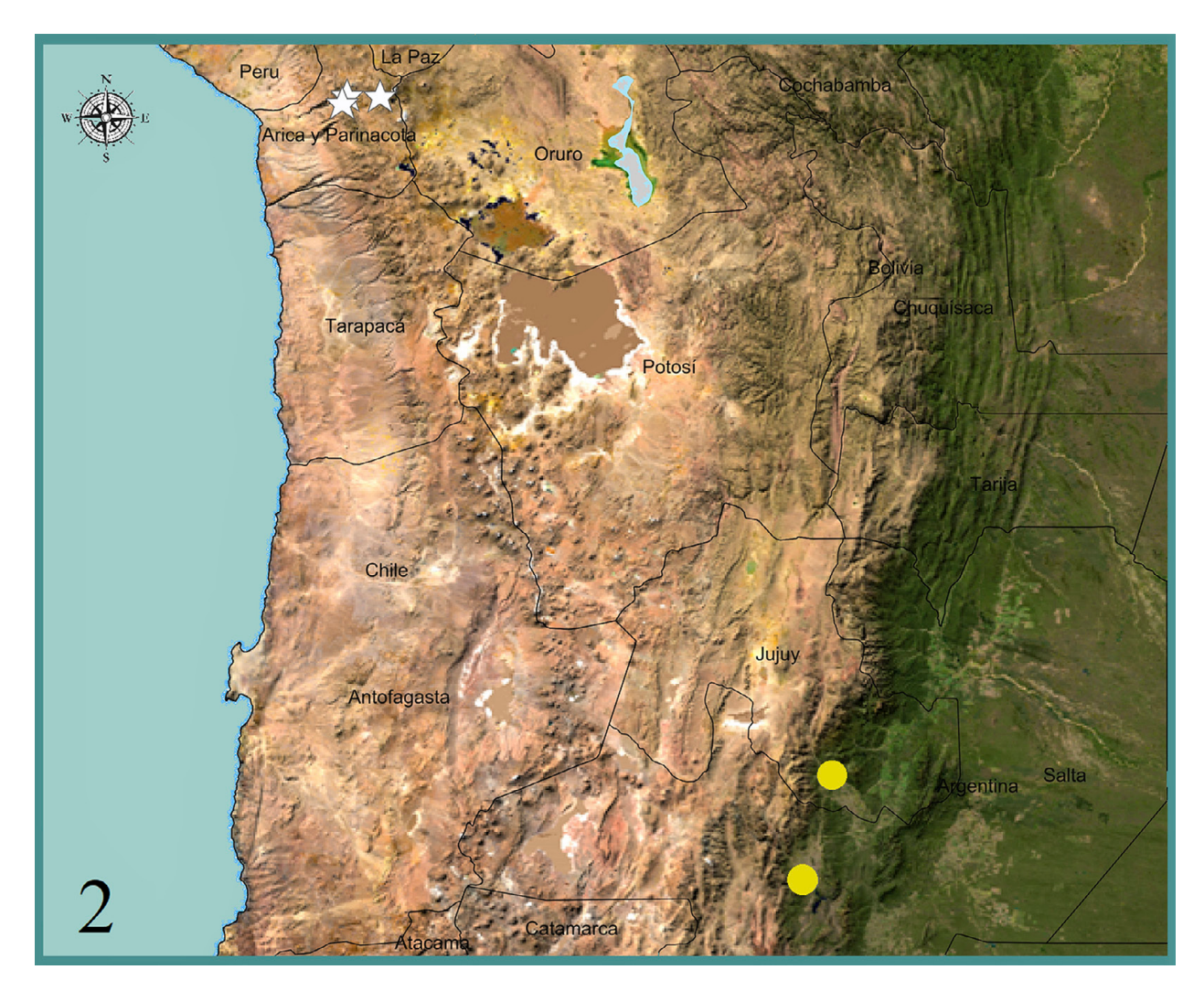
Figure 2. Distribution of Ancognatha aymara in Chile (white stars) and Argentina (yellow circles).