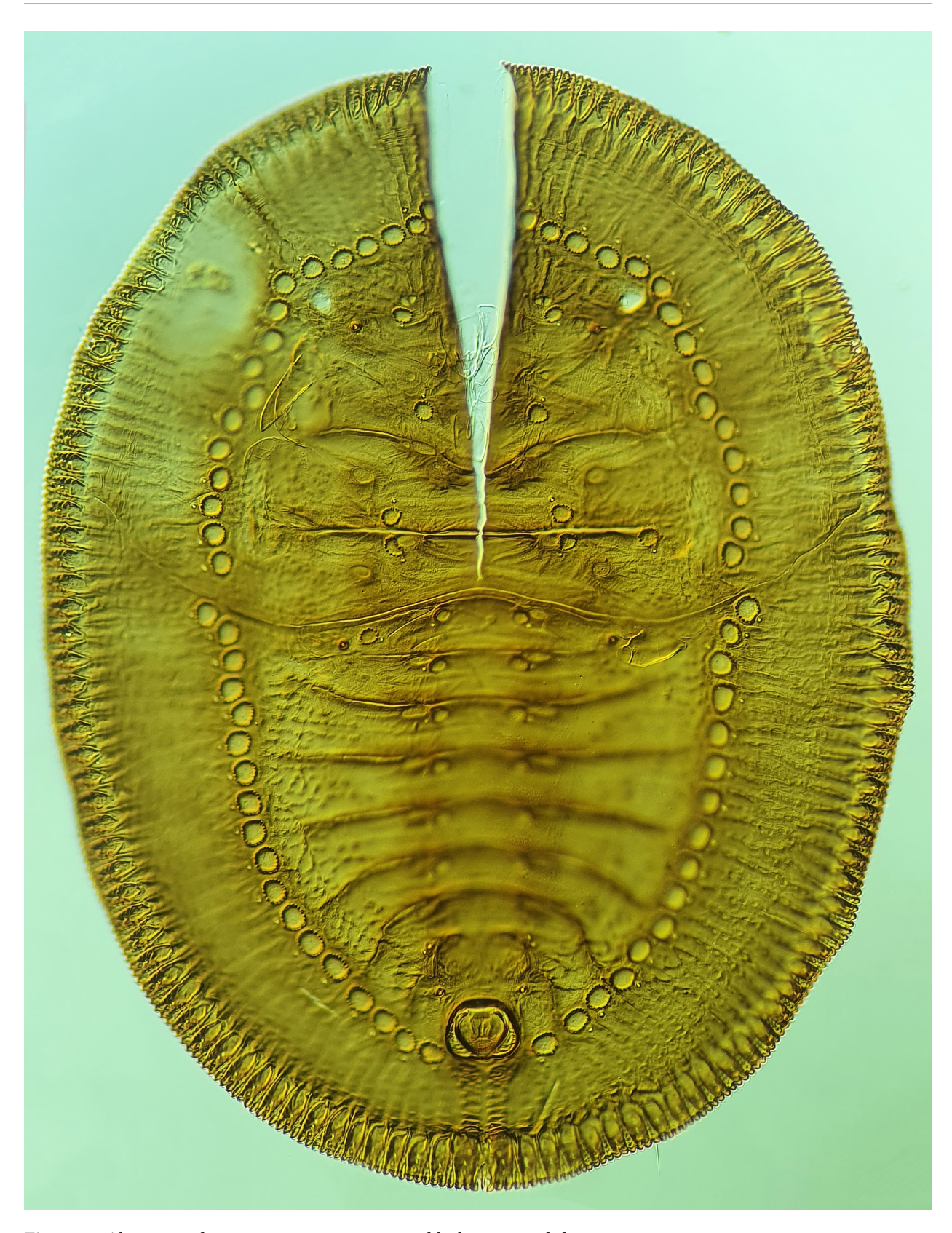
Figure 3. Aleuroparadoxus marisae sp. nov., pupal holotype on slide.