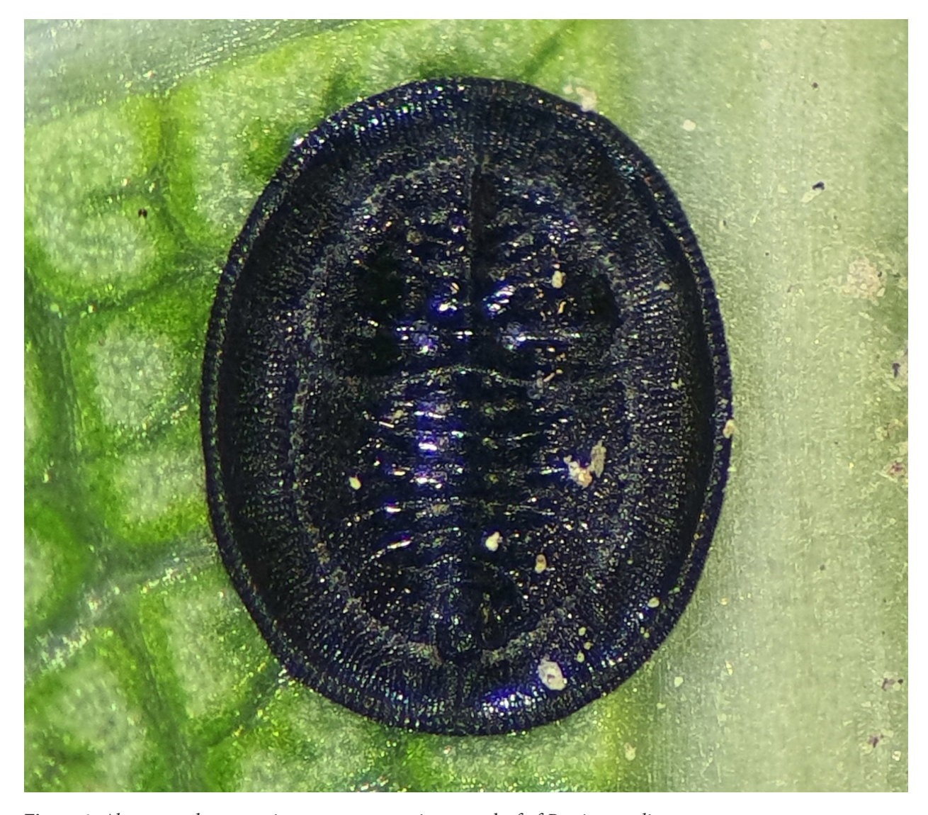
Figure 1. Aleuroparadoxus marisae sp. nov. puparium on a leaf of Brosimum alicastrum.

Type material. Holotype puparium. Guatemala: Petén, Santa Ana, puparium on Brosimum alicastrum , 11.VI.2018, 16.808315° N, 89.827173° W, Col. José García, (deposited in the UVGC). Paratypes: 10 puparia, 5 puparia on 5 slides, data as the holotype (deposited in the UVGC); 2 puparia on 2 slides, data as the holotype (deposited in the USNM); 2 puparia on 2 slides, same information except collection date, 7.VII.2021; 1 puparium