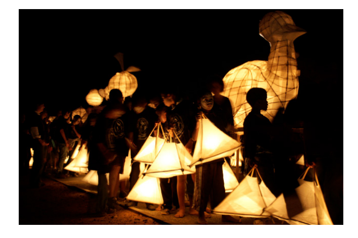
Figures 1 and 2. Moments from two Clanwilliam Arts Project parades and performances, 2014 and 2010.