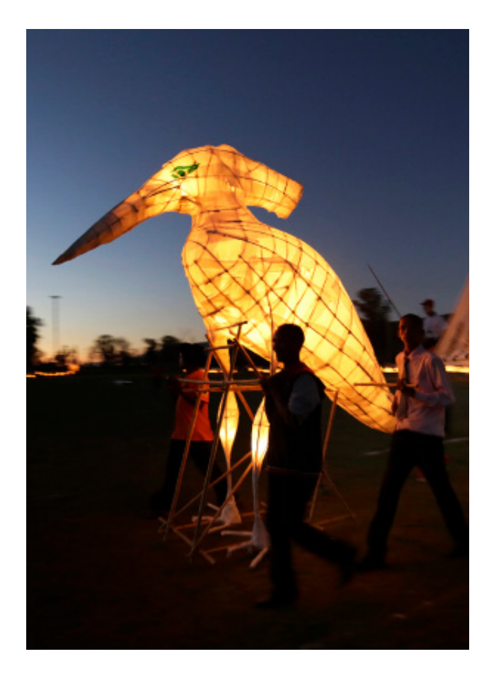
Figure 3. A large light sculpture made for a Clanwilliam Arts Project event, 2014.