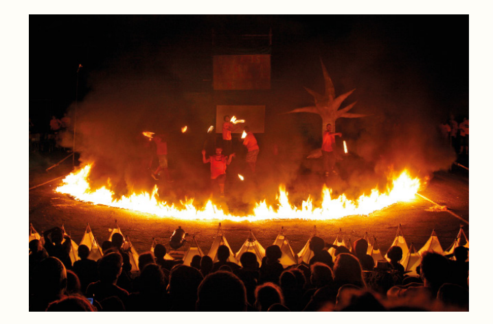
Figure 4. A moment in the performance for the 2010 Clanwilliam Arts Project.