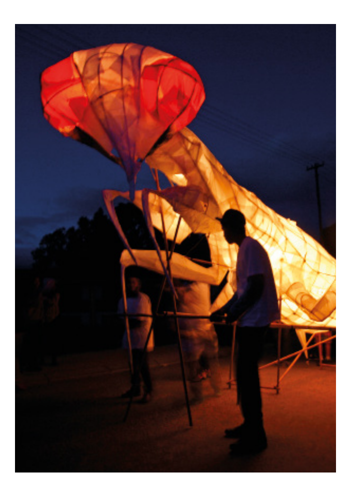
Figure 5. A large light sculpture made for a Clanwilliam Arts Project event, 2013. Photograph by Mark Wessels.

Figure 4. A moment in the performance for the 2010 Clanwilliam Arts Project. Photograph by Mark Wessels.