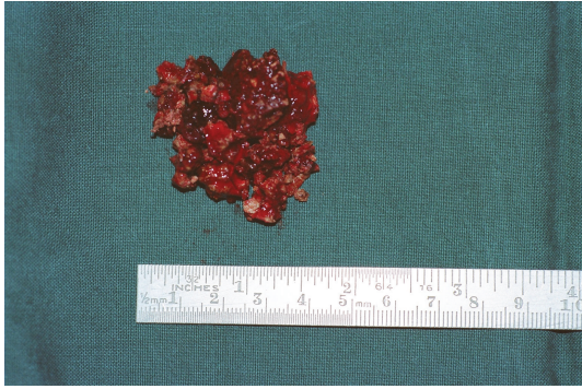
FIGURE 4: Removed rhinolith.

been deposited, can be found. Those rhinoliths that have developed around nonhuman material introduced into the nose and remaining in situ such as cherry stones, stones, forgotten nasal swabs, or similar objects are termed exogenous. Endogenous rhinoliths are those that have developed around the body's own material such as, for example, ectopic teeth in the maxillary sinus, bone sequestrs, dried blood clots in the nasal cavity, and inspissated mucus [19, 20]. Some 20% of the rhinoliths are of endogenous origin [19]. The pathogenesis of rhinolith development has still not been completely elucidated. The following four conditions for the development of such a lesion are generally accepted and recognised.