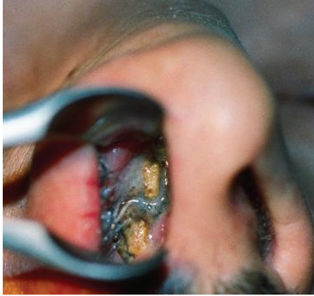
FIGURE 1: Rhinolith in the right nasal cavity.