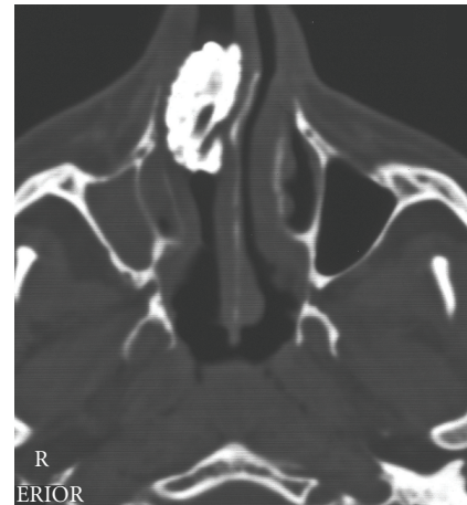
FIGURE 3: Axial CT scan showing the rhinolith in the right nasal cavity, with consecutive shadowing of the right maxillary sinus.

The first published report of a calcified foreign body in the nose appeared in 1654, in which Bartholini described a stone-hard foreign body that had grown around a cherry stone [11]. The term rhinolith was first coined in 1845 to describe a partially or completely encrusted foreign body in the nose [11]. Calcified incrustations in the nasal cavity were subjected to a chemical analysis, first by Axmann in 1829 [12], and thereafter by various other authors [2, 11, 13–17]. In general they comprise 90% inorganic material, with the