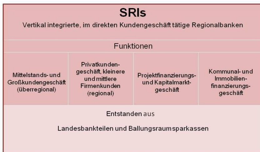
Chart 2: Functions and components of SRIs

The creation of integrated business models leads to competitive units for the private and corporate client business that are able to hold their own in intra-European competition with access to the capital market. Several such regional clusters should be created in order to fulfil the second basic requirement, namely competition. These could constitute an effective competitive corrective to the private commercial banking sector.