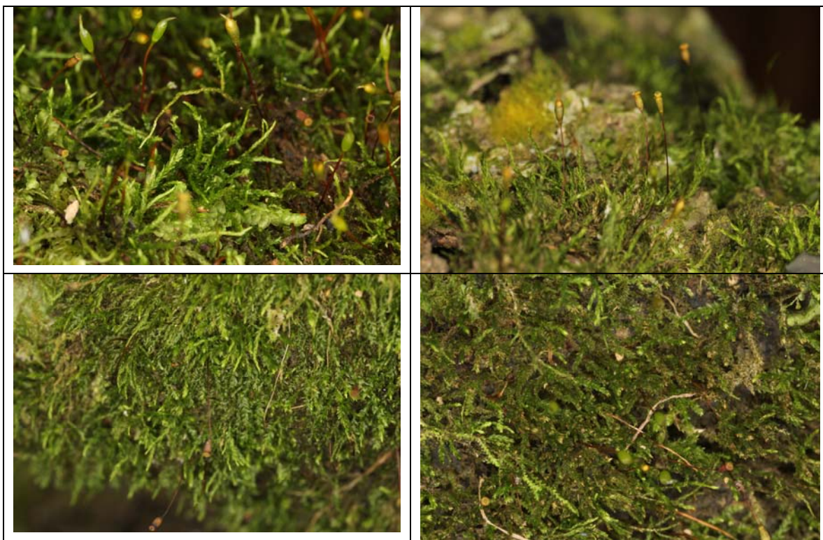
Fig. 4-7: Helicodontium capillare from Dominican Republic.