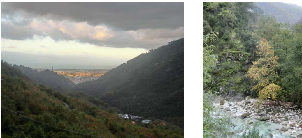
Fig. 1: Massa at the edge of the Apuanian Alps. The locality of Helicodontium is supposed to be in the valley, which consists of schist, and where open rocky habitats are available.

can be excluded as type locality. The inland area (fig. 1) is very steep and difficult to access, here are only two roads in the interior of the mountains, one following a river and ending in a dead end, the other leading to a pass in 1067 m. Open schist is found in several places in the valley (fig. 2). It can be supposed that many bryologists have been searched for this species and the fact that it has never been found again leads to the suspicion that it does no more occur in Europe. The species looks similar as Leskea polycarpa (figs. 3, 4-7). It looks like as if this species was dispersed like other species from the neotropics such as Anacolia laevisphaera or Heterophyllum affine , perhaps by the same volcanic eruption, and disappeared after some time like the latter. Curiously, this species is not mentioned by Cortini Pedrotti et al (1992) in the catalogue of the bryophytes of the Apuanian Alps, although in her flora. In the neotropics, the species is said to grow on tree trunks but also in soil and rocks, preferably limestone (Buck 1998). Duby has also published contributions on neotropical bryophytes and therefore it cannot be excluded that the only record for Europe is based on a so called "label confusion".