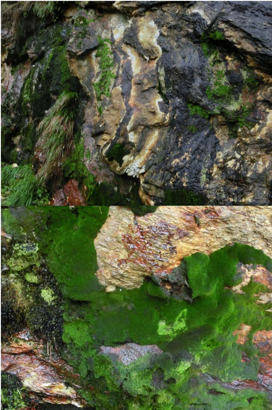
Figs. 4-5: Heavy metal rocks at La Polla, with Scopelophila ligulata (dark green) and Mielichhoferia mielichhoferi (light green).