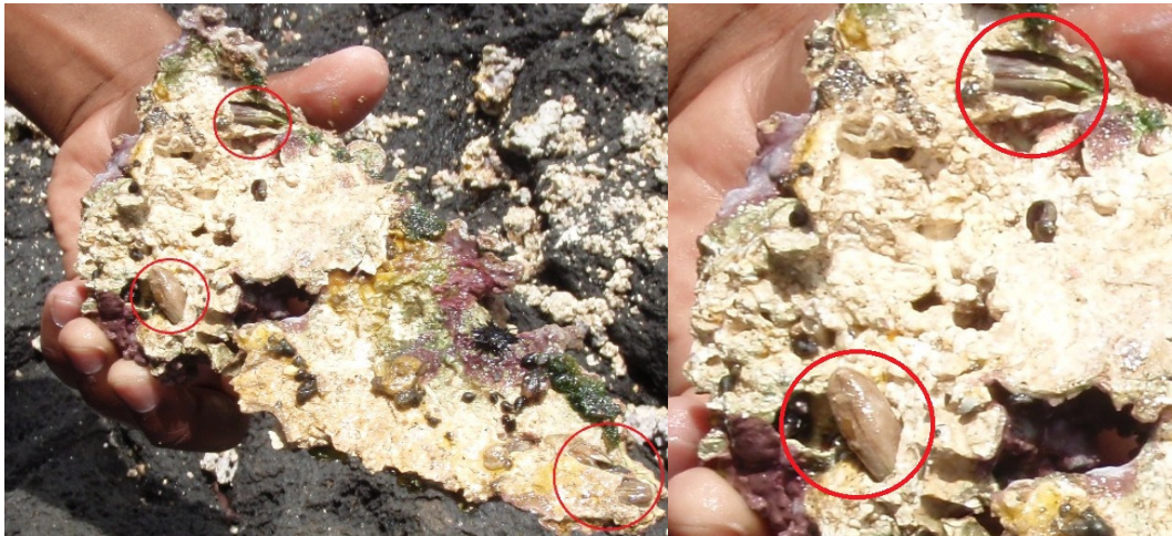
Fig. 2. Leiosolenus aristatus , embedded in coral, Ponta do Sol, Santo Antão, 25 March 2009 (Evandro Lopes).