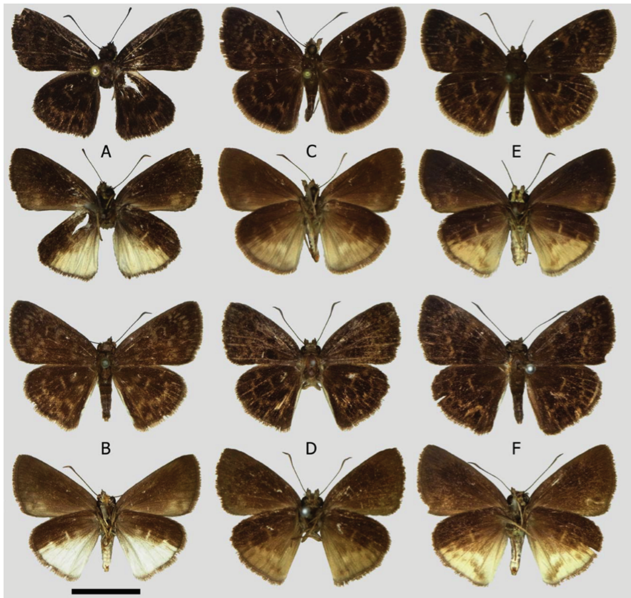
Fig. 2. Adult Ouleus fridericus . A , ♂ paratype of O. f. sheldoni ssp. nov. , Tobago, Arnos Vale, 18 Sep 2011, (J. Morrall) [MJWC]. B , ♀ paratype of O. f. sheldoni ssp. nov. , Tobago, Charlotteville-Speyside Ridge, 15 May 1982 (M.J.W. Cock) [MJWC]. C , ♂ O. f. sinepunctis , Trinidad. Maracas Valley, near Ortinola Estate, in forest, 27 Mar 1979 (M.J.W. Cock) [MJWC]. D , ♂ O. f. sinepunctis , Trinidad, Curepe, 25 Sep 1979 (M.J.W. Cock) [MJWC]. E , ♀ O. f. sinepunctis , Trinidad, Waller Field South, larva collected on Piper sp., adult 30 Sep 1981, Ref. 20C (M.J.W. Cock) [MJWC]. F , ♀ O. f. sinepunctis , Trinidad, San Miguel Valley, old cacao estate, 17 Oct 1979 (M.J.W. Cock) [MJWC].

Etymology. The new subspecies is named after W.G. Sheldon, who first recorded O. fridericus from Tobago, and whose lists of the butterflies of Tobago have been the only ones available for the last 80 years.