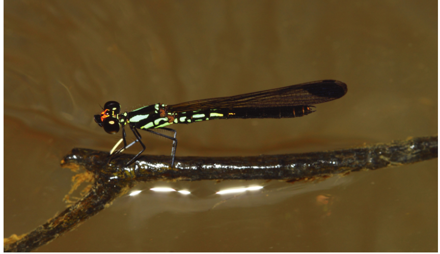
Figure 4. Libellago stigmatizans male, photograph by C.Y. Choong.