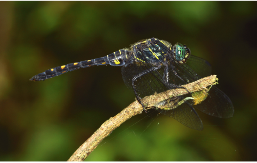
Figure 12. Onychothemis testacea male, photograph by C.Y. Choong.