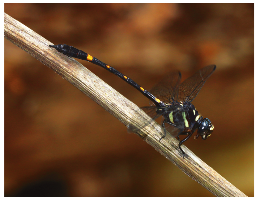
Figure 8. Gomphidia abbotti male, photograph by C.Y. Choong.

9 – 3, 29.viii, CYC; 3, 29.viii, RAD. 11 – 3, 28.viii, RAD.