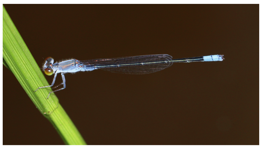
Figure 7. Paracercion calamorum male, photograph by C.Y. Choong, taken at location 5.