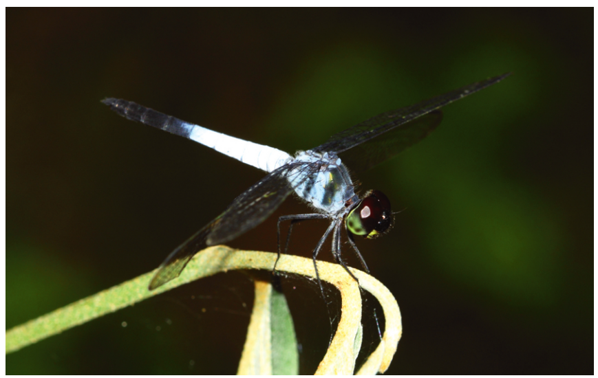
Figure 9. Brachydiplax farinosa A male, photograph by C.Y. Choong.