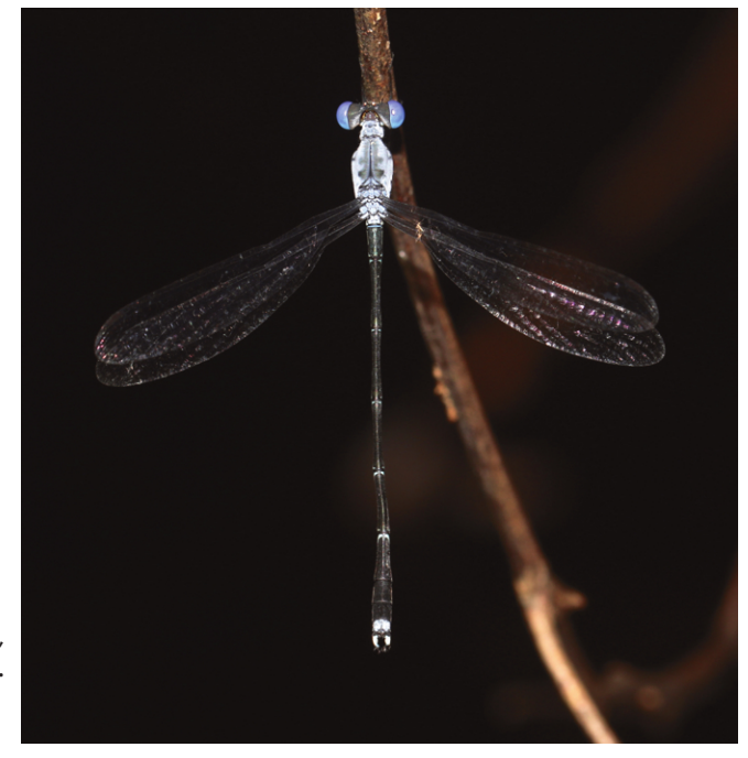
Figure 3. Lestes praecellens male, photograph by C. Y. Choong, taken at location 3.

2 – 3, 26.viii, RAD. 3 – 2 33, 25.viii, CYC; 3 33, 25.viii, RAD; 3, 26.viii, RAD.