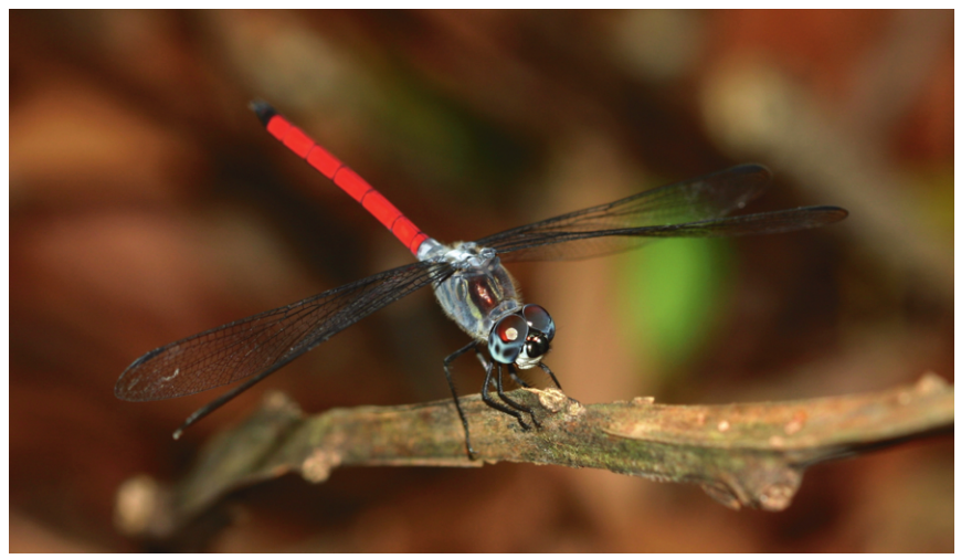
Figure 11. Lathrecista asiatica male, photograph by C.Y. Choong.