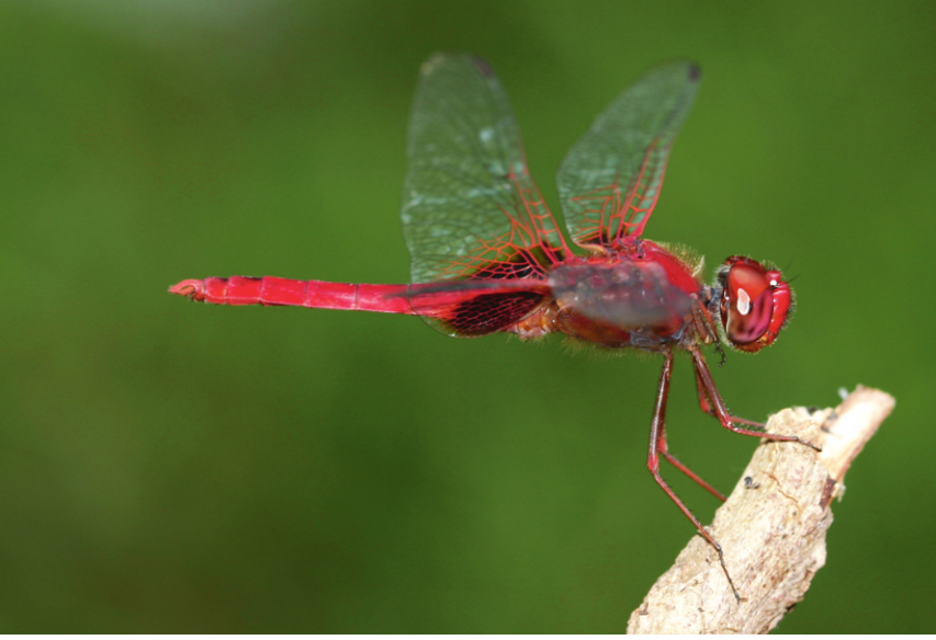
Figure 13. Urothemis signata insignata male, photograph by C.Y. Choong.