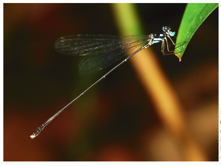
Figure 6. Coeliccia albicauda male, photograph by C.Y. Choong.

7 – 3 ♂♂, ♀, 27.viii, CYC; 2 ♂♂, 27.viii, RAD. 9 – ♂, 29.viii, CYC; ♂, 29.viii, RAD. 11 – ♂, 28.viii, CYC; 3 ♂♂, 28.viii, RAD.